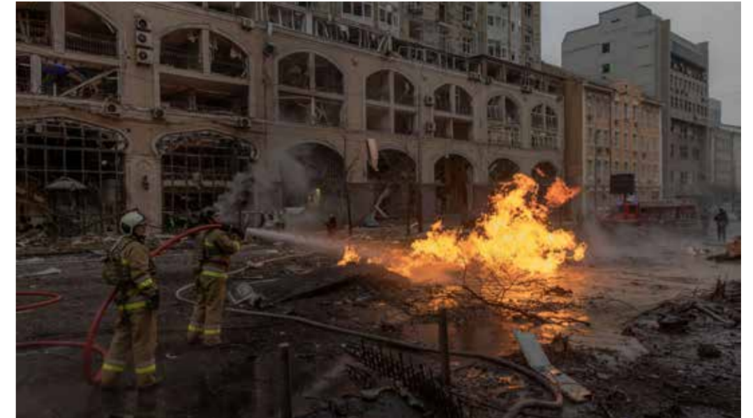
Ukrainian firefighters try to extinguish a fire on the site of a Russian missile attack in Kyiv

Russian missiles targeted Kyiv at sunrise yesterday, killing at least one person and damaging six diplomatic missions and a university in the centre of the Ukrainian capital.