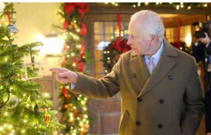
Britain's King Charles III attends The King's Foundation's annual 'Crafts at Christmas' at Highgrove Gardens

Buckingham Palace sources told Sky News that "his treatment has been moving in a positive direction and as a managed condition the treatment cycle