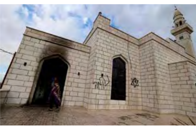
Palestinians inspect the damage done to a mosque

Photographs shared on social media showed slogans