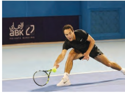
Action from a match

showcased high-level performances that thrilled spectators. Defending champion and top-seeded Tunisian