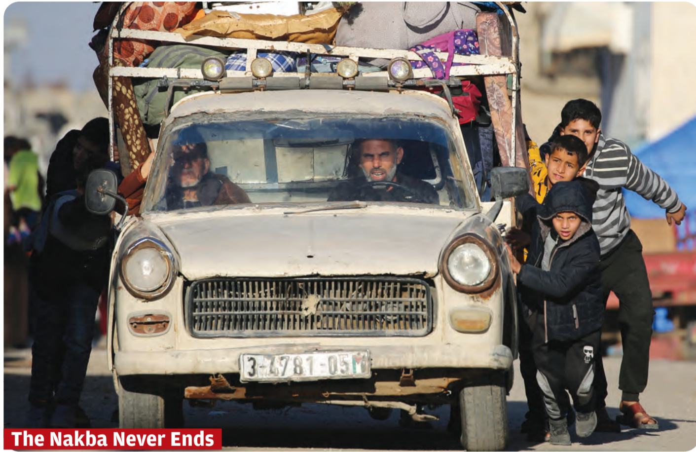
The Nakba Never Ends

Palestinian children help push a car as people evacuate from their homes with their belongings, after received evacuation orders from the Israeli military, at the Bureij refugee camp in the central Gaza Strip, amid the ongoing war between Israel and the Palestinian Hamas movement.