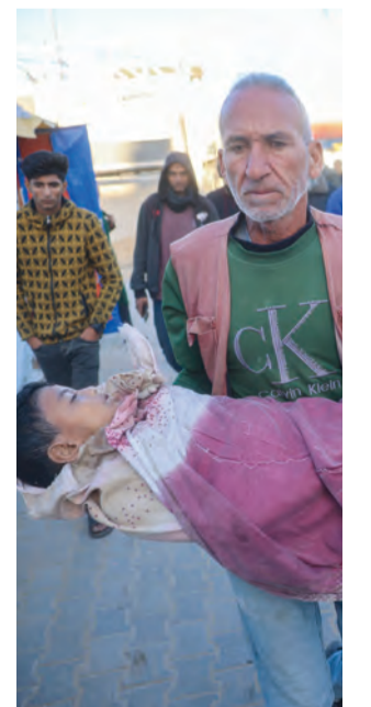
A man carries the body of a boy, killed in an Israeli strike at Al-Maghazi refugee camp

The soldiers also described how division commanders received "expanded powers" allowing them to bomb buildings or launch air strikes that previously required approval from the army's top echelons.