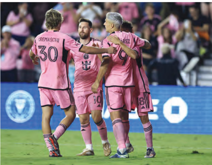
Lionel Messi of Inter Miami celebrates with teammates after a goal (file photo)

Miami will open at home on February 22 against NYCFC -- a match that falls between the team's legs of a CONCACAF Champions Cup series against Kansas City on February 18 and 25.