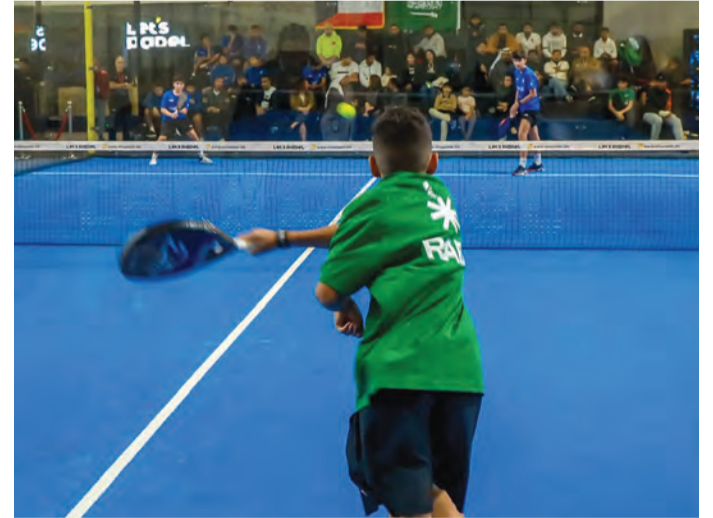
Action from a game

The third day of group stage action saw Lebanon defeat Kuwait 2-1, the UAE overcome Japan 2-1, and Iran sweep Saudi Arabia 3-0. Group A concluded with the UAE topping the standings with four points, followed by Japan with three, and Bahrain with two. In Group B,