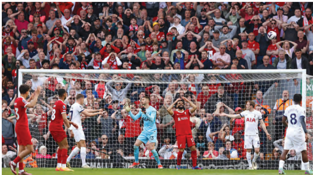
Players of Liverpool and Tottenham Hotspur react during a match (file photo)

cised by some for his unwillingness to compromise on his attacking instincts but he gave a passionate defence of his approach after the match, asking: "Are you not entertained?"