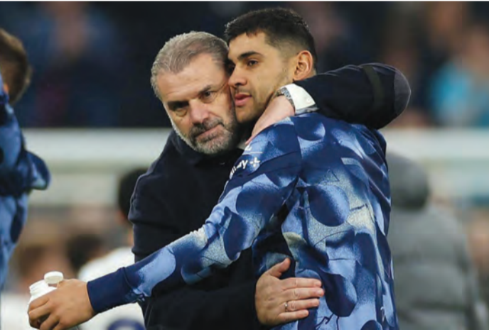
Tottenham Hotspur's Head Coach Ange Postecoglou Cristian Romero (R) (file photo)

Ahead of Sunday's visit of Liverpool, Postecoglou found an ally yesterday in opposite number Arne Slot, who said he was a big fan of the Spurs manager's style.