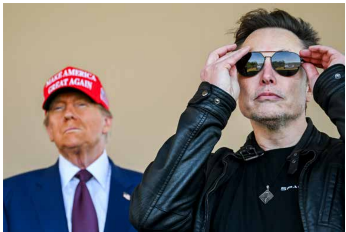
US President-elect Donald Trump and Elon Musk watch the launch of a test flight of SpaceX Starship rocket (file photo)

But dozens of debt hawks in the Republican ranks -- unhappy about allowing the national debt to rise unchecked for half of Trump's term -- rebelled against their own leadership to sink the