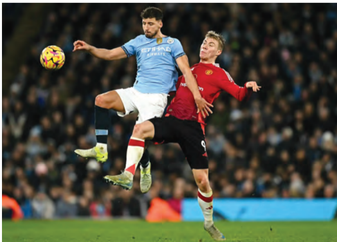
Manchester City's Ruben Dias (L) and Manchester United's Rasmus Hojlund fight for the ball (file photo)

"After 75 minutes against United he felt something," he