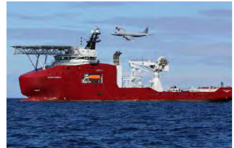
A ship of US company Ocean Infinity is seen during a previous search

Malaysia agrees to resume search for missing MH370 plane.