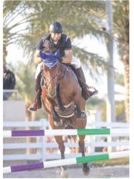
A contestant in action during the round

The fourth competition featured 105cm/115cm hurdles, while the fifth included 115cm/125cm hurdles.