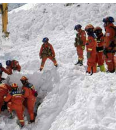
Rescue workers during an avalanche in Nyingchi, southwest