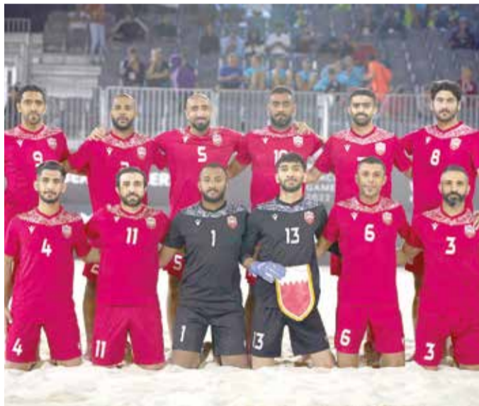
Bahrain's beach soccer team in their previous tournament (file photo)

● Bahrainis set to play Afghanistan, Saudi Arabia and hosts Thailand in preliminary stage