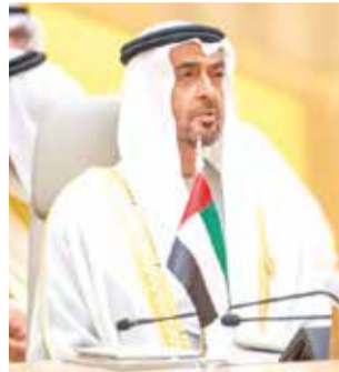
UAE President Sheikh Mohammed bin Zayed al-Nahyan