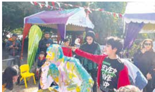
In pictures, the Farmer's market

The market, he said, stands out, thanks to the brilliant organisation and diversity of products.