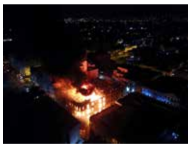
Smoke and flames rise from a building during the 'Take over Lima' march to demonstrate against Peru's President Dina Boluarte