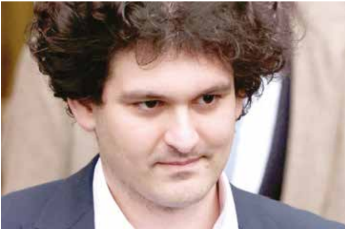
Former FTX Chief Executive Sam Bankman-Fried, who faces fraud charges over the collapse of the bankrupt cryptocurrency exchange, leaves following a hearing at Manhattan federal court in New York City, U.S.

The Department of Justice revealed the seizure of Robinhood shares earlier this month, but it provided a more complete list of seized assets Friday, including cash held at various banks and assets deposited at crypto