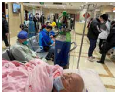
A patient lies on a bed at the emergency department of a hospital