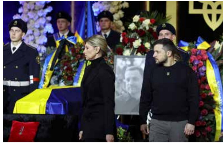
Ukraine's President Volodymyr Zelenskyy and first lady Olena Zelenska attend a memorial ceremony

A tearful Ukrainian President Volodymyr Zelenskyy attended a memorial service yesterday to commemorate seven senior Interior Ministry officials killed in a helicopter crash this week, a fresh blow to a nation already grieving its many war dead.