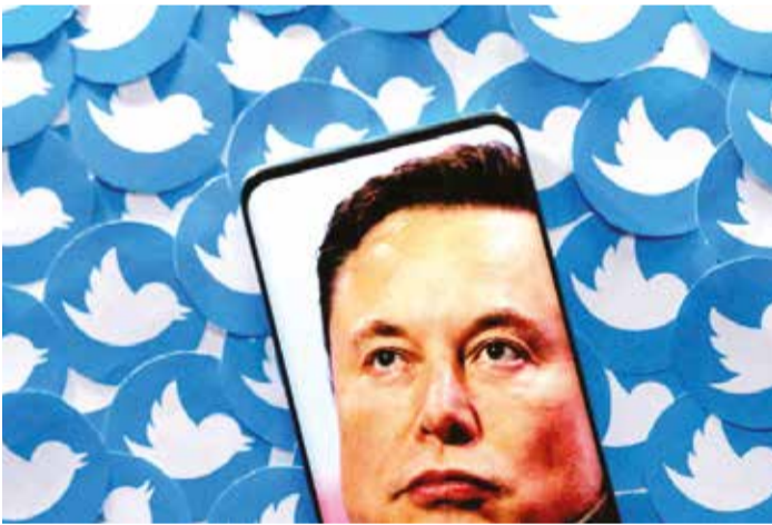
An image of Elon Musk is seen on a smartphone placed on printed Twitter logos

are about 2300 active, working employees at Twitter," billionaire Musk tweeted in a response to a tweet quoting CNBC.