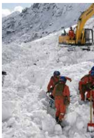
Rescuers search for survivors following an avalanche in China's Tibet Autonomous Region

Tons of snow and ice collapsed onto the mouth of the