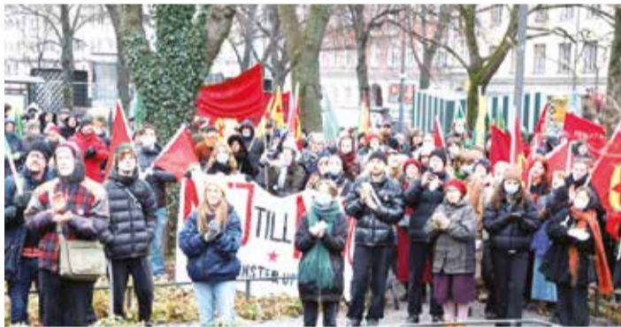
A demonstration against Turkish President Recep Tayyip Erdogan and Sweden's NATO bid, arranged by the Kurdish Democratic Society Center at Norra Bantorget in Stockholm, Sweden

In the permit he obtained from police, it says his protest