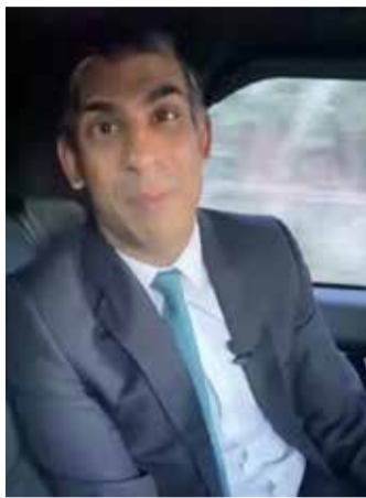
British Prime Minister Rishi Sunak appears to not be wearing his seat belt in this screen grab taken from a social media video

It is the second penalty Sunak has received from police