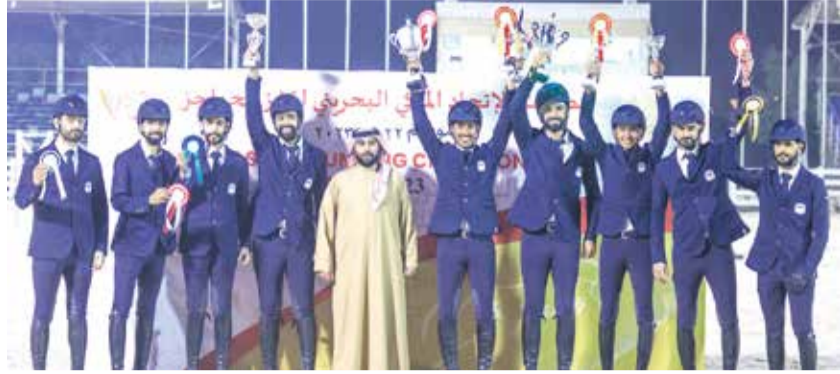
Winners from the round with their trophies