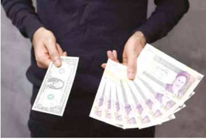
A currency dealer poses for a photo with a U.S. one dollar bill and the amount being given when converting it into Iranian rials in an exchange shop in Tehran, Iran

The EU is discussing a fourth round of sanctions against Iran and diplomatic sources have said members of the Revolutionary Guards will be added to the bloc's sanctions list next week. But some EU member states want to go further and classify the Guards as a whole as a terrorist organisation.