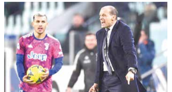
Juventus' coach Massimiliano Allegri reacts next to Leandro Paredes (L)