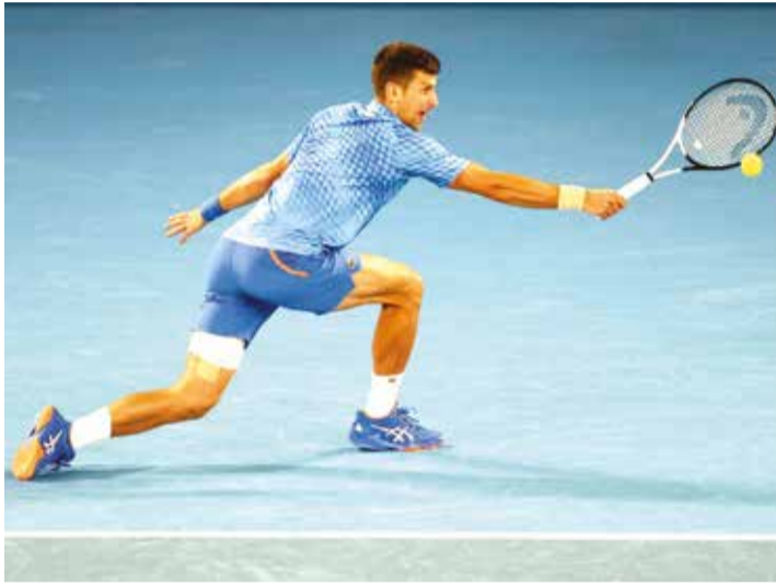
Novak Djokovic in action during his third round match against Grigor Dimitrov

"It was an incredible battle, three sets over three hours. Let's rest up and prepare for the next