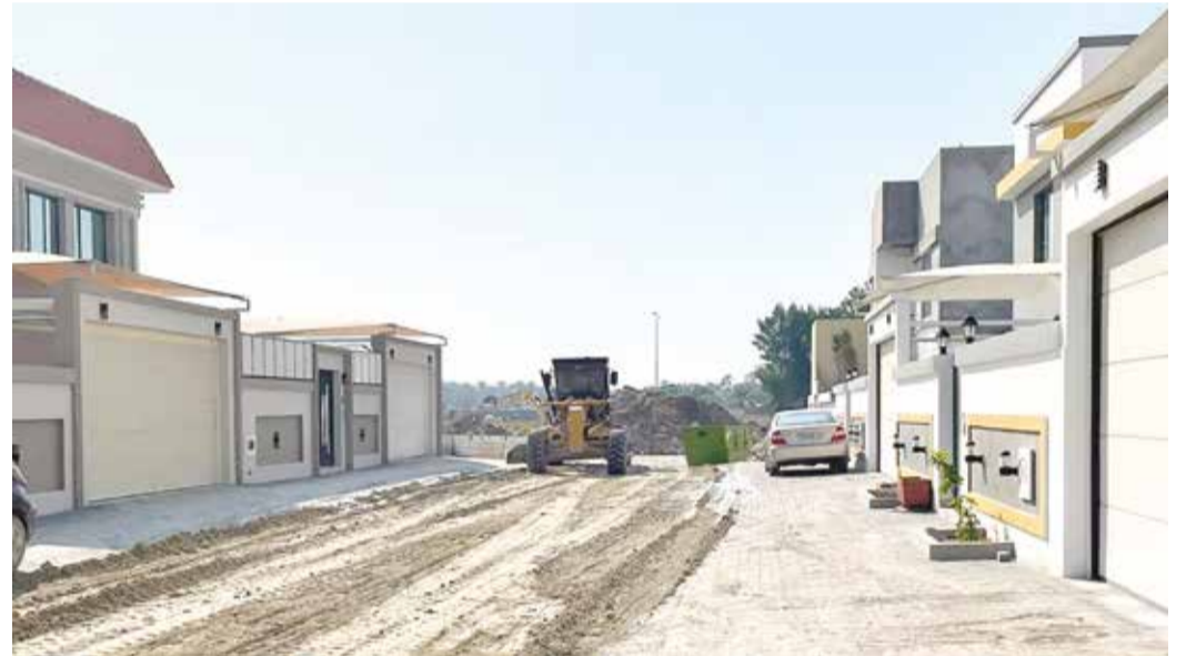
The Ministry of Works yesterday announced that it is currently carrying out levelling works of roads in Block 1038 in the Sadad area. The road, ministry said, will be paved with asphalt after the construction of the sewage network, which is in the final design stage. Implementation is approved according to the priority determined by the project's technical readiness, the region's rate of reconstruction, and the availability of financial funds.