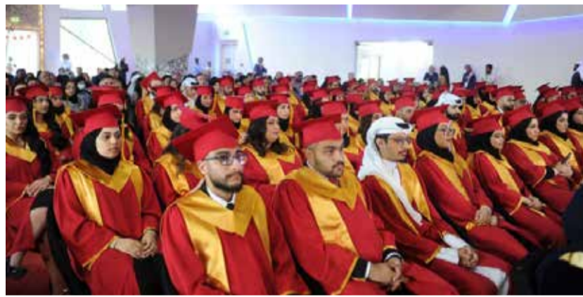
Bahrain Polytechnic held a graduation ceremony at the college's academic campus for its eighth batch of students for the academic year 2021-2022. Minister of Municipalities Affairs and Agriculture, Wael bin Nasser Al Mubarak, Board of Trustees Chairman of Bahrain Polytechnic congratulated the graduates and their parents, wishing them continuous success.

Panadol was widely sold and went out of stock for a few days last week, but most pharmacies brought more inventory to meet the demand.