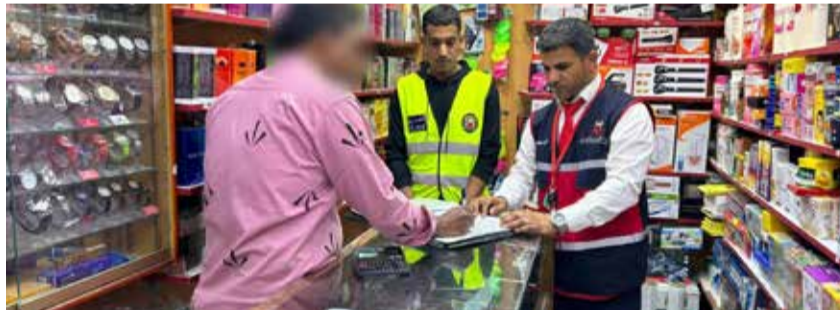
The Labour Market Regulatory Authority (LMRA) yesterday took legal action against several for violating labour and residency laws in the kingdom. The action followed a joint inspection campaign with the Nationality, Passports and Residence Affairs and the Capital Governorate Police Directorate. LMRA stressed its commitment to continuing intensive inspection plans, in cooperation with the relevant government entities. LMRA also renewed its call to report violations through www.lmra.bh or by calling the authority on 17506055.