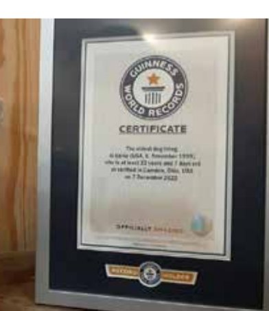
Guinness world certificate

09. right in and sat on the seat, as if he knew where we were going. It was meant to be".