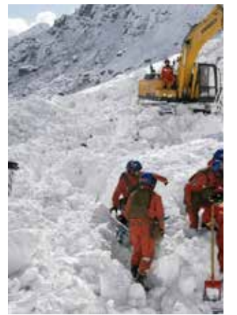
Rescuers search for survivors following China's Tibet Autonomous Region

Tons of snow and ice collapsed onto the mouth of the tunnel on Tuesday evening trapping drivers in their ve-