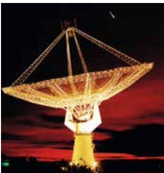
The Giant Metrewave Radio Telescope in Pune, India