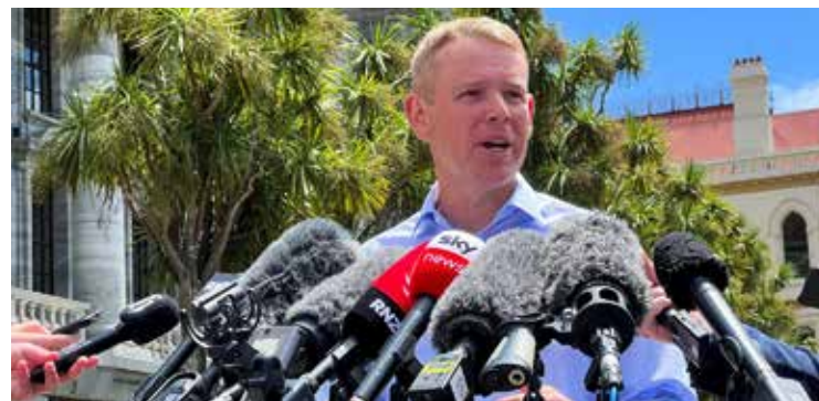
Chris Hipkins speaks to members of the media, after being confirmed as the only nomination to replace Jacinda Ardern as leader of the Labour Party