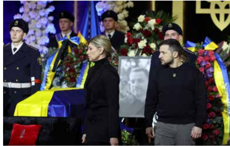
Ukraine's President Volodymyr Zelenskyy and first lady Olena Zelenska attend a memorial ceremony

The helicopter went down just days after at least 45 people were killed in a Russian missile attack that partially levelled a block of flats in the southeastern city of