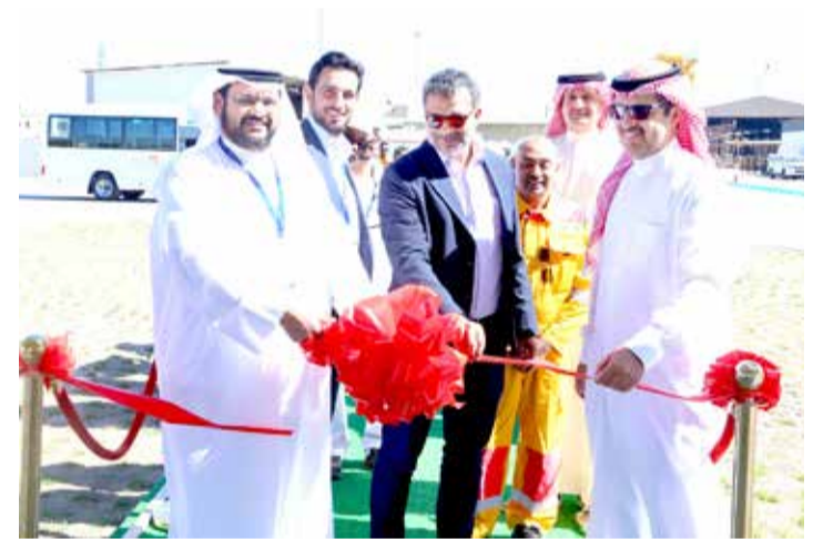
Officials during inauguration