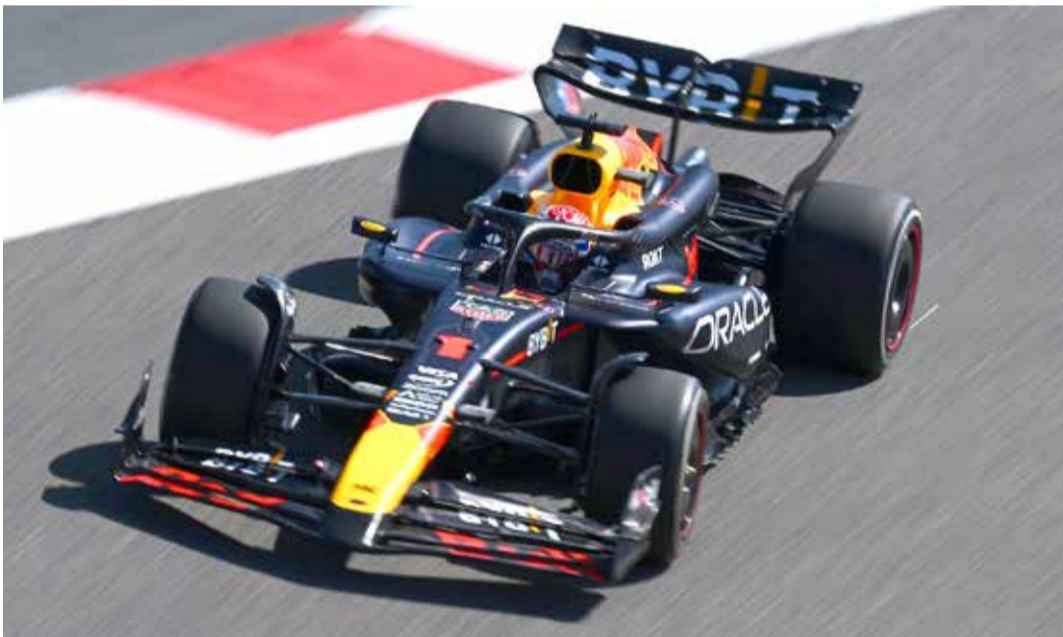
Max Verstappen on track in his Red Bull RB20

Tickets to pre-season testing offer an incredible opportunity