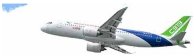
China's Comac C919 airplane flies past during the Singapore Airshow

and implementing them by providing a healthy and positive working environment for all employees. Through providing rest points for workers, ASRY aims to preserve the employees' safety and ward of any risks related to heat stress, especially during the summer.