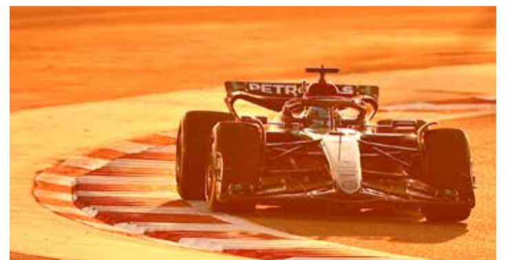
The Mercedes of George Russell testing as the sun comes down on the afternoon session at BIC