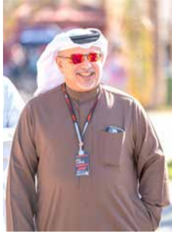
HRH the Crown Prince and Prime Minister

HRH the Crown Prince and Prime Minister affirmed the Kingdom's unwavering commitment to enhancing its competitiveness in global sports through elaborate planning, relentless efforts, and strong leadership to achieve the visions and aspirations of His Majesty King