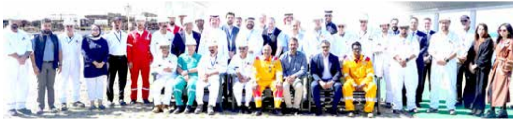
Officials and employees pose for a photo