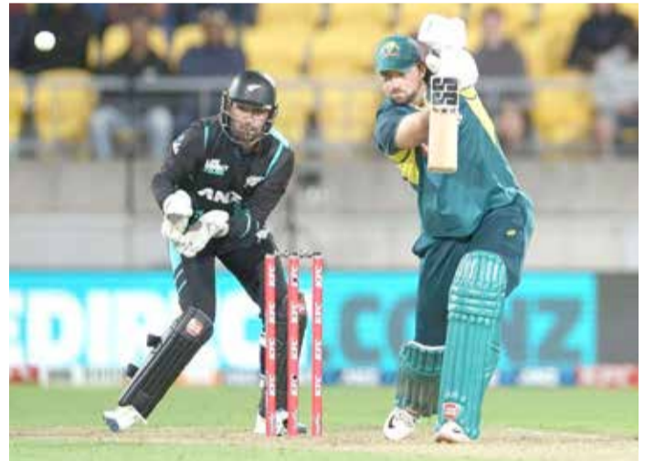
Australia's Tim David plays a shot

Head went for 24, caught by Tim Southee off the bowling of Adam Milne.