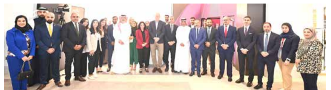
Beyon and Batelco CEO, management and team members at Batelco Marassi Shop

Batelco unveils first fully-fledged Digital Experience Shop at Marassi Galleria