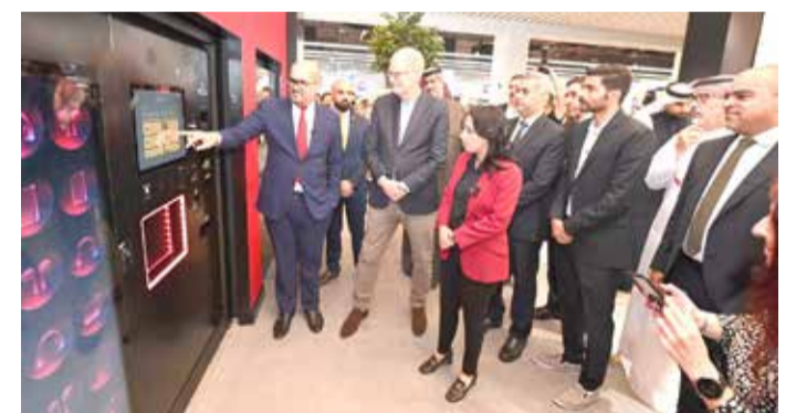
Digital Vending Machine

Another unique aspect of the shop is the product display zone, where customers can compare up to 3 devices side-by-side and explore their specifications, assisting shoppers to make better buying decisions.