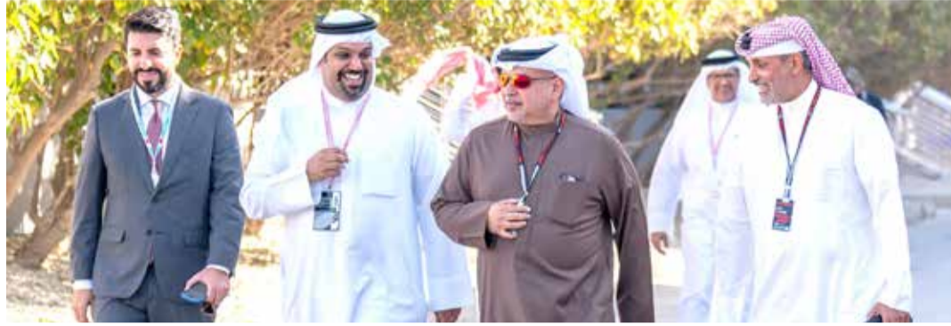
HRH the Crown Prince and Prime Minister is accompanied on his visit by Finance and National Economy Minister Shaikh Salman bin Khalifa Al Khalifa and BIC Chief Executive Shaikh Salman bin Isa Al Khalifa