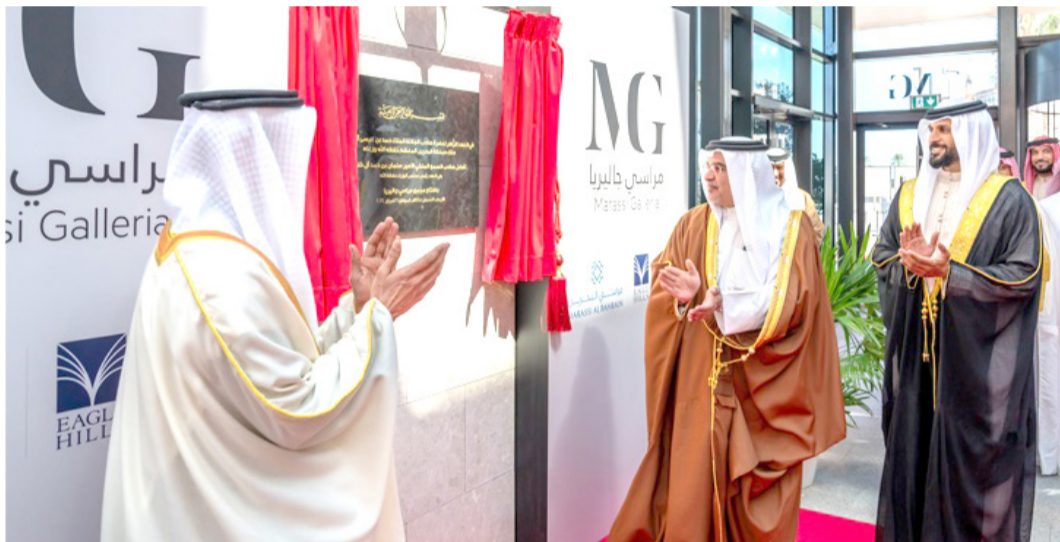
HRH the Crown Prince and Prime Minister opens the Marassi Galleria

HRH the Crown Prince and Prime Minister highlighted the