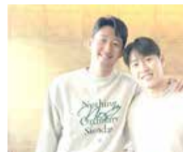
South Korea's Son Heung-min (left) with teammate Lee Kang-in