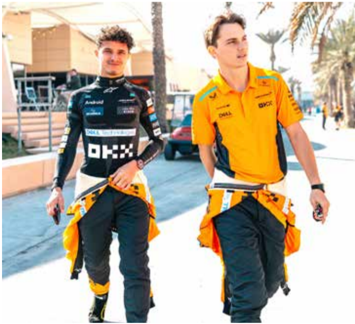
McLaren drivers Lando Norris and Oscar Piastri get ready to test yesterday morning

to witness F1 cars in action at a low price. Free entry to the tests is also available to all fans who had purchased their F1 Gulf Air Bahrain Grand Prix 2024 tickets before 1 February.