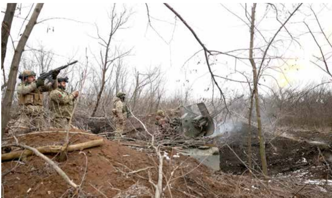
Ukrainian anti-aircraft gunners of the 93rd Separate Mechanized Brigade Kholodny Yar fire at Russian UAVs from their positions in the direction of Bakhmut in the Donetsk region.

It only included the names of soldiers publicly identified in open-source data - mainly obituaries - and warned the real toll