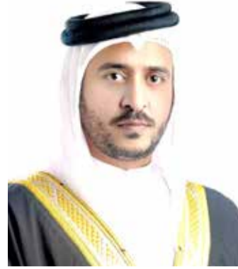
HH Shaikh Khalid bin Hamad Al Khalifa rain Sports Day 2024, which starts on Thursday in Bahrain Bay.

HH Shaikh Khalid extended thanks and gratitude to HM the King for his interest in the sports sector, and to His Royal Highness Prince Salman bin Hamad Al Khalifa, the Crown Prince and Prime Minister, for allocating a half working day for sporting activities on Bah-