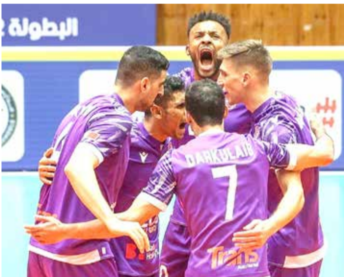
Dar Kulaib players celebrate after scoring a point against

Bahrain's Dar Kulaib claimed their second straight win yesterday in the 42nd Arab Clubs Volleyball Championship, currently being held in Amman.