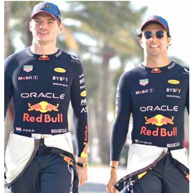
Red Bull drivers Max Verstappen and Sergio Perez in the BIC Paddock yesterday

Charles Leclerc, who was second-fastest in the morning, came seventh on the combined timesheet 1.903s behind Verstappen's best, while Fernando Alonso was eighth-quickest for