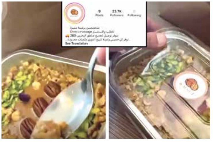
The Instagram page, which has garnered support from thousands of social media

it was his idea to send the dish to the influencer for a review while the former was on a visit to the Kingdom.