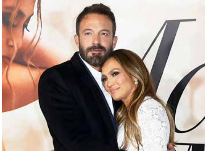
Ben Affleck and Jennifer Lopez

According to People, Lopez wore a white Ralph Lauren gown with a long, flowing train and veil at Saturday's ceremony, with Affleck in a tuxedo with a