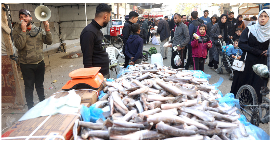
was out and about in Gaza City, Men sell frozen fish at a street market in Al-Daraj neighbourhood in Gaza City, on January 21, 2025, on the third day of a declaring that Gazans were "liv- ceasefire deal in the war between Israel and Hamas in the Palestinian territory.