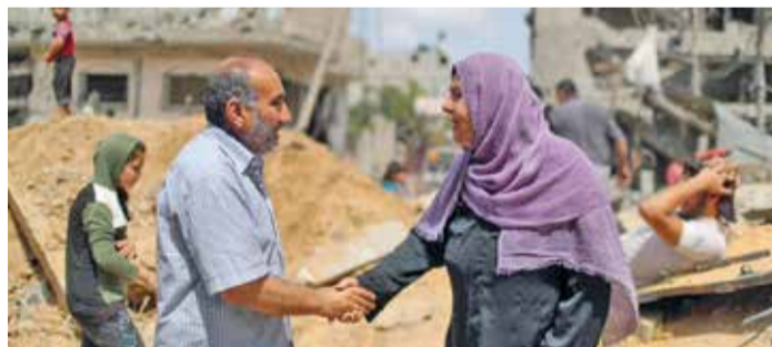
Palestinians shake hands after returning to their destroyed houses following Israel-Hamas truce, in Beit Hanoun in the northern Gaza Strip

proximately 800,000 people in Gaza do not have regular access to clean piped water, as nearly 50% of the water networks are out of service following the recent raids.