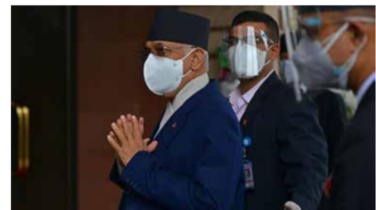
Nepal's Prime Minister KP Sharma Oli gestures upon his arrival at the parliament