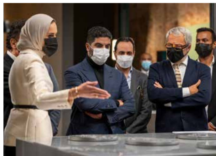
Officials at the event

SAUDI CULTURE MINISTER HH PRINCE BADR BIN FARHAN AL-SAUD