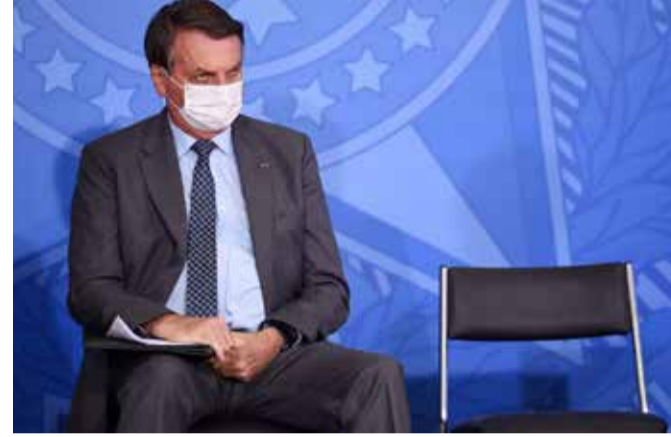
Brazilian President Jair Bolsonaro attends an event at Planalto Palace in Brasilia | Brasilia

Brazilian President Jair Bolsonaro never wanted to buy COVID-19 vaccines and originally bet on herd immunity beating the coronavirus, the senator leading the upper house's inquiry into the government's handling of the crisis said on Friday.