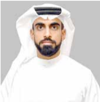
H.E. Shaikh Khalid bin Rashid Al Khalifa

During Eid Al Adha alone, 29 individuals across 33 cases received support totaling