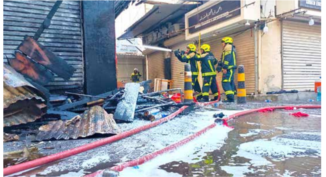
Scene at the Old Manama Souq fire

Present at the meeting were members of the Manama Souq