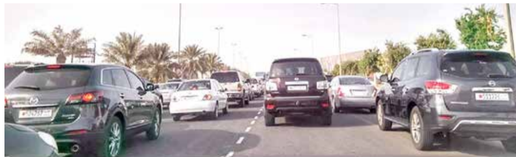
Shaikh Isa bin Salman Street near the Umm Al Hassam Tunnel yesterday experienced significant traffic congestion towards King Fahd Bridge due to a truck fire. Fortunately, no casualties were reported. Authorities managed to implement necessary measures to facilitate traffic flow in the affected area.