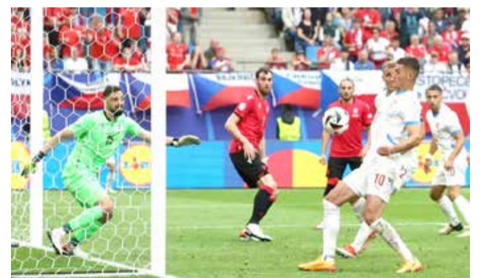
Czech Republic forward Patrik Schick (R) shoots to score