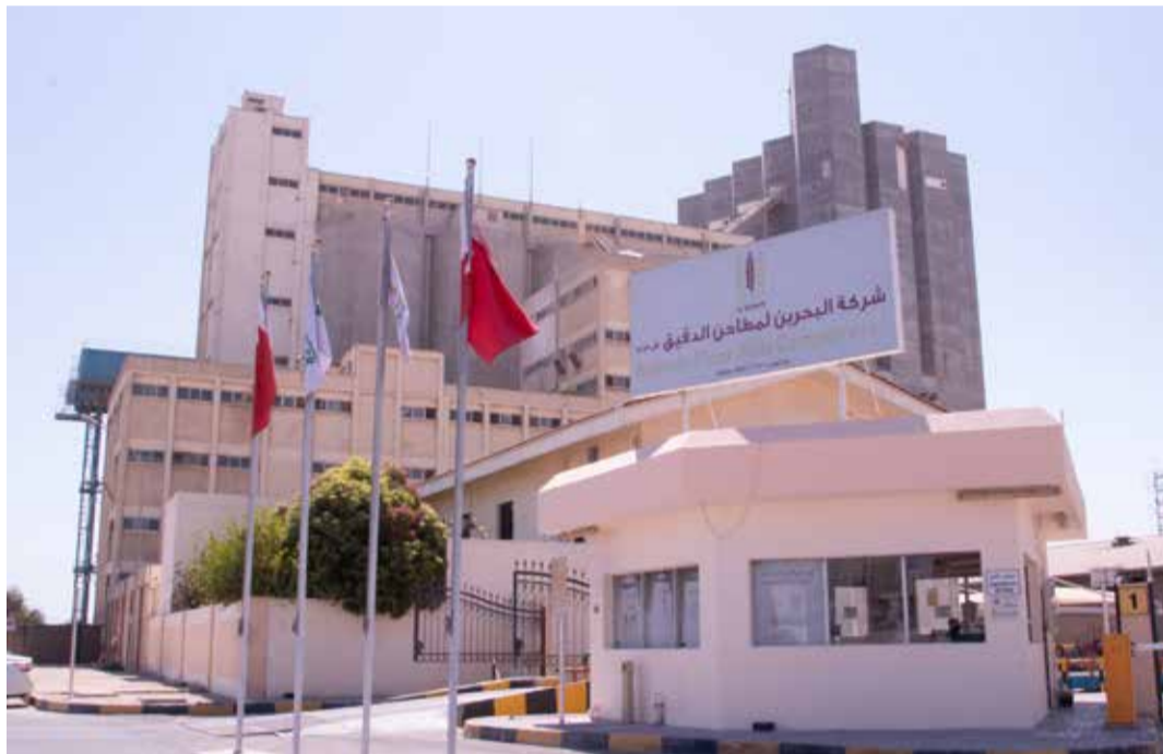
Bahrain Flour Mills Company (BFMC)

Mr. Al Saie highlighted that there has been no price increase for subsidized controlled markets, which include traditional bakeries and food outlets. The recent price adjustment only