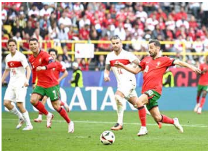
Portugal's midfielder #10 Bernardo Silva runs with the ball

Cristiano Ronaldo will have at least two more tries to become the oldest goalscorer at a European Championship as Martinez said on Friday that the 39-year-old is in the right shape to play every four days.