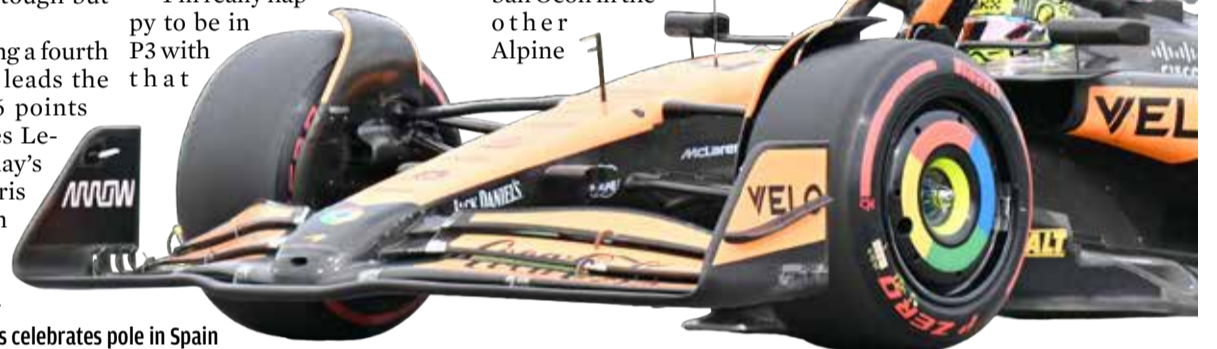
McLaren's Lando Norris celebrates pole in Spain

The action on track though was anything but cool, as drivers scrambled to eke out every last ounce of performance for a Grand Prix won from pole in 24 of 33 races run at the circuit.