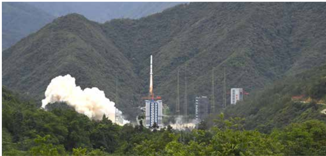
A Long March 2-C rocket carrying a satellite jointly developed by China and France dubbed the Space Variable Objects Monitor (SVOM), lifts off from a space base in Xichang, in China's southwestern Sichuan province

The extremely bright cosmic beams can give off a blast of energy equivalent to more than a