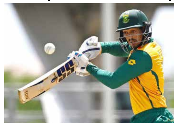
Quinton de Kock in action

Fine bowling and fielding then reduced England to 61-4 before a stand of 78 between Harry Brook (53) and Liam Livingstone (33) took the title-holders close.