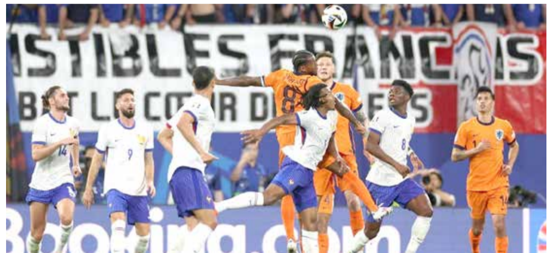
Netherlands' midfielder #08 Georginio Wijnaldum (C) and France's defender #05 Jules Kounde (3rd R) jump for the ball

Kylian Mbappe sits on the pitch with a protective mask during warm up