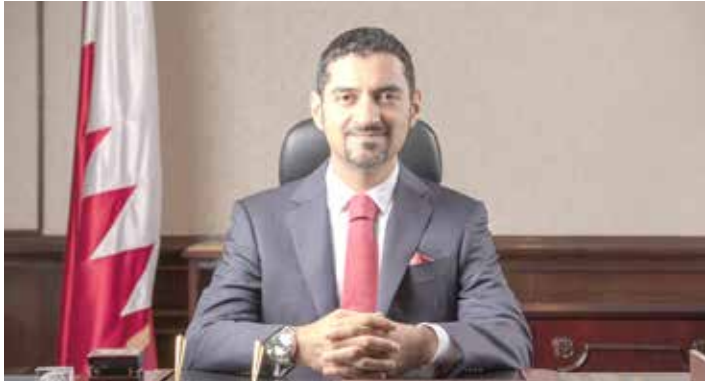
Wael bin Nasser Al Mubarak

The most prominent areas covered by these recommendations include urban plan-