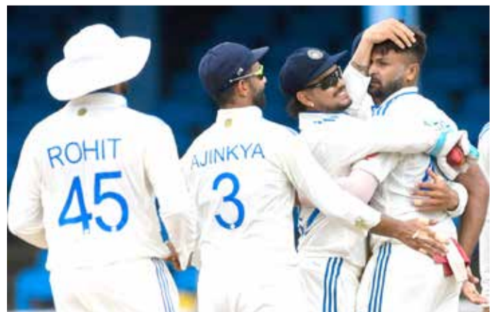
Ishan Kishan (2R) hugs Mukesh Kumar (R) of India after taking a catch

But then left-handed McKenzie wafted at a wide delivery