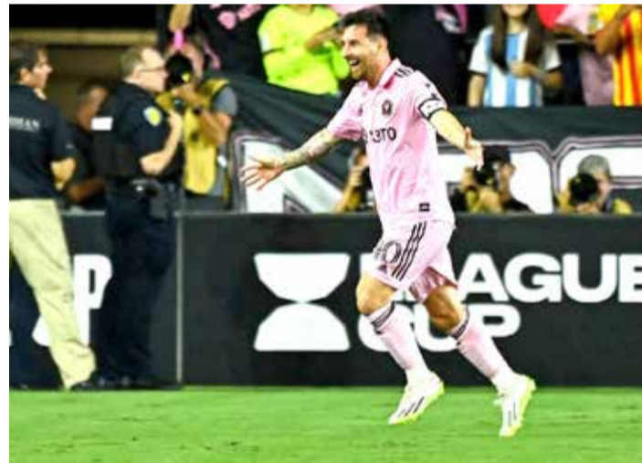
Inter Miami's Argentine forward Lionel Messi celebrates after scoring a goal