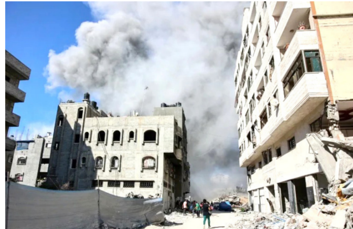
Palestinians in Gaza City watch as smoke rises from a building hit by a strike after an Israeli army warning for its occupants to evacuate

US Secretary of State Antony Blinken on Wednesday ended his latest tour of the Middle East, aimed at finalising a ceasefire, without a breakthrough.