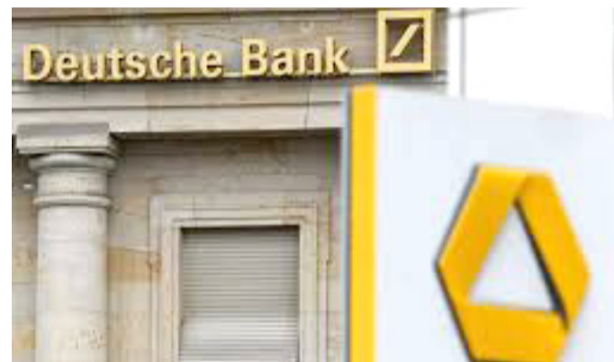
A bird flies close to the Deutsche Bank building with the bank's logo behind the Commerzbank logo in Frankfurt

Among the plaintiffs who agreed to settle was the largest single individual who represented "around one-third of all