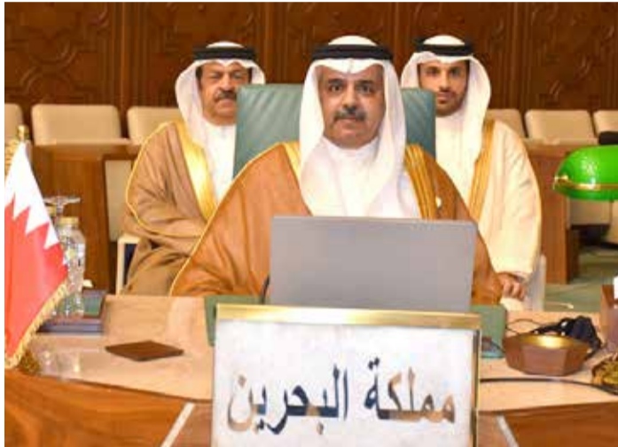
Major General Dr Shaikh Hamad bin Mohammed Al Khalifa presides over the Arab ministerial meeting

Dr Shaikh Hamad greeted the participants and noted Bahrain's efforts to strengthen Arab collaboration in disaster risk reduction.