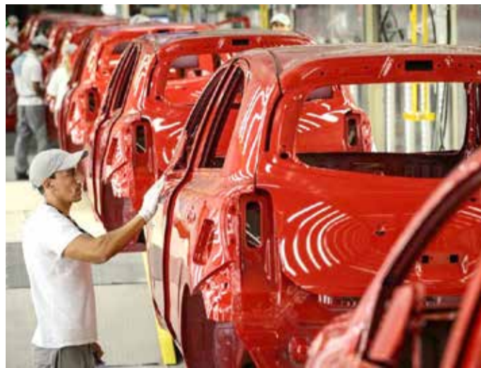
Workers check painted Nissan cars in the assembly line

Developed in partnership with Radi-Cool, a specialist in radiative cooling products, Nissan's new paint features advanced metamaterials—engineered to reflect sunlight and dissipate heat. These materials help reduce exterior surface temperatures by up to 12 degrees Celsius and interior temperatures by up to 5 degrees Celsius compared to traditional automotive paints.