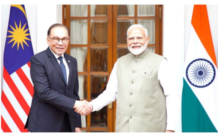
Indian Prime Minister Narendra Modi with Malaysia PM Anwar Ibrahim

The interior ministry said in a statement that Hasina's passport and those belonging to former government ministers and ex-lawmakers no longer in their posts "have to be revoked".