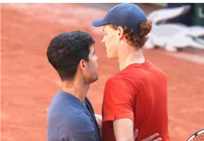
Spain's Carlos Alcaraz (L) cheers Italy's Jannik Sinner after a match (file photo)

The draw raises the prospect of a possible semi-final clash between Sinner and Alcaraz who in 2022 produced an epic five