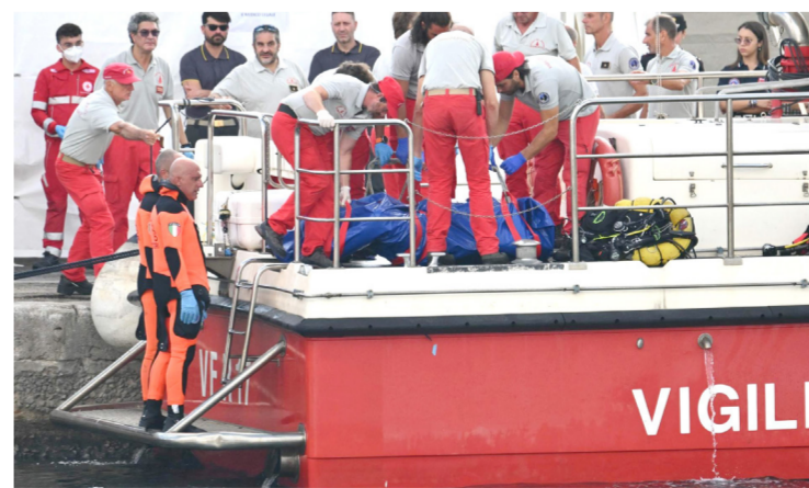
Rescuers carry a body after divers return in Porticello harbor near Palermo

On Wednesday they pulled up four bodies from the wreck of the