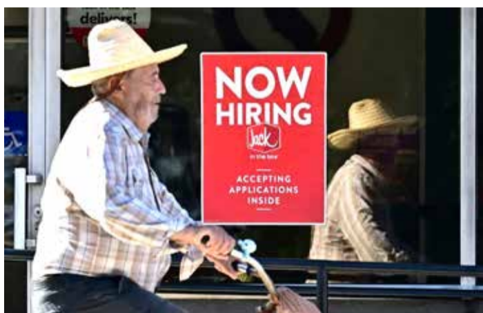
A cyclist rides past a "Now Hiring" sign posted on a business storefront in San Gabriel, California

In Europe, Paris finished flat while London and Frankfurt were in the green but not as strong as earlier in the day when key surveys showed business ac-