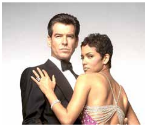
Pierce Brosnan and Halle Berry (file photo)

Halle Berry has credited Pierce Brosnan for "restoring her faith in men". The 58-year-old actress worked with the 71-year-old movie star in 2002 'James Bond' classic 'Die Another Day', and 22 years later she has recalled him being a total "gentleman". She told Wired: "He will always be my Bond, always. I'm a Pierce Brosnan fan. "He restored my faith in men on that movie. There couldn't be a human who is more of a gentleman than Pierce Brosnan." She feels "honoured" to have landed a role as Bond Girl and NSA agent Jinx, allowing her to be part of a piece of "cinematic history". She added: "Bond wasn't on my wish list, no, not to be in one, but I loved the movies, always. "Having been in one, I feel like I'm a