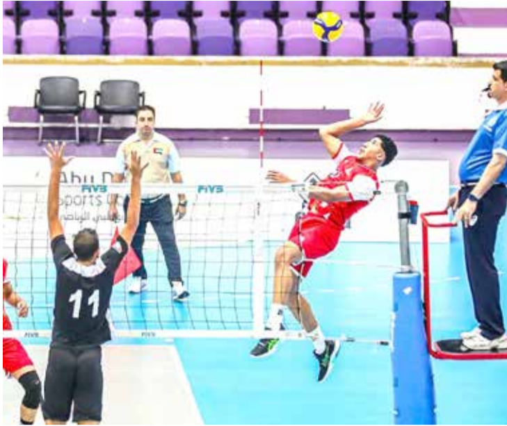
Action from the match