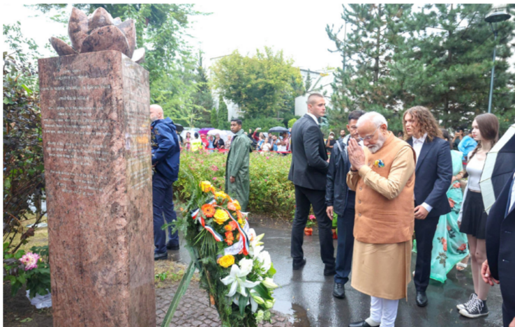
Indian Prime Minister Narendra Modi (front C) pays his respects at the Jam Saheb of Nawanganar Memorial at the Good Maharaja Square

Modi is expected to use his landmark visit, the first from a premier of India to Kyiv, to campaign for a "peaceful" solution to the grinding conflict that started with Russia's attack on Ukraine.