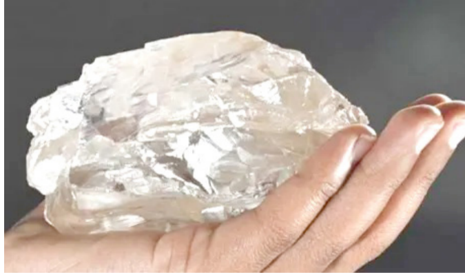
A view of the diamond