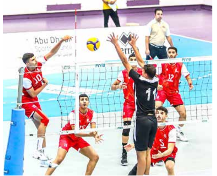
Action from the match

The team's strong performance has captured the attention of fans and competitors alike, as they prepare to continue their journey towards the championship title.