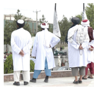
Taliban members of the Ministry for the Propagation of Virtue and the Prevention of Vice keep watch during a demonstration