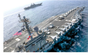
USS Abraham Lincoln