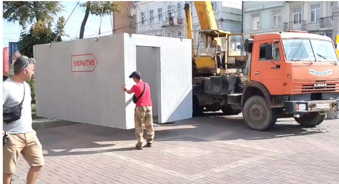
Municipal workers instal concrete shelters in Kursk

There were no previous reports of the attempted strike on the facility in Russian media. Kursk region Governor Alexei Smirnov told Putin the facility was working as usual.