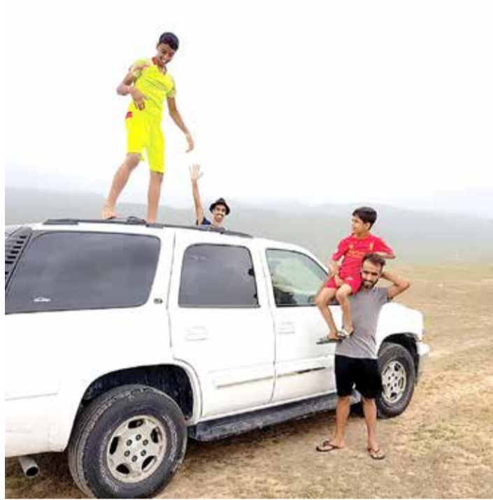
Photos of the Bahraini travelers' adventures across continents, shared on their social media accounts