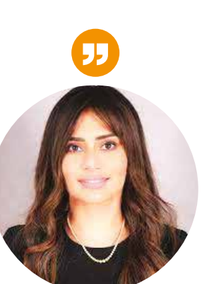
The authority will intensify campaigns across the Kingdom spanning worksites and worker gathering points to ensure that the labour rules are not flouted by anyone