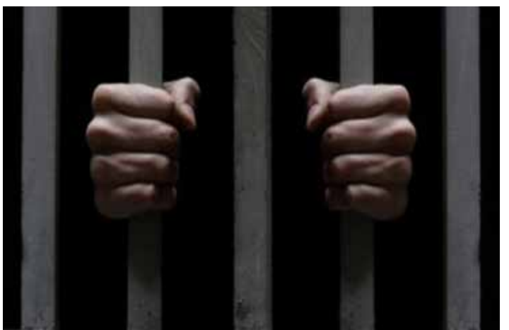
Image used for illustrative purposes only that the inmates' role in the es- searched where a Kalashnikov ascape plan would be to cause riots and vandalism.

plan by communicating with the inmates and providing the means of transportation to according to the plan. smuggle them, as well as the