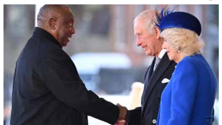
Horse Guards Parade in central The two-day state visit is the first since Charles became king

inspected the guard of honour of anti-apartheid icon Nelson and a threat of impeachment at Mandela, however, the visit also home.