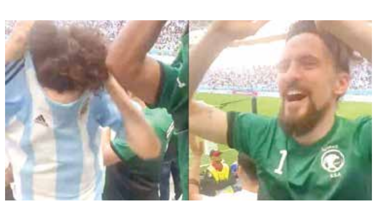
Left, an Argentine fan removes his jersey, right, he celebrates wearing a Saudi jersey

end the match with a loss, a video of a fan exchanging video of an Argentine his Argentine jersey with A fan from the World Cup a Saudi one went viral. The latter part of the video shows celebration by Saudis in the