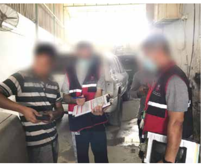
A file picture shows LMRA officials carrying out an inspection.

ity will intensify campaigns this specific type of visa appli- expenses. across the Kingdom spanning cants, taking up paid or unpaid