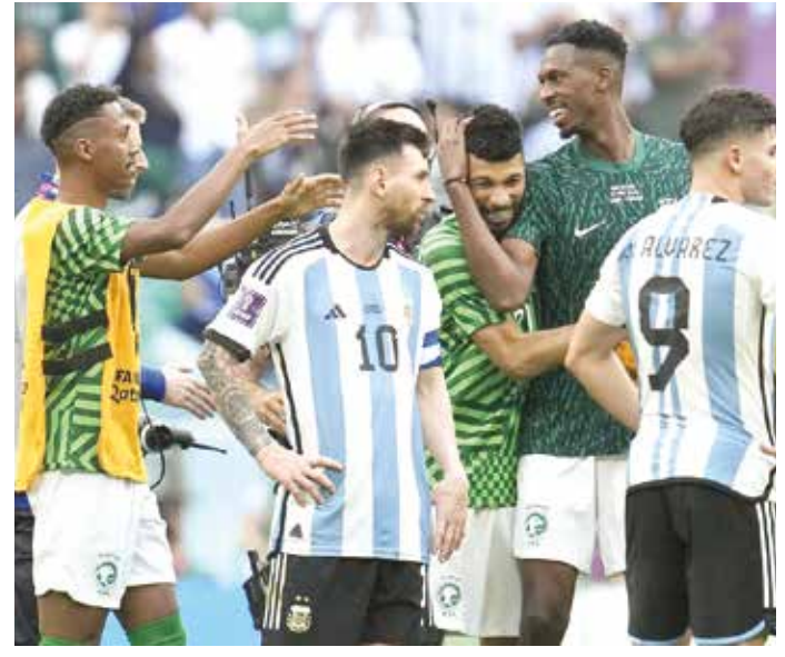
Argentina's Lionel Messi stand beside Saudi Arabia's players after their match