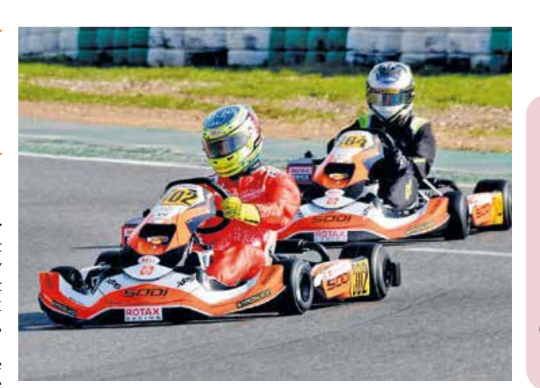
Participants steer their car during practice

Team Bahrain drivers were thus faced with conditions the drivers are not as familiar with but nevertheless, it was a positive day for the team.