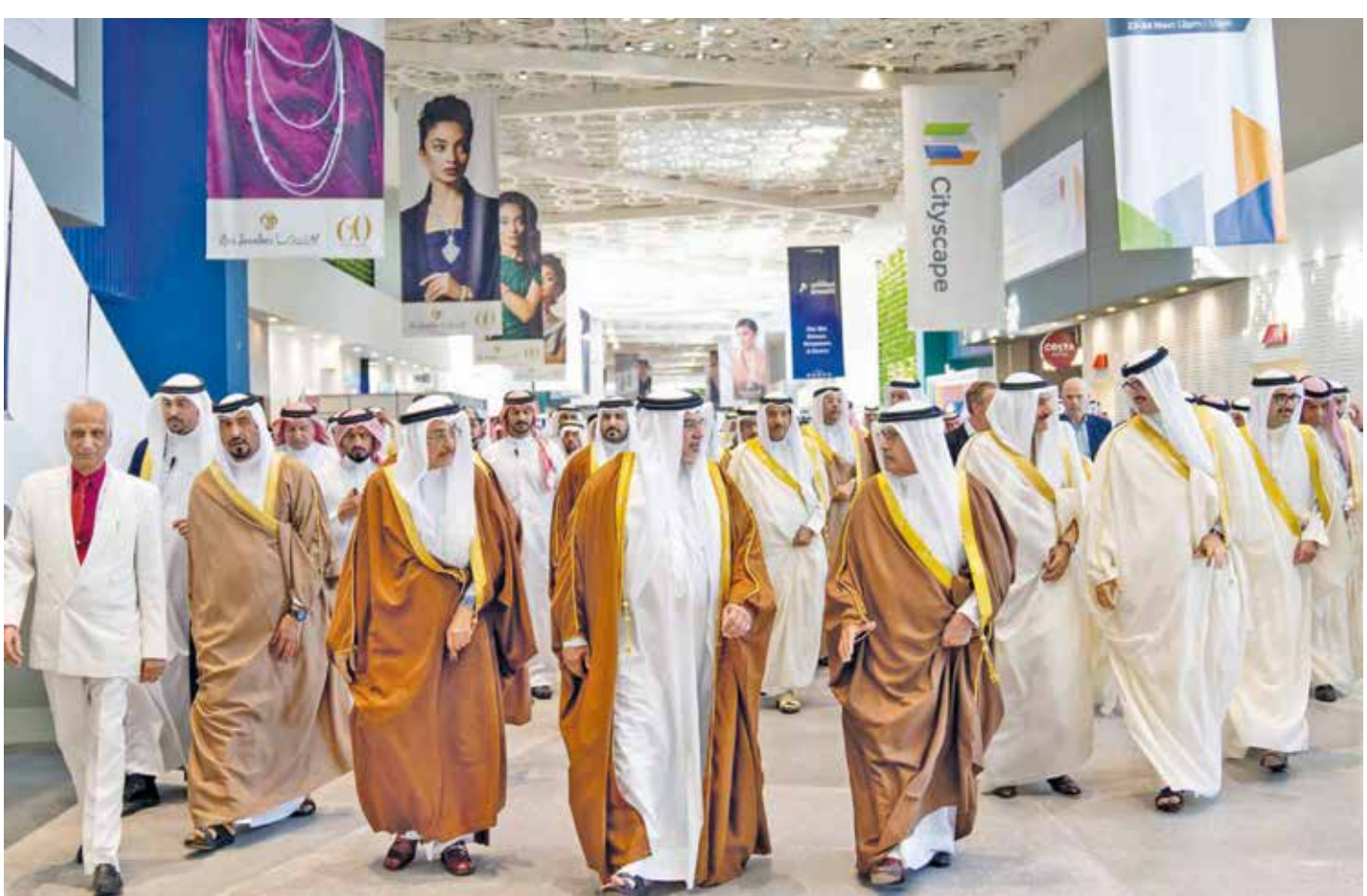
In pictures, HRH CP and PM taking a tour of the expo in Sakhir yesterday

The five-day expo at Exhibicommitment of Bahrain to ad- ad bin Isa Al Khalifa. vancing its comprehensive de-