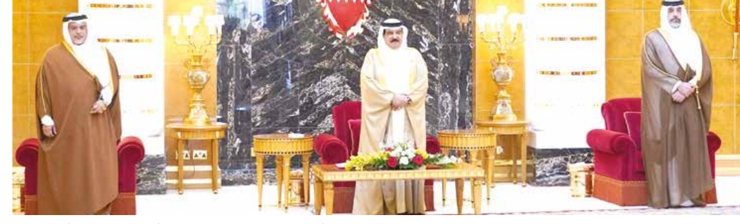
HM the King and HRH Prince Salman at the oath-taking ceremony

HM the King expressed his all areas. appreciation to HRH the Crown