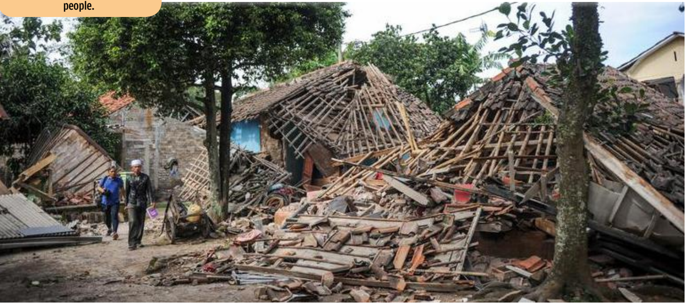
Locals walk past collapsed houses after an earthquake in Cianjur, West Java province, Indonesia

In one area, some victims held cardboard signs asking for food and shelter, with emergency supplies seemingly yet to reach them.