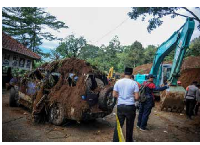
A damaged car is seen on the site of a landslide following earthquake hit in