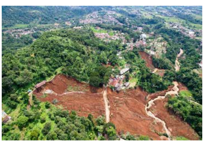
An aerial view of an area affected by landslides following earthquake hit in Cianjur, West Java province, Indonesia

'Even if I try and brush it, it will just stick up but I brush born with uncombable hair it everyday, sometimes I put syndrome, and she has gained a bow in sometimes but she thousands of devoted fans af-doesn't like it and if sometimes ter a series of videos on social a bobble but if she has it up she looks like an onion, so we She explains: 'Arla was born just put a headband on, or let