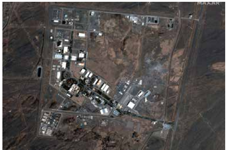
A handout satellite image shows a general view of the Natanz nuclear facility after a fire, in Natanz, Iran July. (file)