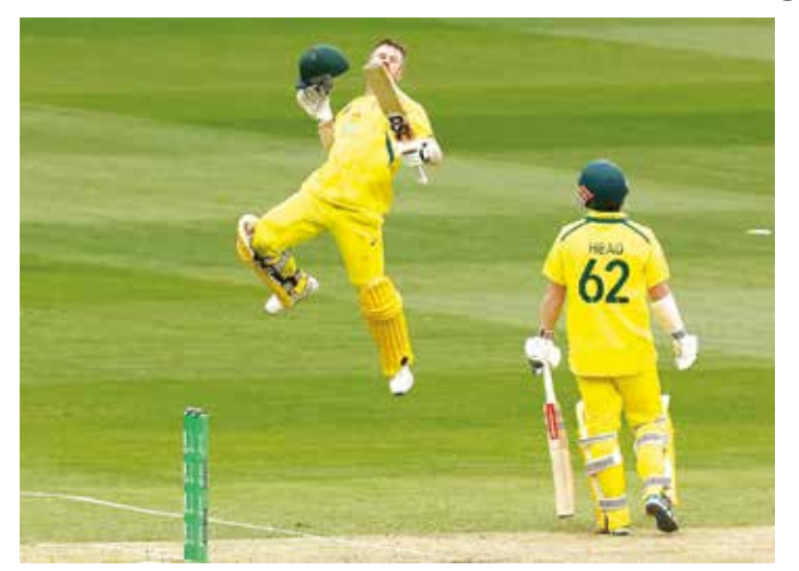
teammate Travis Head (R) looks on

"It's been fantastic, all three required run rate.