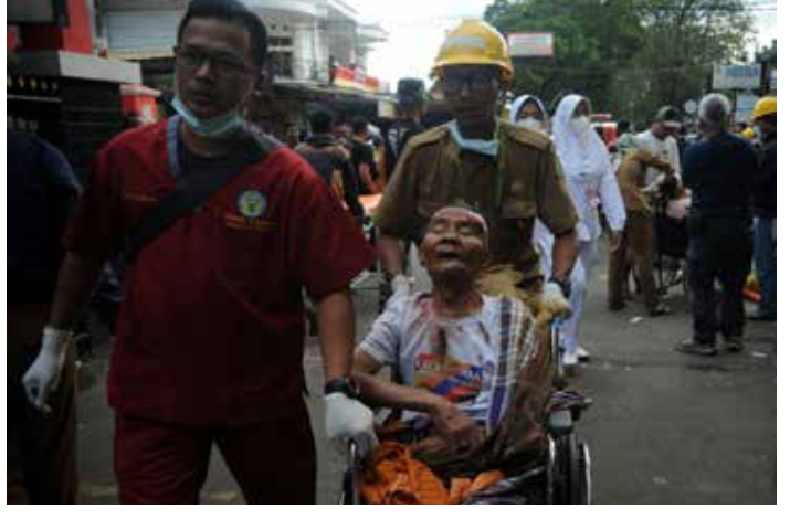
Medical workers treat a victim outside the district hospital after earthquake hit in Cianjur, West Java province, Indonesia