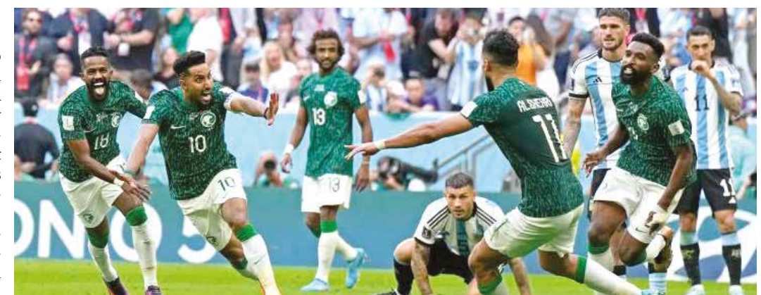
Prime Minister, to celebrate Saudi Arabian players celebrate their win against Argentina

This is in line with the recommendation of His Royal Highness Mohammed bin Salman Al Saud, the Crown Prince and