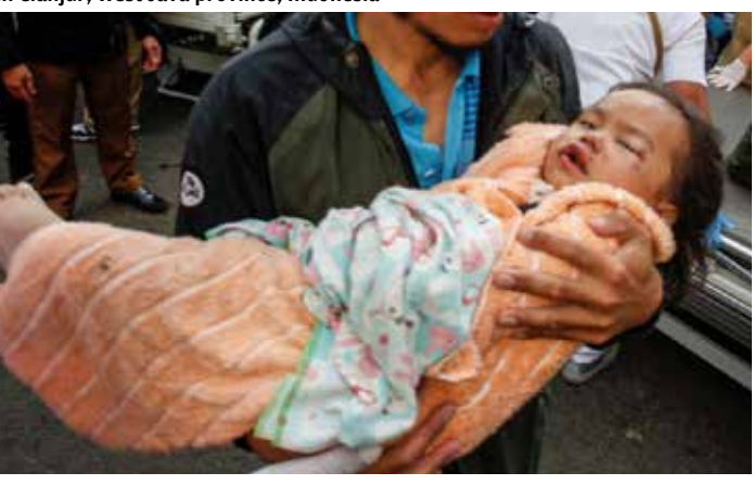
A man carries an injured child to receive treatment at a hospital, after an earthquake hit in Cianjur, West Java province, Indonesia

and burying at least one village Rescue Agency (Basarnas). under a landslide.