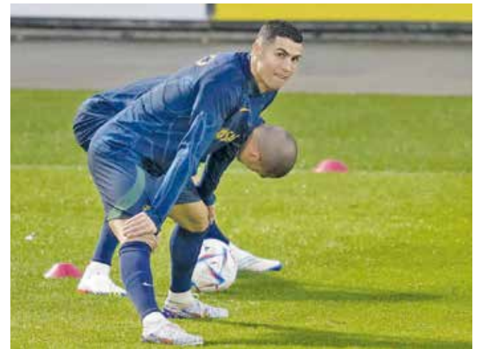
Cristiano Ronaldo stretches with teammate Pepe, in the background, during a Portugal soccer team training session