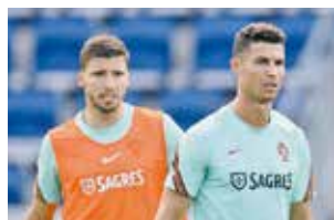
Ruben Dias and Cristiano Ronaldo

him for his immense contribution across two spells at Old Trafford, scoring 145 goals in 346 appearances, and wishes him and his family well for the future." United said in a statement.