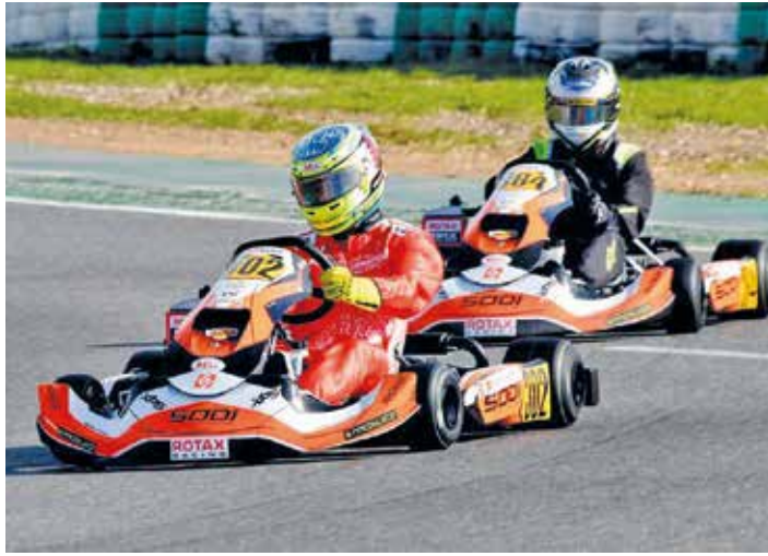
Participants steer their car during practice

The 23rd edition of the Grand Finals, began with a wet track thanks to a fine drizzle that persisted through the night in