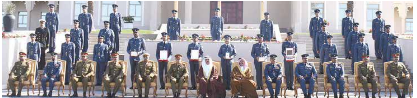
The graduation ceremony in progress