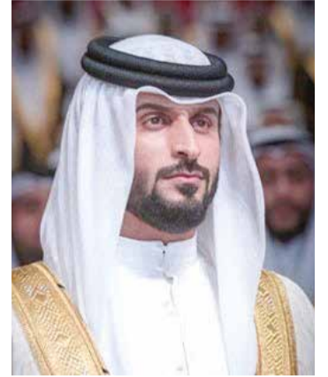
HH Shaikh Nasser