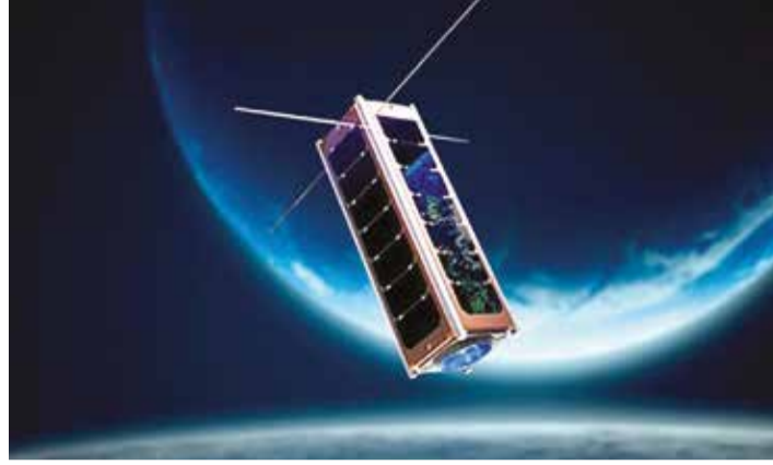
Making Bahrain proud