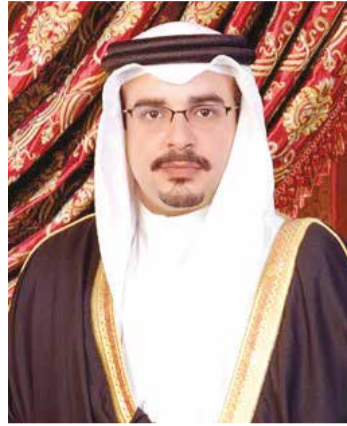
HRH the Crown Prince and Prime Minister