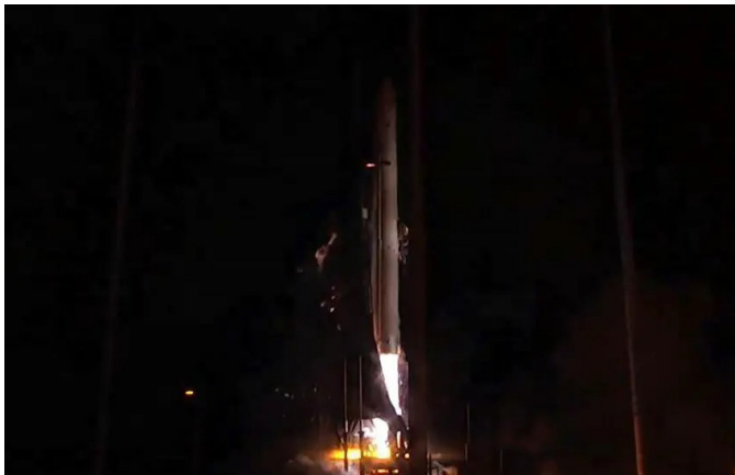
The first 3D printed rocket, Terran 1, taking off from Launch Complex 16 in Cape Canaveral, Florida

The world's first 3D-printed rocket launched successfully yesterday, marking a step forward for the California company behind the innovative spacecraft, though it failed to reach orbit.