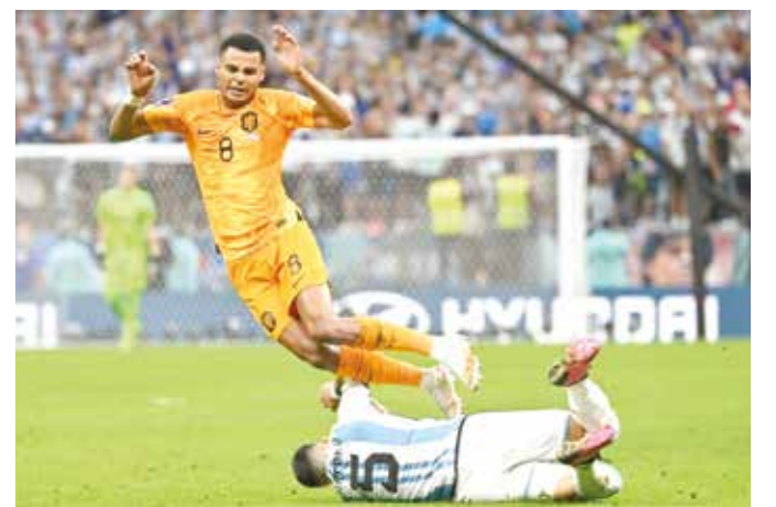
Netherlands' Cody Gakpo and Leandro Paredes fall during a match (file photo)