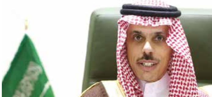
Saudi Arabia's Foreign Minister Prince Faisal bin Farhan Al Saud

Twitter, the Saudi foreign ministry said Saudi minister, Prince Faisal bin Farhan, called Hossein Amir-Abdollahian and "exchanged congratulations on the occasion of the holy month of Ramadan".