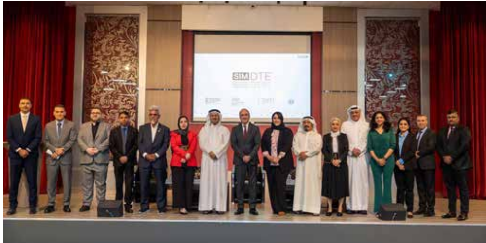
Officials during a photocall and press conference

UTB, in cooperation with FIRST India, said it has signed