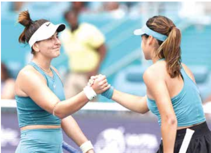
Bianca Andreescu shakes hands at the net after her three set victory against Emma Raducanu

both born near Toronto and both of whom won the US Open as teenagers, battled for 2.5 hours in an entertaining opening to the WTA and ATP combined tournament's main draw.