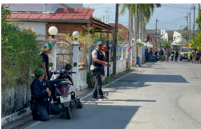
Policemen with guns take positions on a street near the neighborhood of a gunman's house in Phetchaburi province

The shooter started firing in Phetchaburi, about 100 kilo-