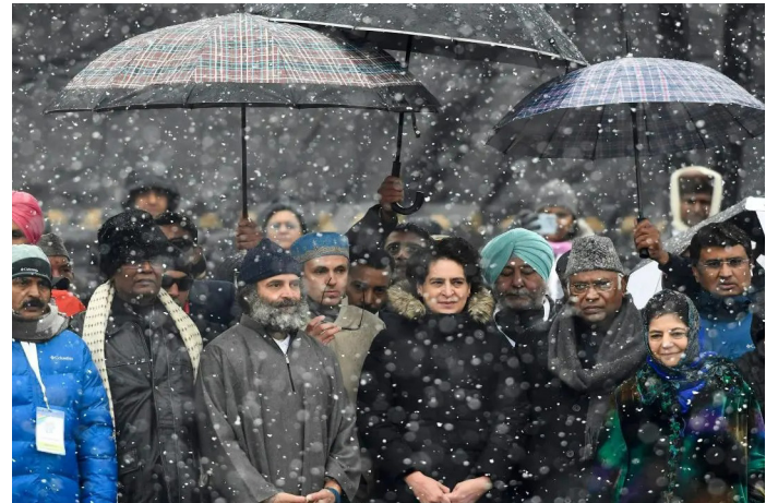
Rahul Gandhi, his sister Priyanka Gandhi Vadra and other Congress leaders stand during a public meeting amid heavy snowfall in Srinagar (file photo)

Gandhi is the son, grandson and great-grandson of a dynasty