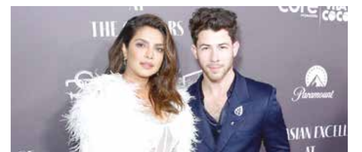
Priyanka Chopra and Nick Jonas Celebretainment | Los Angeles

Priyanka Chopra says her husband Nick Jonas is her "biggest champion."