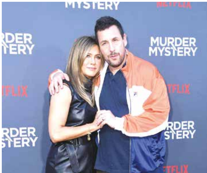
Jennifer Aniston and Adam Sandler

"If I get anything from him, it's, 'What are you doing?'" usually based on someone I'm dating," Aniston shared before imitating Sandler yelling, "What are you doing? What's wrong with you?!"