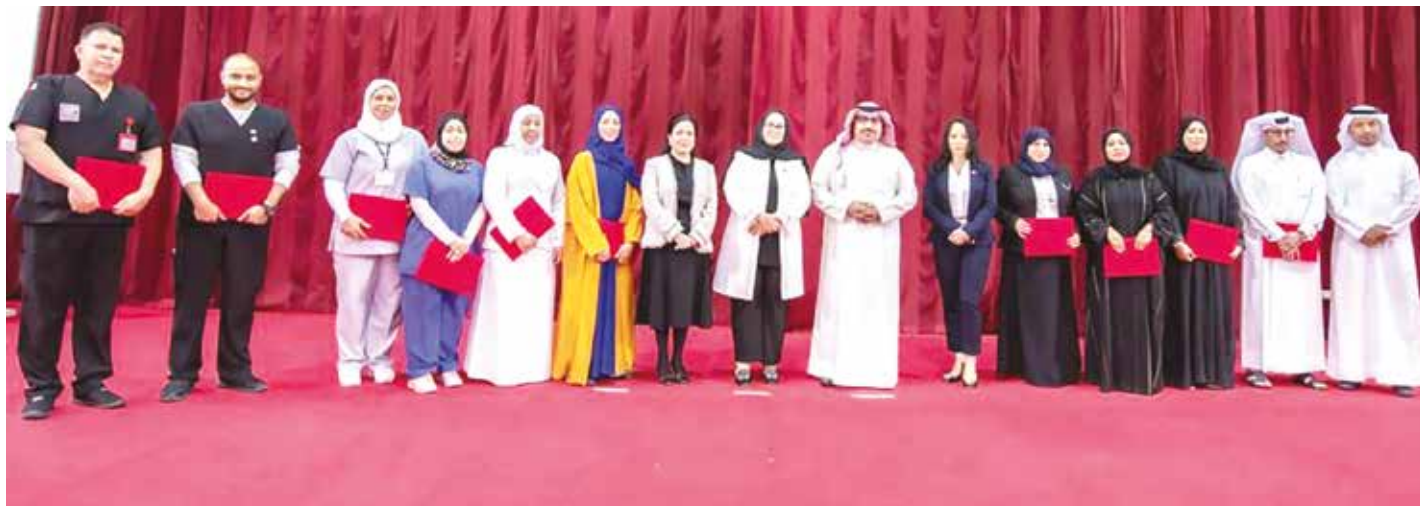
The inauguration of the Paramedic in Every House held in the Ministry of Education hall in Isa Town.

Training the students will be physical education teachers who will undergo a three-year training to become qualified instructors. The project will