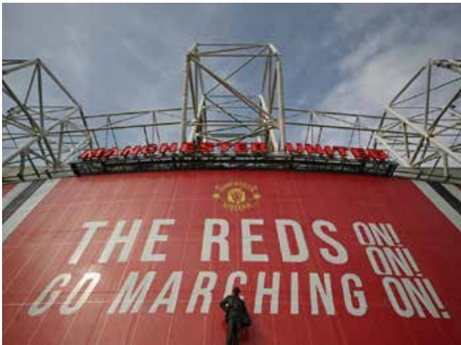
A general view outside Old Trafford stadium