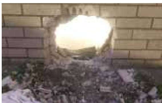
They used makeshift tools to take advantage of a construction flaw

They used makeshift tools made from a toothbrush and a metal object to take advantage of what the sheriff's office called a construction flaw in a wall of the prison to gain access to