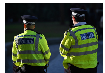
Police officers stand near a crime scene (file photo)

Abbk, originally from Sudan, will next appear at Birmingham