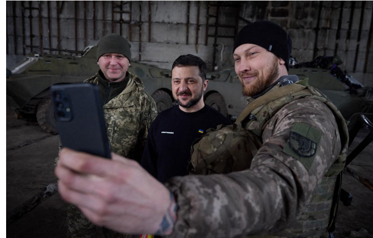
Ukrainian President Volodymyr Zelensky (C) taking a selfie with servicemen after meeting them in a warehouse and handing out awards, near Bakhmut

"The aggressor has not given up hope of taking Bakhmut at all