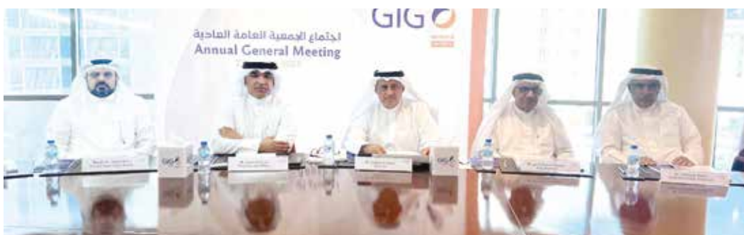
Takaful officials during the AGM on Wednesday

of the Company's Board of Directors, said that despite the significant economic fluctuations during the year 2022, the Company's total written contributions increased to BD 24,920m compared to BD 22,806m for the previous year.