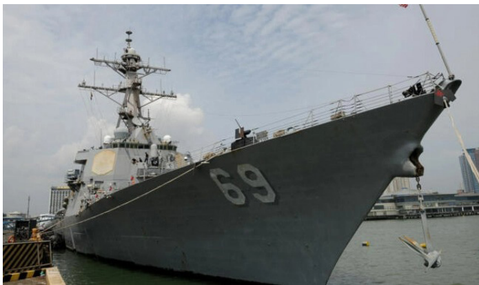
The USS Milius DDG69, a multi-mission-capable guided missile destroyer ship, is shown docked at Manila's south harbour

The Southern Theater Command of China's People's Lib-