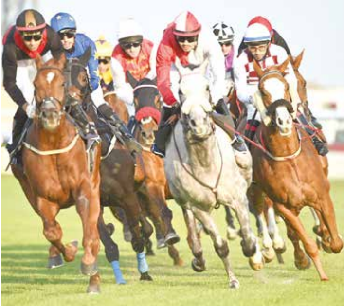
Action from the Bahrain Turf Series

Following the disqualification of Hesham Al Haddad-trained racehorses from two Bahrain Turf Series racedays on December 30 and January 13, Inigo Jones has been promoted to the top of the middle distance 'Pot