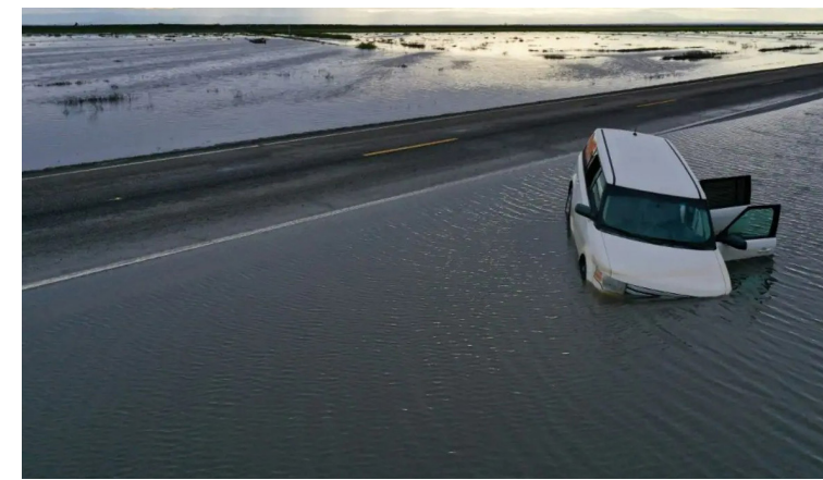
An aerial image shows a vehicle in flood waters following flooding in the Central Valley from a winter storm in Tulare County near Allensworth, California

A tornado tore through a southern California city, ripping roofs off buildings and throwing cars around, as the state's ongoing winter weather drama turned even wilder.