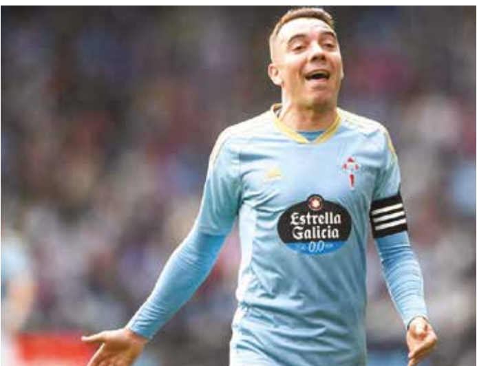
Celta Vigo's Spanish forward Iago Aspas reacts during a match (file photo)

"I was impatiently waiting for Spain to score," the 35-year-old added.