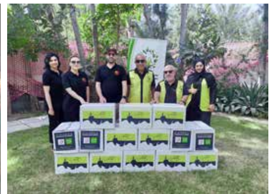
In pictures, the launch event of charitable initiatives