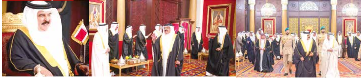
His Majesty King Hamad bin Isa Al Khalifa yesterday hosted an Iftar banquet at Al Sakhir Palace, in the presence of His Royal Highness Prince Salman bin Hamad Al Khalifa, the Crown Prince and Prime Minister. Their Highnesses, Royal Council members, and senior members of the Royal Family congratulated HM the King, wishing him abundant health and long life and Bahrain and its people further progress and prosperity under his wise leadership.