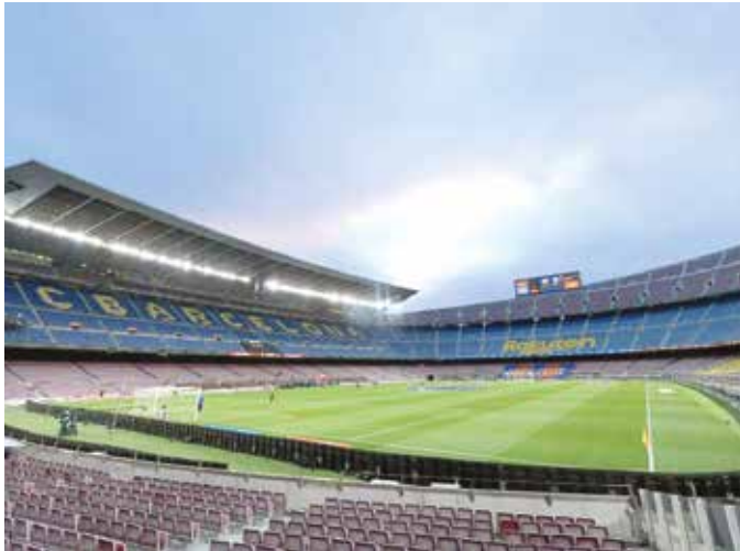
A general view of the inside of the Camp Nou stadium