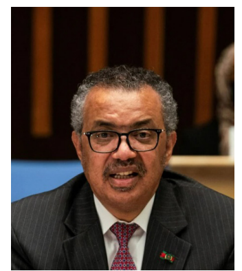
Tedros Adhanom Ghebreyesus

change that. The accord will help countries better guard against pandemics. It will help us to better protect people regardless of whether they live in countries that are rich or poor," he tweeted.