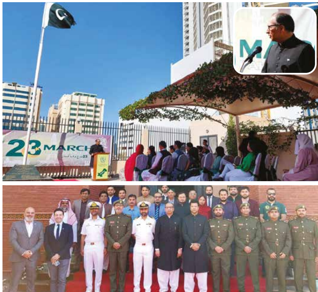
In pictures, the National Day celebrations yesterday at the Pakistan Embassy

Marking the day, the Pakistani community members in Bahrain organised an art ex-