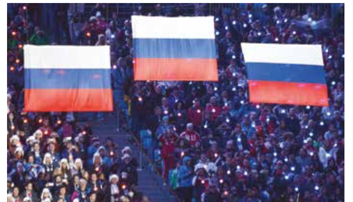
Russian flags are seen above the podium during an athletics meet (file photo)