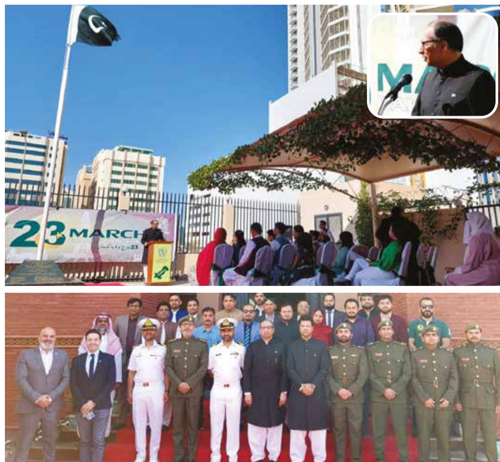
In pictures, the National Day celebrations yesterday at the Pakistan Embassy

Marking the day, the Pakistani community members in Bahrain organised an art ex-