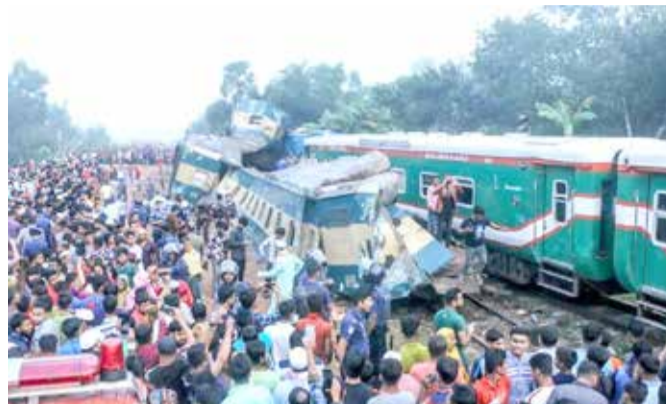
The crash in the eastern city of Bhairab saw a freight train smash into a passenger train travelling in the opposite direction