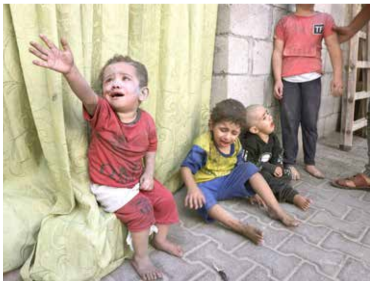
Palestinian children covered in dust from an Israeli air strike sit in the grounds of a hospital in Rafah, in the southern Gaza Strip