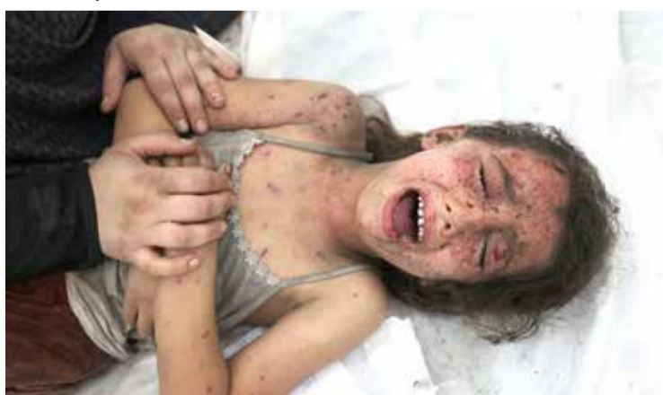
A young Palestinian girl has her hand held by a relative as a medic treats her wounds at a hospital following an Israeli air strike in Rafah, in the southern Gaza

The 27-nation EU bloc has long been split over its policy on Israel and the Palestinians.