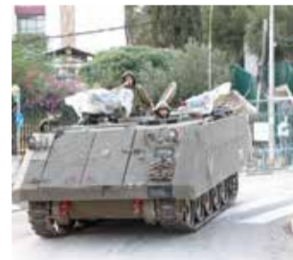
Israeli soldiers patrol an area near the northern border of Lebanon

At least 10 other people were killed in new strikes on Monday morning, the media office