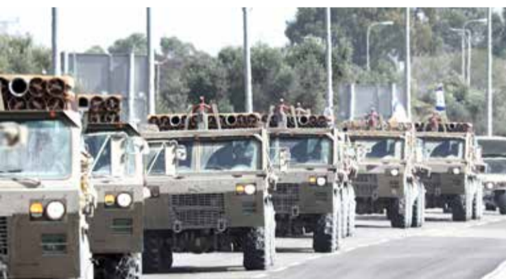
A convoy of Israeli army trucks carrying mortar shells advances on a road near the southern city of Sderot