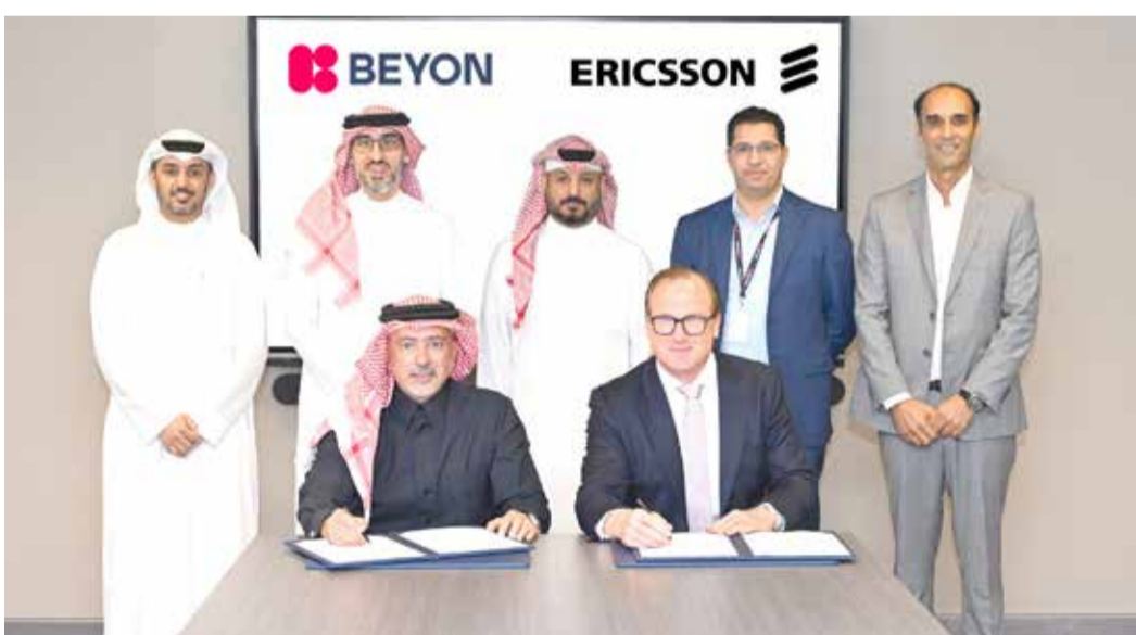
Officials following the deal signing

They also announced the successful outcomes of their sustainability collaboration, signed in early 2024, for accelerating the journey to a Net Zero future for both companies and managing Waste from Electronic and Electrical Equipment (WEEE). Key achievements during the year include the initiation of 'Ericsson Product Take-Back Programme', which addresses the issue of e-waste and enables recycling of end-of-life electronic and electrical equipment in a responsible and sustainable