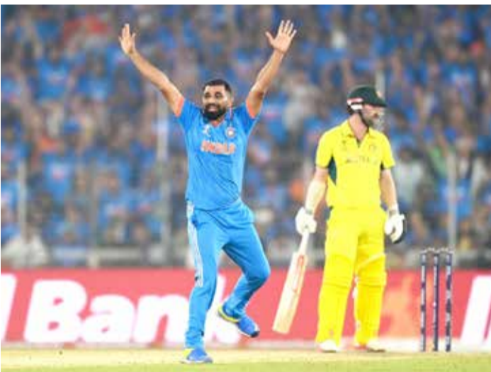
Mohammed Shami appeals for a dismissal (file photo)

"However, his left knee has exhibited minor swelling due