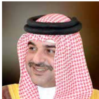
His Highness Shaikh Abdullah bin Hamad bin Isa Al Khalifa, President of the Supreme Council for Environment

Vehicles that fail to meet these requirements will be prohibited from transporting waste.