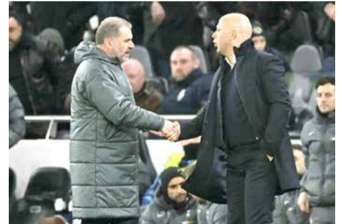
Liverpool's Dutch manager Arne Slot (R) shakes hands with Tottenham Hotspur's Greek-Australian Head Coach Ange Postecoglou (L)