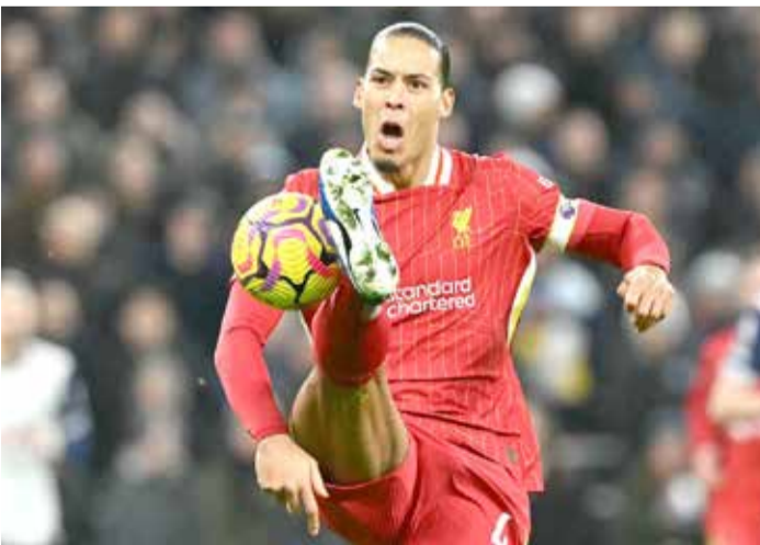
Virgil van Dijk in action during a match

Van Dijk is one of three key players whose deals are entering their final six months, with Trent Alexander-Arnold and Mohamed Salah the others.