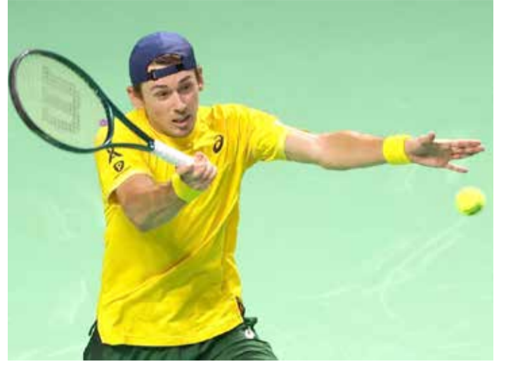
Alex De Minaur in action during a match (file photo)

He gets his season underway on Saturday at Ken Rosewall Arena in Sydney against world number 39 Tomas Etcheverry when the Lleyton Hewitt-captained Australia face Argentina.