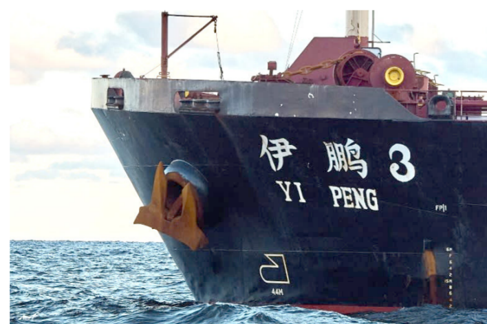
The Yi Peng 3 had been anchored in the international waters of the Kattegat strait between Sweden and Denmark