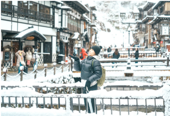
A tourist enjoys the snow in Ginzan Onsen in Obanazawa, Yamagata Prefecture

post-pandemic travel boom. "Traffic jams have sometimes been caused by cars getting stuck in the snow, because travellers were driving with normal tyres..."