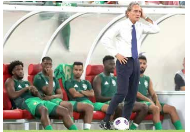
Saudi Arabia's Italian coach Roberto Mancini looks on during the 2026 FIFA World Cup Asian qualification football match between Saudi Arabia and Japan

After surprisingly resigning from the top job with Italy, the 60-year-old penned a deal worth a reported $25 million a year with Saudi Arabia, which would run through to 2027.