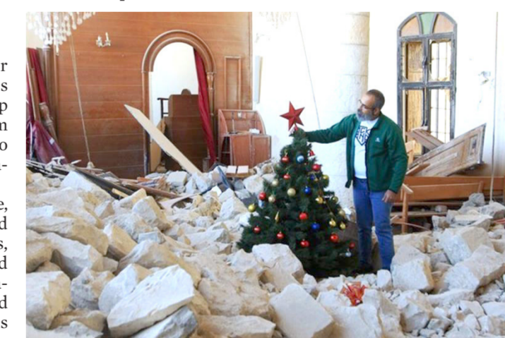
A man sets up a Christmas tree amidst the rubble of the Melkite Church, in the southern Lebanese village of Derrghaya

Lebanon's prime minister called on the United States and France to help speed up Israeli forces' withdrawal from his country nearly a month into a fragile ceasefire between Israel and Hezbollah.