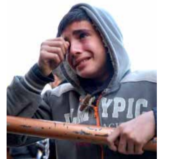
A boy reacts as he stands outside the morgue of the Nasser Medical Complex in Khan Yunis in the southern Gaza Strip