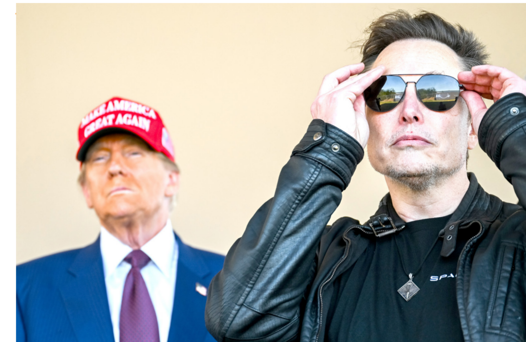
US President-elect Donald Trump and Elon Musk watch the launch of the sixth test flight of the SpaceX Starship rocket (file photo)