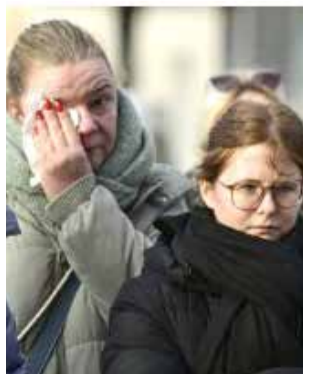
People mourn at a makeshift memorial outside the Johanniskirche (Johannes Church)

The 50-year-old psychiatrist arrived in Germany in 2006 and was granted refugee status 10 years later, according to German media and a Saudi activist.