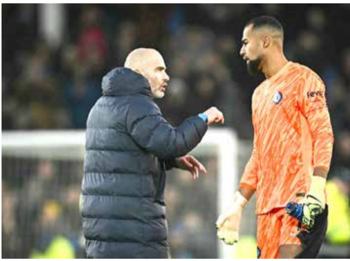
Chelsea's Italian head coach Enzo Maresca (L) speaks with Chelsea's Spanish goalkeeper #01 Robert Sanchez

Maresca -- speaking before Liverpool's victory was confirmed -- said: "I am absolutely happy. I just said to the players I am more happy today than I was