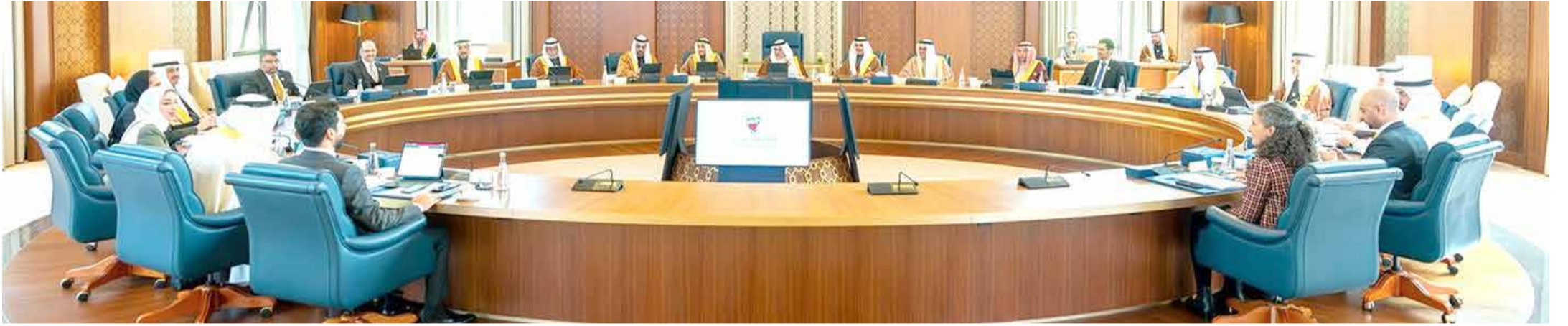
HRH CP, PM chairing Cabinet meeting at Gudaibiya Palace,