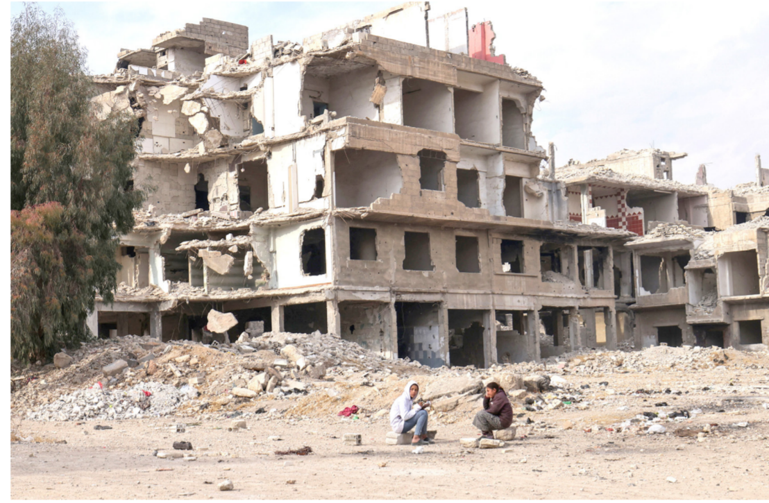
Girls sits near damaged buildings in the devastated Hajar al-Aswad area near the Yarmuk camp on the outskirts of Damascus

Two Syrian doctors and a nurse told AFP in a series of interviews over the weekend that Bashar al-Assad's government coerced them into providing false testimony to international investigators after a deadly 2018 chlorine attack.