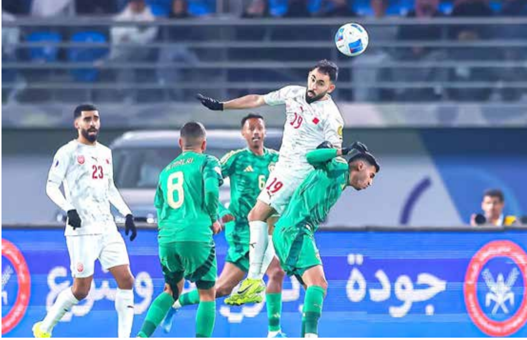
Action from the match