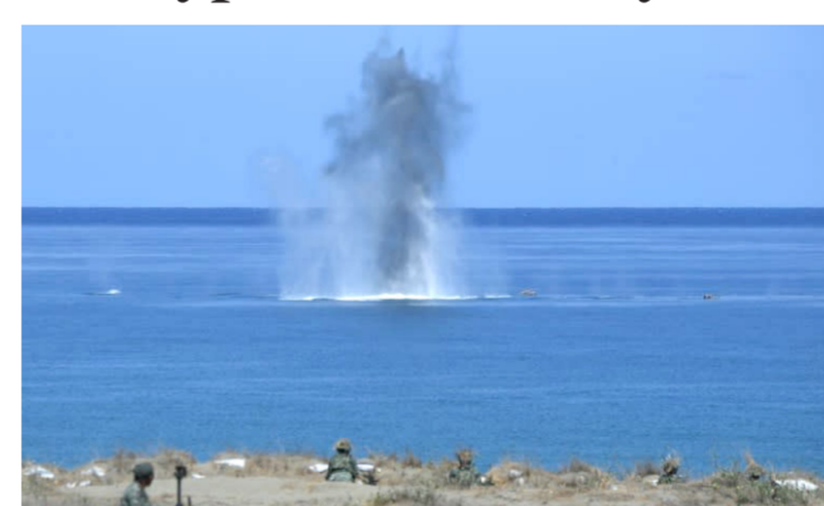
Philippine and US Marines take part in a live fire exercise during annual joint military drills in the northern Philippines (file photo)