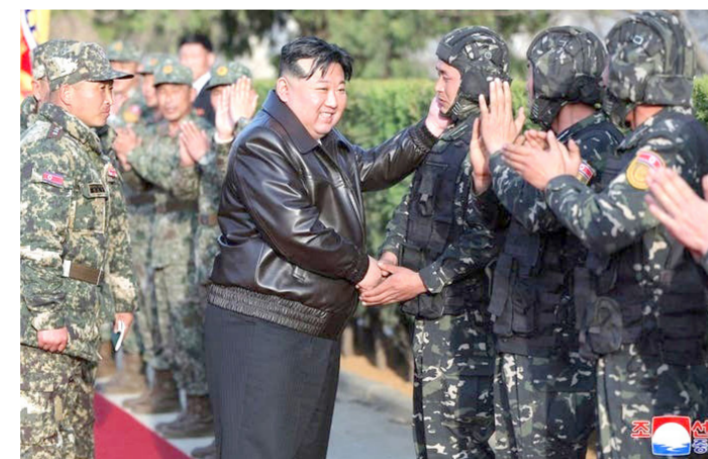
North Korean leader Kim Jong Un greets soldiers as he inspects a tank unit of the Korean People's Army (file photo)

More than 1,000 North Korean soldiers have been killed or wounded in Russia's war with Ukraine, South Korea's Joint Chiefs of Staff (JCS) said yesterday.