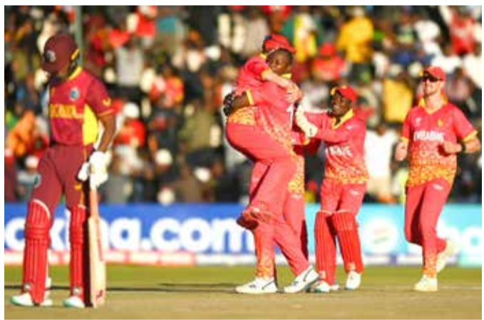
Zimbabwe players celebrate a wicket AFP | Harare

Zimbabwe stunned West Indies by 35 runs in a crucial World Cup qualifying triumph on yesterday while the Netherlands ended Nepal's hopes of reaching the global showpiece for the first time.