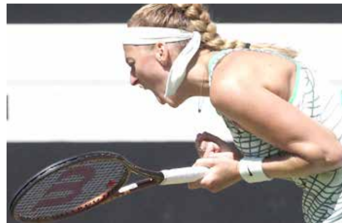
Petra Kvitova celebrates winning against Caroline Garcia