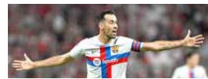
Sergio Busquets

Inter Miami announced on Friday they are signing former Spain and Barcelona midfielder Sergio Busquets to team-up with Lionel Messi at the Major League Soccer club.