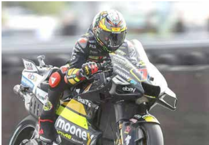
Ducati's Italian rider Marco Bezzecchi competes during the Moto GP qualifying practice session

And the Italian, who dominated practice and set a record