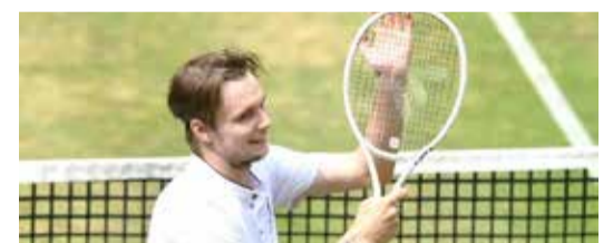
Alexander Bublik | Halle

A lexander Bublik eased past home hope Alexander Zverev 6-3, 7-5 to reach the final of the Halle ATP tournament yesterday.