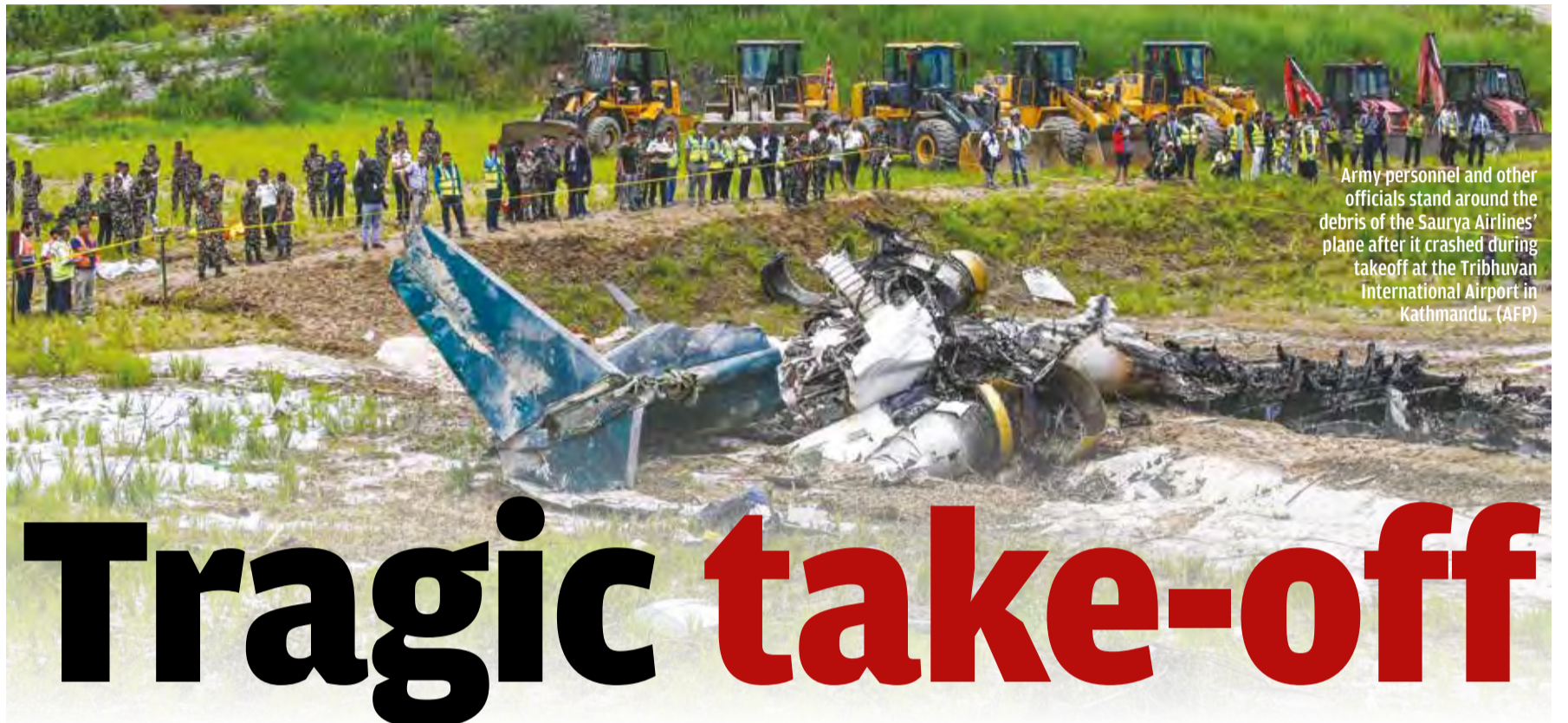
Army personnel and other officials stand around the debris of the Saurya Airlines' plane after it crashed during takeoff at the Tribhuvan International Airport in Kathmandu.