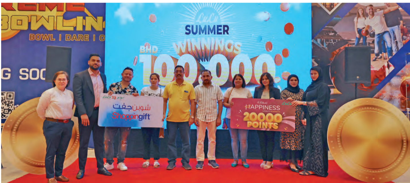
Summer winnings third raffle prize distribution held at LuLu hypermarket Dana Mall.

place at Lulu Hypermarket Dana Mall and was conducted in the presence of Lulu Senior Management. The Summer Raffle Draw will put BD 100,000 worth of prizes into the hands of shoppers just in time for the busy retail season before summer break and school opening.