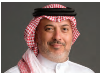
Shaikh Khalifa bin Ebrahim Al-Khalifa

As part of Bahrain Bourse's (BHB) efforts to develop the Capital Market in the Kingdom of Bahrain and enhance market liquidity, and following the approval of the Central Bank of Bahrain (CBB), Bahrain Bourse announces the launch of 'Technical (Uncovered) Short Selling Guidelines' to market participants through authorized brokerage firms, which aims