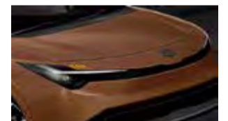
TDT | agencies

According to media reports, Toyota is said to be working on the next-generation iteration of its most popular sedan, the Corolla.