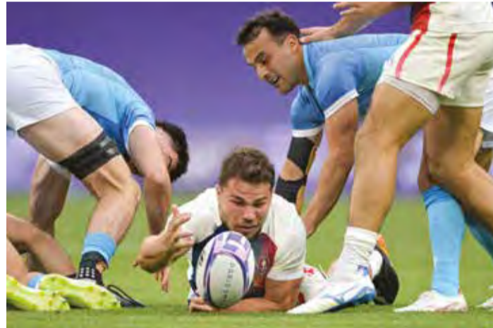
France's Antoine Dupont (C) fumbles the ball during the men's pool C rugby sevens match between France and Uruguay during the Paris 2024 Olympic Games at the Stade de France in Saint-Denis

The 27-year-old took the gamble of missing the Six Nations to make the French Olympic