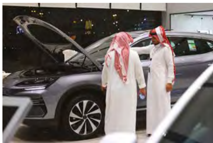
A man inspects an electric car at a showroom in Riyadh