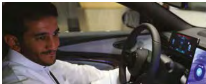
Men inspect an electric car at a showroom in Riyadh

“More than one car brand has opened its doors in the kingdom and now offers after-sales service, which has encouraged consumers,” he said at an exhibition