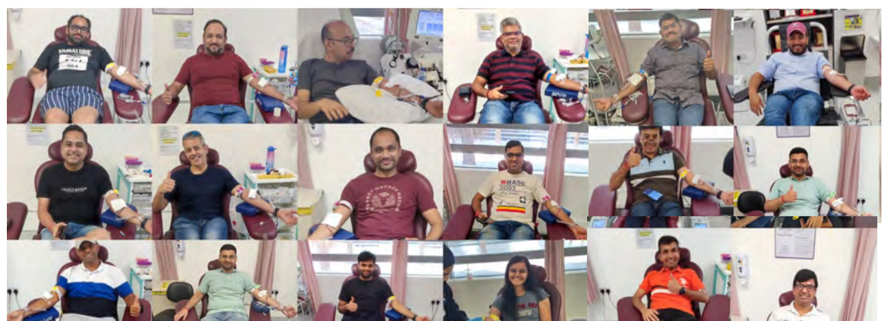
Participants at the event

The Bahrain Chapter of ICAI is the largest body of professionals in the Kingdom of Bahrain, with over 450 members. It provides a forum for the members of the Institute of Chartered Accountants of India (ICAI) to develop professionally and personally and undertakes various initiatives to serve society.