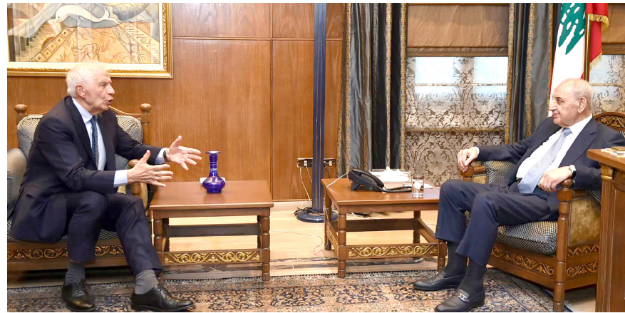
Lebanese Parliament Speaker Nabih Berri met with European Union foreign policy chief Josep Borrell

A spokesman for Katz said he commended US efforts towards de-escalation in Lebanon, but said Israel would "continue to act decisively in response