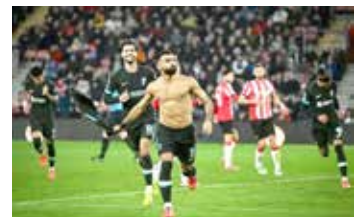
Mohamed Salah celebrates a goal

Mohamed Salah fired Liverpool eight points clear at the top of the Premier League as the leaders survived a scare from lowly Southampton thanks to the Egypt star's second half double in a 3-2 away win yes-