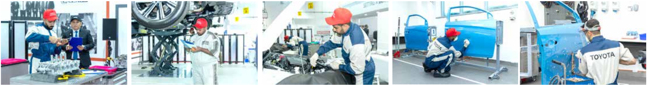
Employees from Toyota and Lexus divisions show their technical expertise and knowledge during the contest

The event celebrated not only technical skills but also the company's broader commitment to workforce development and industry leadership.