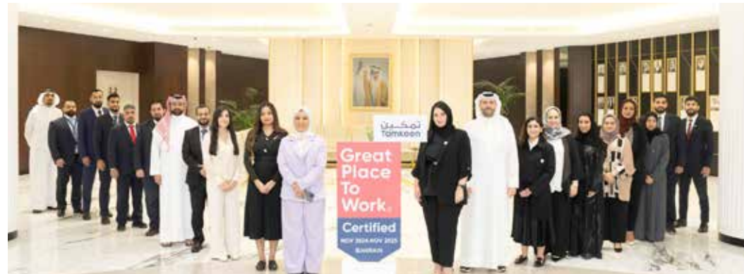
Tamkeen employees celebrate after being awarded