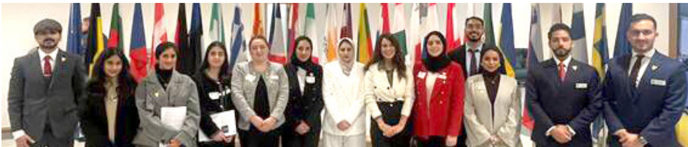
The Bahraini delegation at the event