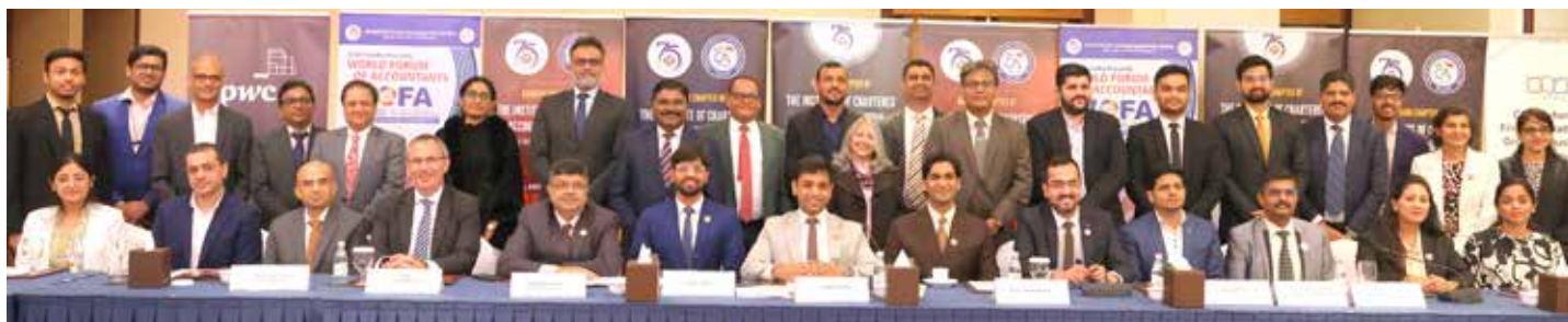
Bahrain ICAI Chapter officials and members

This prestigious gathering will bring together global leaders, industry experts, and professionals to discuss topics including networking strategies, technological advancements, artificial intelligence, governance excel-