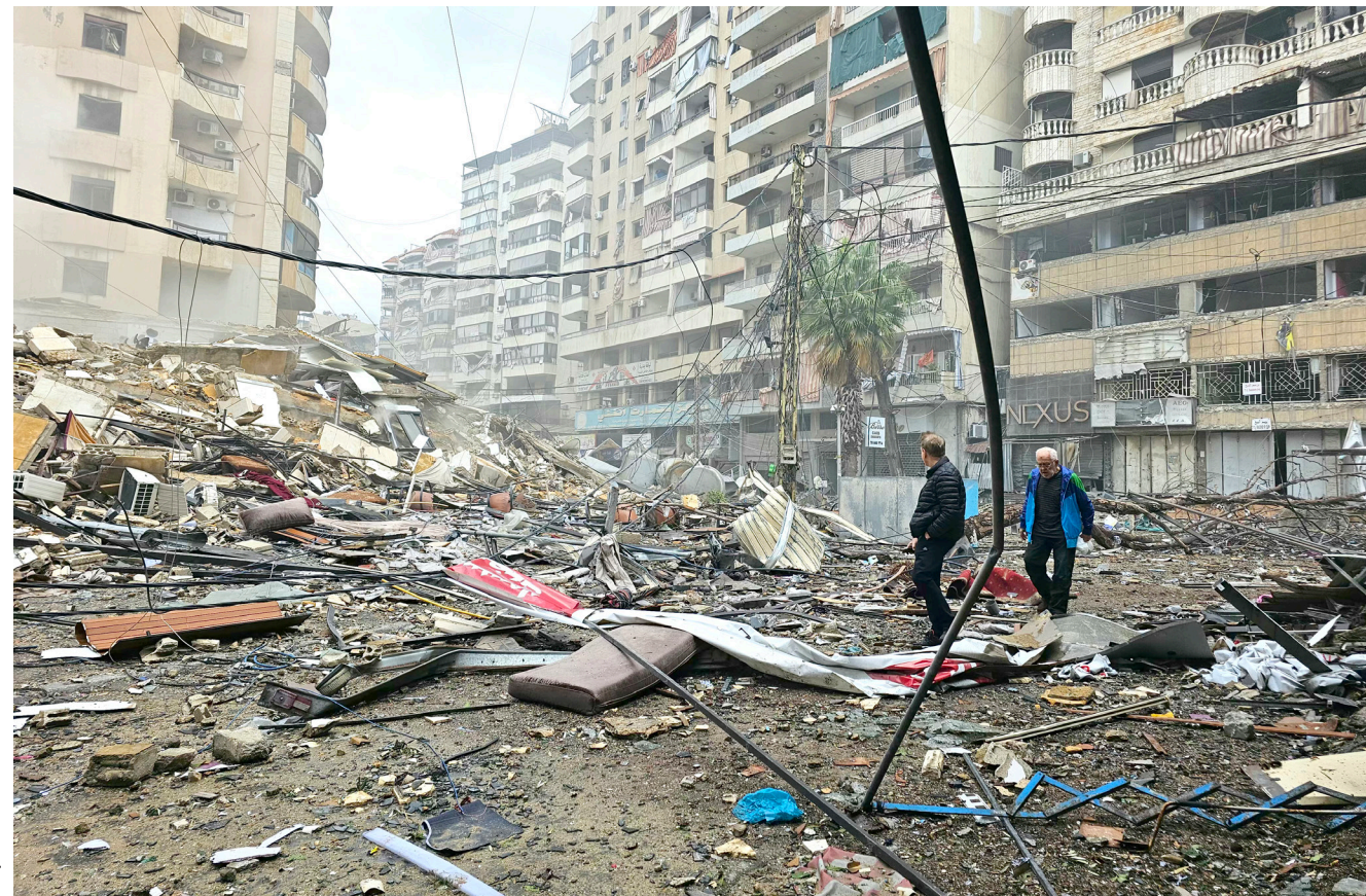
Residents walk amid the destruction in the neighbourhood of Rweiss in Beirut's southern suburbs

ready to provide 200 million euros ($208 million) to help bolster the Lebanese armed forces.