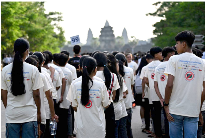
Students gather in front of the Angkor Wat temple as they take part in a march for the banning of landmines