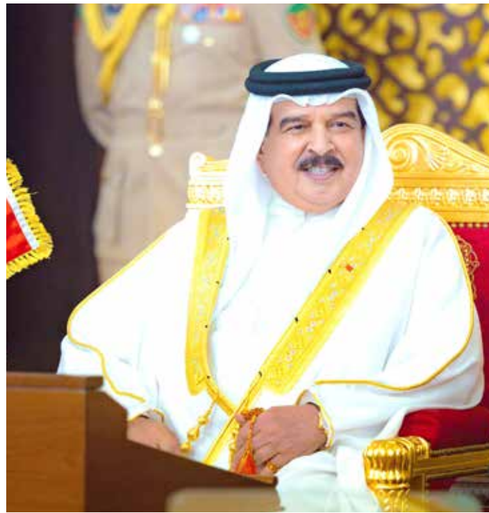
His Majesty expressed optimism for future successes and extended his congratulations to all winners. Following the King's speech, achievers and medal winners

"As ambassadors for our beloved nation, you embodied the values we hold dear," he remarked.