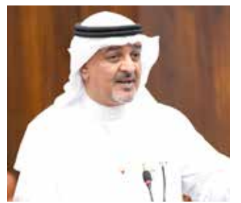
MP Jalal Kazim

Kazim highlighted the importance of enhanced cooperation between the government