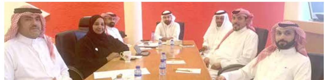
The committee meeting in progress