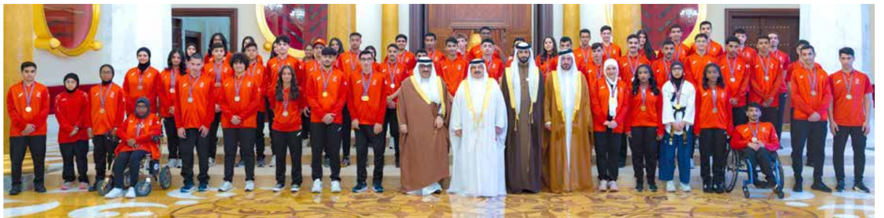
HM the King receives royal family members, senior officials and achievers

His Majesty Praises Gymnasiade Achievements