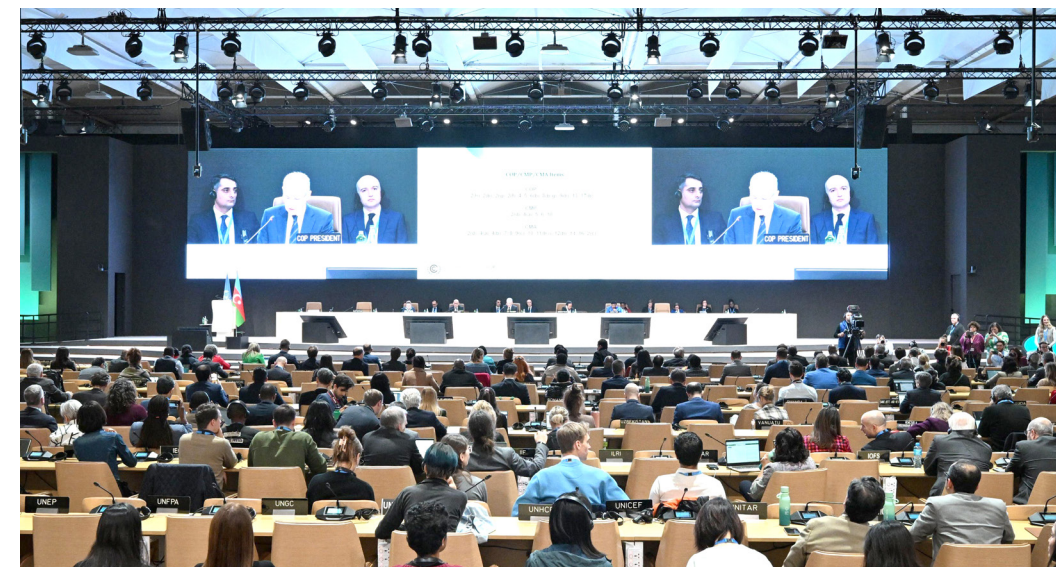
COP29 President Mukhtar Babayev speaks at a first closing plenary of the COP29 Climate Conference in Baku

Sierra Leone's climate minister Jiwoh Abdulai said it showed a "lack of goodwill" from rich