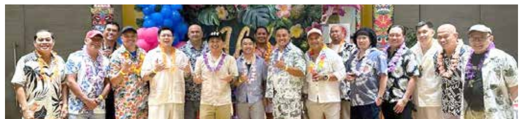
The Travelers Tribe Masonic Club of Bahrain officials and members

A unique cultural blend of Hawaiian theme imbuing a cultural fusion exuding warmth and gratitude has transformed the venue into a vibrant par-