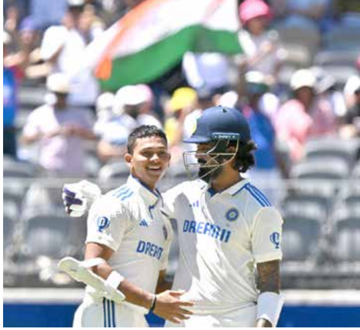
KL Rahul congratulates Yashasvi Jaiswal on his hundred