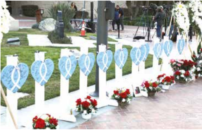
The names of the eleven people killed are written on hearts as people gather for a candlelight vigil after a mass shooting during Chinese Lunar New Year celebrations in Monterey Park, California

The report comes days after a pair of mass shootings in California took the lives of 18 people and as authorities searched