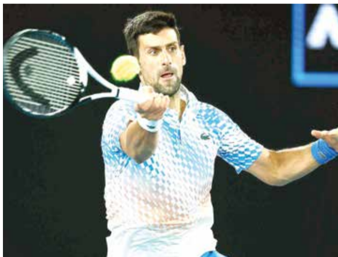
Novak Djokovic in action during his match against Andrey Rublev

"Last two matches, playing against two guys who were in form and to beat them dominantly in three sets is something that I definitely want in this moment, something that sends a message to all my opponents,"