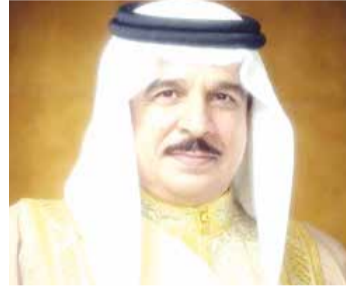
HM the King

His Royal Highness sent a similar cable to the Prime Minister Narendra Modi.