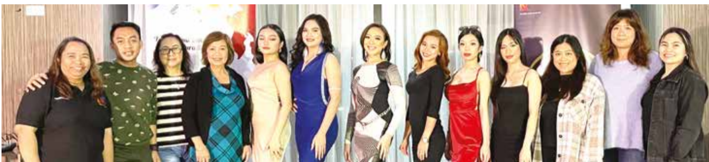
Candidates pose during the screening