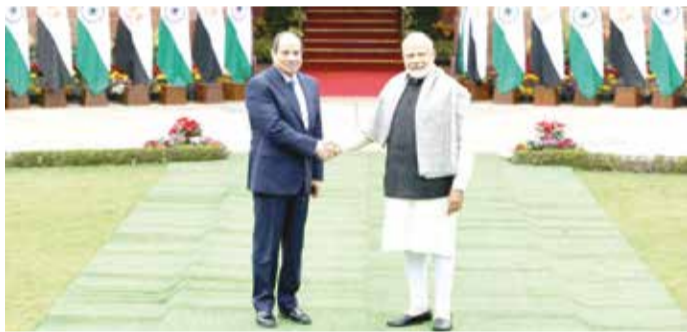
Egyptian President Abdel Fattah El Sisi shakes hands with Indian Prime Minister Narendra Modi before their meeting at the Hyderabad House in New Delhi, India,

Egyptian President Abdel Fattah al-Sisi held talks with Indian Prime Minister Narendra Modi in New Delhi as part of a state visit where he will meet business leaders and be a guest of honour at India's Jan. 26 Republic Day.