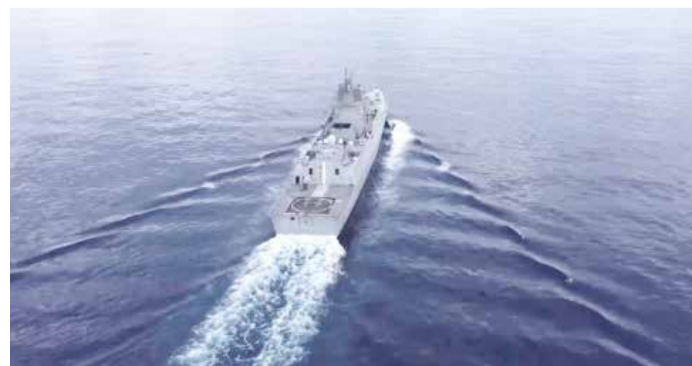
A still image from video released by the Russian Defence Ministry shows what it said to be frigate 'Admiral of the Fleet of the Soviet Union Gorshkov' during an exercise in the Atlantic Ocean

Tensions between the West and Russia have reached the