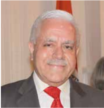
Ambassador Ashok Sajjanhar

[The writer is former Indian Ambassador to Kazakhstan, Sweden and Latvia.]