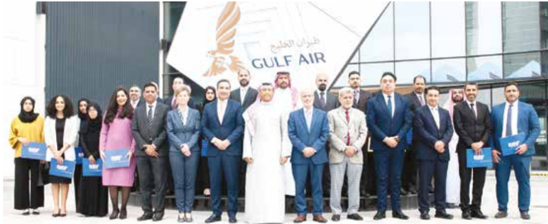
In pictures, Gulf Air officials with the first batch of Succession Programme