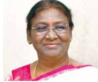
President Droupadi Murmu

His Majesty and HRH the Crown Prince and Prime Minister sent cables of congratulations to the Commonwealth of Australia Governor-General David Hurley on Australia Day.