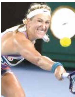
Victoria Azarenka plays a backhand return to Jessica Pegula