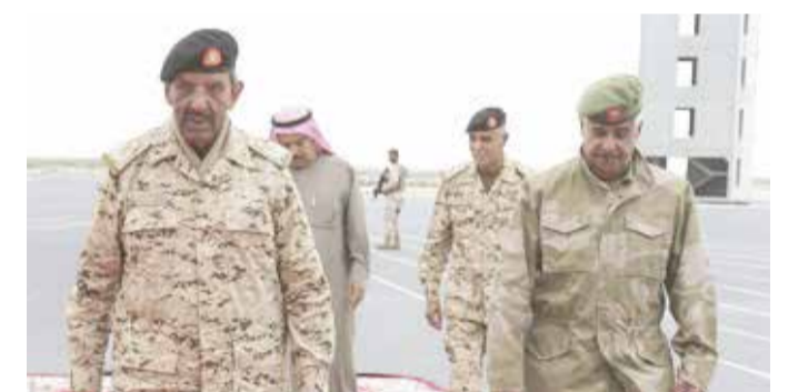
Field Marshal Shaikh Khalifa bin Ahmed arrives at the site of the joint drill