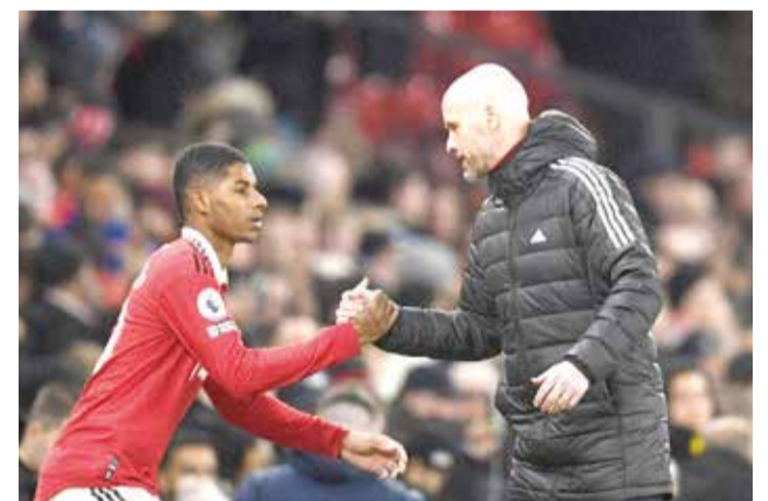
Manchester United's manager Erik ten Hag (R) congratulates striker Marcus Rashford (L) after a match (file photo)