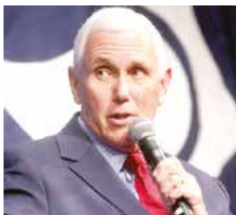
Former US Vice President Mike Pence