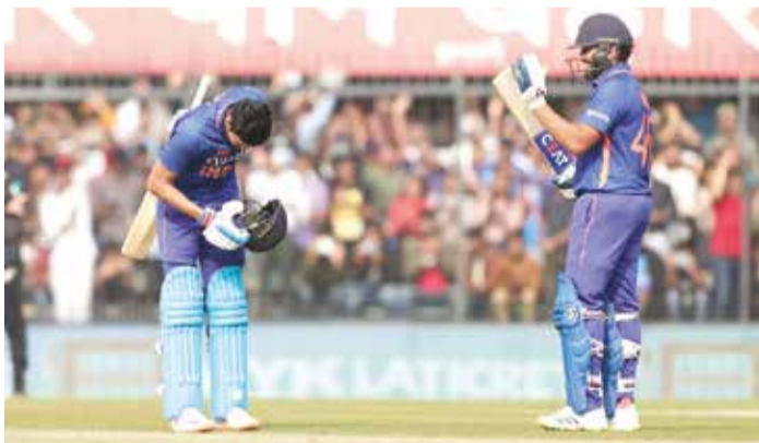
Rohit Sharma applauds Shubman Gill on his century

It might be premature to say Shubman Gill has nailed down the India opener's slot for the Cricket World Cup on home soil later this year but skipper Rohit Sharma has been impressed by the 23-year-old's understanding of the role. With veteran Shikhar Dhawan's patchy form effectively taking him out of the running for a place at the tournament, India have zeroed in on Gill and Ishan Kishan as Rohit's potential opening partners. Gill has grabbed the opportunity with both hands and his 112 against New Zealand on Tuesday was his third hundred in four innings, which include a double hundred in the series opener in Hyderabad. Gill and fellow centurion Rohit forged a 212-run stand on Tuesday to set up a 3-0 series sweep as India dethroned New Zealand as the top-ranked one-day team. "He understands his batting, he paces his innings well," Rohit