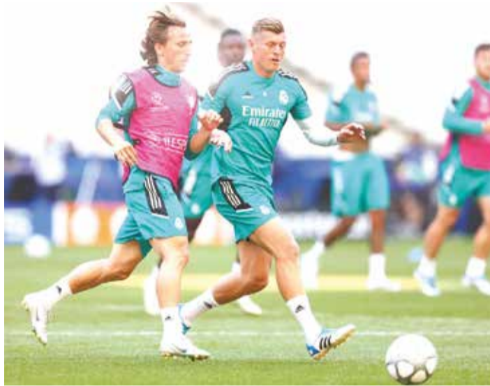
Luka Modric and Toni Kroos of Real Madrid warm up during a training session

Carlo Ancelotti said yesterday veteran midfielders Luka Modric and Toni Kroos are still key for Real Madrid even though he dropped the pair last weekend. Los Blancos won 2-0 at Athletic Bilbao on Sunday and the duo appeared from the bench, with Eduardo Camavinga and Dani Ceballos starting ahead of them. Modric, 37, and Kroos, 33 -- both out of contract at the end of the season -- face stiff internal competition this season, with Ancelotti highlighting that Madrid are in a period of transition. "They are professionals and understand what this club means," Ancelotti told reporters ahead of Thursday's Copa del Rey quarter-final with Atletico