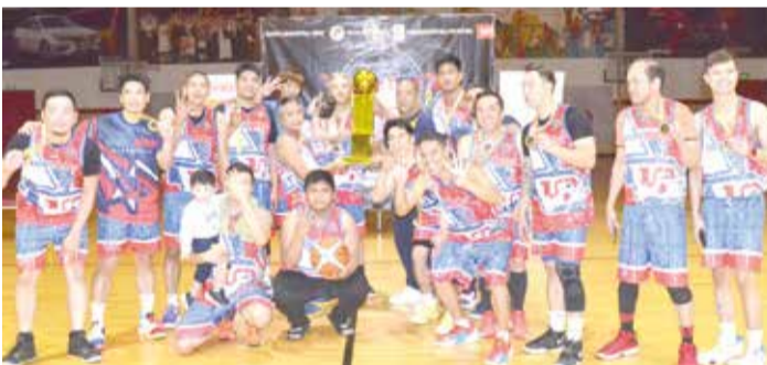
Union Press celebrate with their trophy