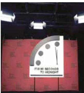
The clock with the Bulletin of the Atomic Scientists

"Russia's thinly veiled threats to use nuclear weapons remind the world that escalation of the conflict by accident,