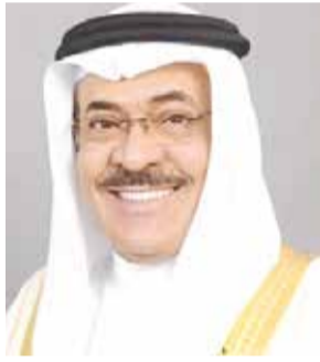
Dr Shaikh Khalid bin Khalifa

The Declaration that reflects His Majesty King Hamad bin Isa Al Khalifa's vision and approach to promote coexistence, peace and tolerance and combat terrorism in the