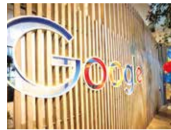
A view of the main lobby of building BV200, during a tour of Google's new Bay View Campus in Mountain View, California

changes across the ecosystem will be a complex process and will require significant work at our end and, in many cases, significant efforts from partners, original equipment manufacturers (OEMs) and developers," Google said in a blog post.