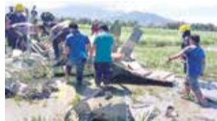
Rescuers retrieve the bodies of two military pilots