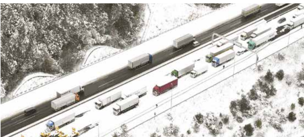
Vehicles are stuck due to heavy snowfall and snowplow cars are seen on a highway in Koga, Shiga prefecture, Japan

At least 124 people died in freezing temperatures in Afghanistan earlier this week, according to media reports, while the temperature in Mohe, China's northernmost city, dropped to a record -53 degrees Celsius (-63.4 degrees Fahrenheit) on Sunday.