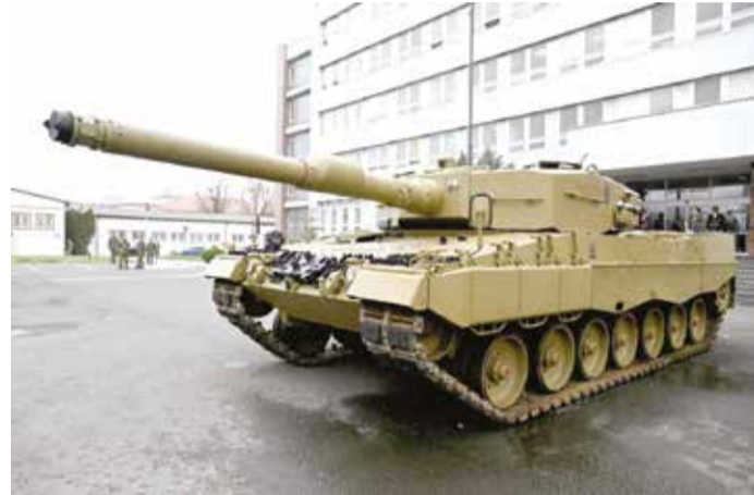
Germany delivers its first Leopard tanks to Slovakia as part of a deal after Slovakia donated fighting vehicles to Ukraine, in Bratislava, Slovakia

● Russian-backed leader says Wagner force advancing on Bakhmut