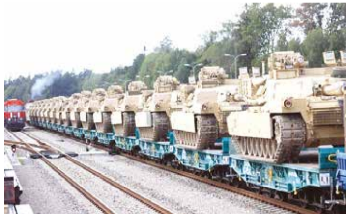
M1 Abrams battle tanks

Since then, both sides had participated in "good diplomatic conversations" that had made the difference and were part of the "extraordinary shift in Germany's security policy" over providing weapons to Ukraine since Russia invaded 11 months ago, said a senior administration official, who briefed reporters yesterday on the condition of anonymity to describe the new