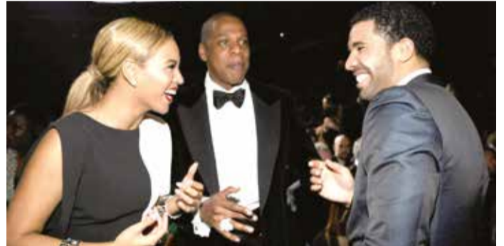
Beyonce (L) and Drake (R) talk at an event

Little Simz’s ‘No Thank You’, Knucks’ ‘Alpha Place’, Kojey Radical’s ‘Reason to Smile’, Chris Brown’s ‘Breezy’, DJ Khaled’s ‘God Did’, Cleo Sol’s ‘Mother’, and Dave’s ‘We’re All