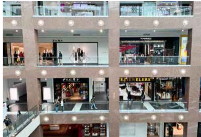
Shoppers walk through the Fashion Centre at Pentagon City, a shopping mall in Arlington, Virginia

turing and housing have been struggling after the Federal Reserve rapidly hiked interest rates in 2022 to combat surging inflation, consumption has been stronger than analysts expected.