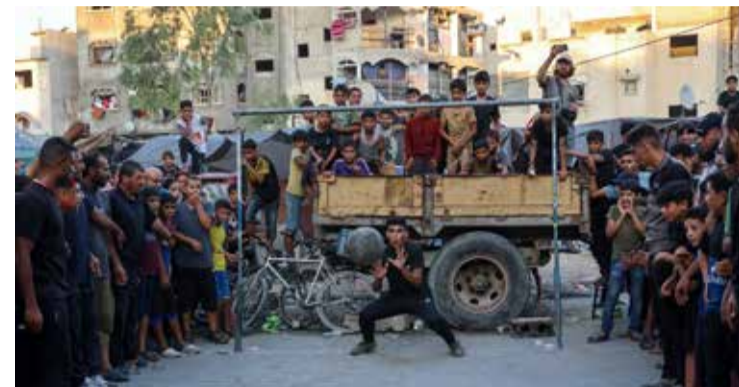
Displaced Palestinians play football in the courtyard of a UN-run school in Jabalia, in the northern Gaza Strip

With a Palestinian flag pinned to his front, the man says such attacks will be retribution for what he describes as French support of