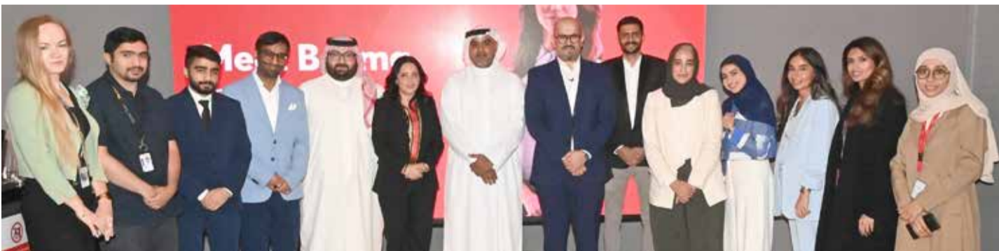
Basma Launch - Management and team members

Users can now interact with Basma in English and Arabic through seamless voice and chat conversations directly within the Batelco mobile app and web-