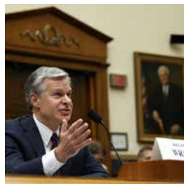
FBI Director Christopher Wray

than 30 seconds after he had fired eight shots.