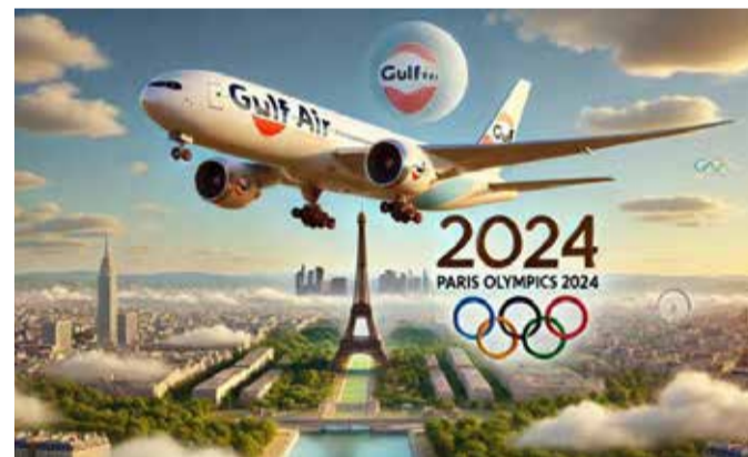
Streamlined travel for athletes, officials and spectators