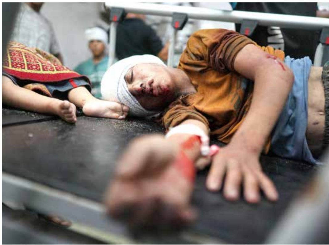
Palestinian children receive treatment at the Nasser hospital following the Israeli military targeting of the southeastern district of Khan Yunis, in the southern Gaza Strip.

Relations between Biden and Netanyahu are tense over Israel's conduct in the war sparked by Hamas's October 7 attacks, but the US president has contin-