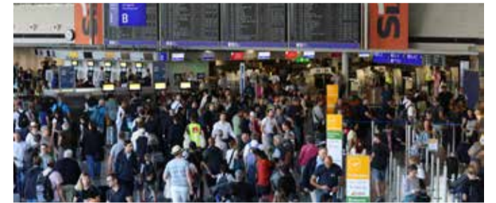
Passengers queuing under the schedule board at the departures hall at Frankfurt's International Airport, western Germany