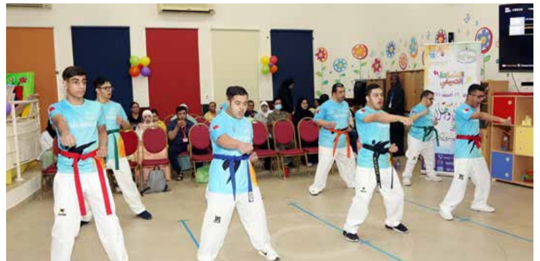
Sports is for everyone, including those with special needs