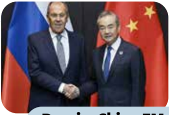
Russia, China FMs meet as ASEAN talks get underway in Laos

◆ The foreign ministers of Russia and China met yesterday on the sidelines of Association of Southeast Asian Nations (ASEAN) foreign ministers talks in Laos, Moscow and AFP journalists said. The three-day meeting of the 10-member ASEAN bloc started in the capital Vientiane on Thursday, with the South China Sea and the conflict in Myanmar high on the agenda. Sergei Lavrov held talks with Chinese Foreign Minister Wang Yi on the sidelines of the meeting, Russia's foreign ministry said. A schedule for Thursday's meeting seen by AFP showed that Lavrov was due to join Wang for a 40-minute "ministerial meeting". Lavrov left the venue at 7.15 pm local time (1215 GMT), without commenting on what the meeting had covered.