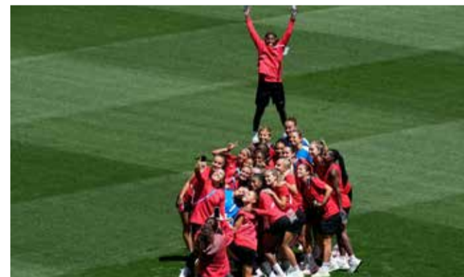
Canada’s players pose for photos on the pitch at Geoffroy-Guichard Stadium in Saint-Etienne, France