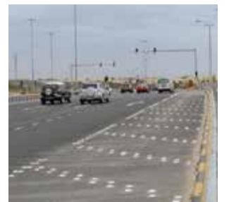
The road connecting Hunainyah Avenue to Al Muaskar Highway