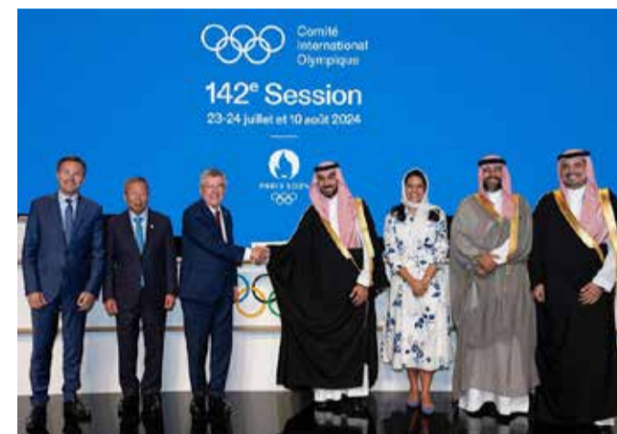
IOC and Saudi Arabian officials at the 142nd IOC Session