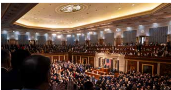
Israeli Prime Minister Benjamin Netanyahu speaks to a joint meeting of Congress at the US Capitol