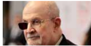
New York, United States

The man accused of trying to kill the author Salman Rushdie has been charged with terrorism for allegedly acting on behalf of Hezbollah, according to documents unsealed Wednesday.