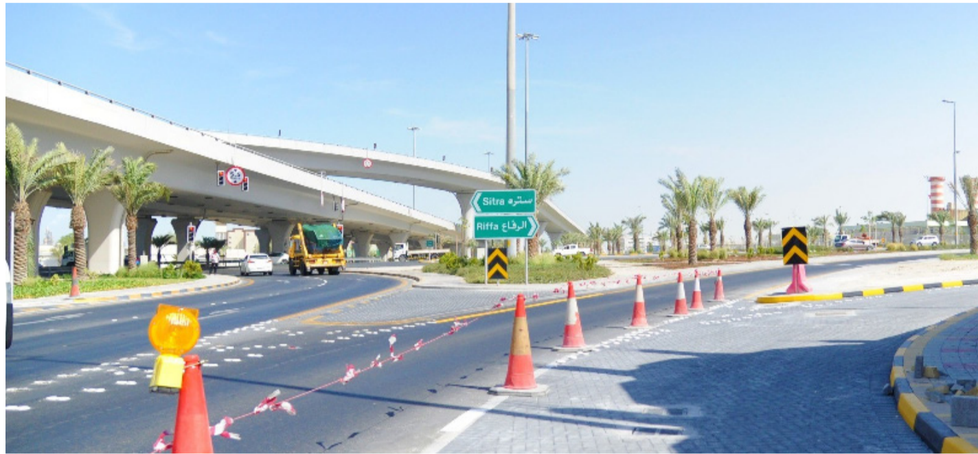
The projects offer solutions to traffic issues

The second addresses improvements to Bahrain Youth