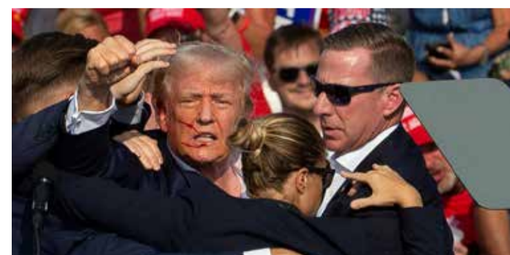
Republican presidential candidate Donald Trump is evacuated from a rally by Secret Service agents

Wray told members of the House Judiciary Committee that