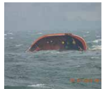
Part of MT Terra Nova oil tanker after it sank off Manila Bay

The vessel went down in rough seas as heavy rains fuelled by Typhoon Gaemi and the seasonal monsoon lashed