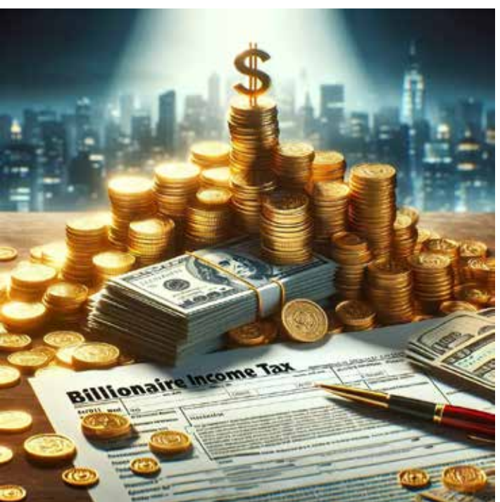
negotiate a global agreement Image used for illustrative purposes only

"We don't see a need or really think it's desirable to try to