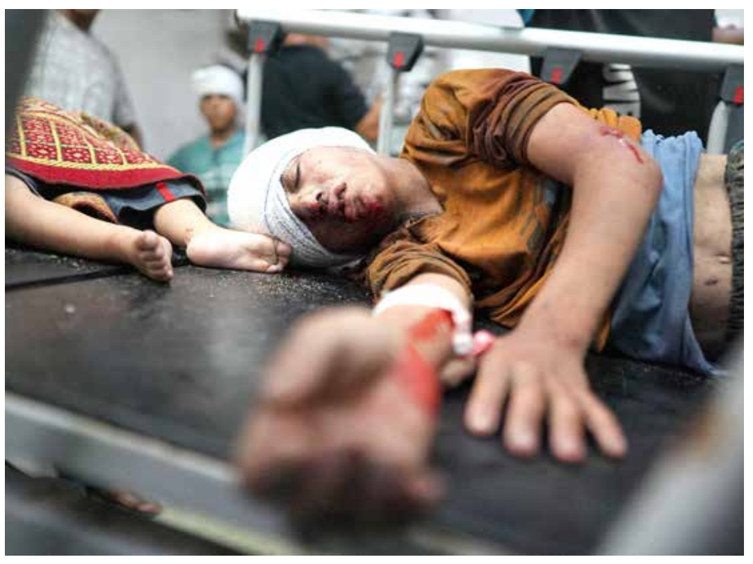
Palestinian children receive treatment at the Nasser hospital following the Israeli military targeting of the southeastern district of Khan Yunis, in the southern Gaza Strip.