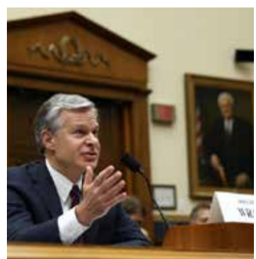
FBI Director Christopher Wray

than 30 seconds after he had fired eight shots.