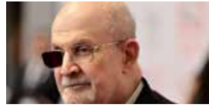
New York, United States

The man accused of trying to kill the author Salman Rushdie has been charged with terrorism for allegedly acting on behalf of Hezbollah, according to documents unsealed Wednesday.