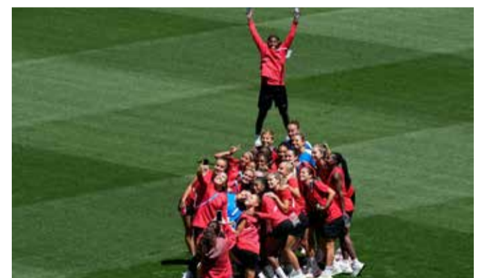
Canada's players pose for photos on the pitch at Geoffroy-Guichard Stadium in Saint-Etienne, France