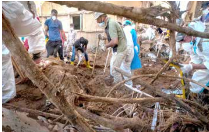
Volunteers search for bodies of flood victims amid rubble and mud, in Libya's eastern city of Derna

Almost 3,900 people died in the disaster, according to the latest official toll, and international aid groups have said 10,000 or more people may be missing.