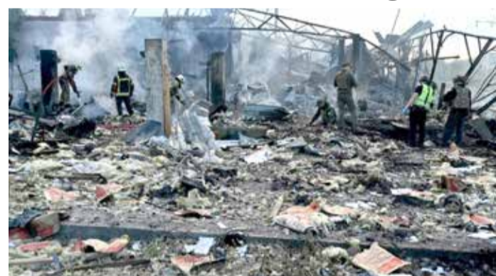
Firefighters push out a fire as police experts look for fragments of missile at a crater on an industrial area in Kyiv

"For instance, some of the rhetoric transmitted in Russian state and other media may constitute incitement to genocide," he said, adding that the team