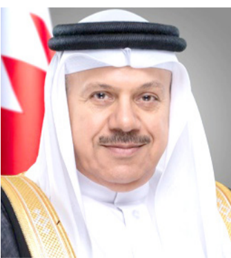
Dr. Al Zayani

He praised the role of Saudi-Bahraini Coordination