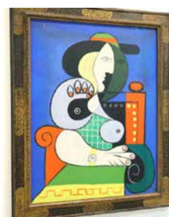
A visitor looks at Pablo Picasso's painting 'Femme a la montre' displayed for viewing at Sotheby's Dubai, ahead of an auction in New York

The viewing "marks the first time a painting of this calibre by the world-renowned artist has ever been exhibited in the UAE", Sotheby's Dubai said in a statement, noting it is the first time the portrait had been shown