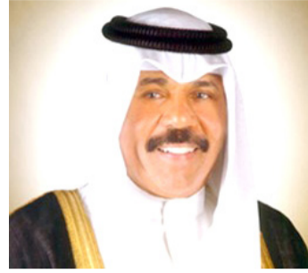
HH Shaikh Nawaf

their deepest condolences over the passing of Shaikh Mubarak Abdullah Al Ahmad Al Jaber Al Sabah.