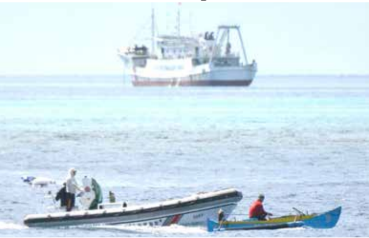
Chinese coast guard boats intercept a Philippine fishing boat after it tried to enter Scarborough Shoal (file photo)