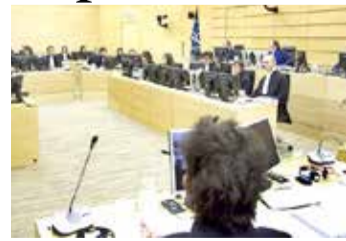
A general view inside the International Criminal Court

The ministry did not provide details of the allegations against