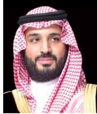
Prince Mohammed bin Salman bin Abdulaziz Al Saud

The Crown Prince and Chairman of the Board of Directors of Al Soudah Development Com-