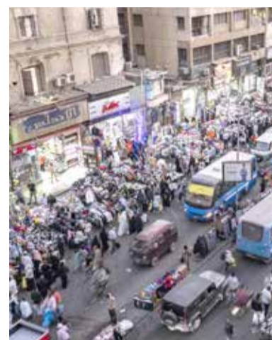
a view of vehicles and pedestrians at a street of Egypt's capital Cairo

moved forward to schedule it ahead of a possible switch to a flexible exchange rate that could exacerbate social tensions in the country of 105 million.