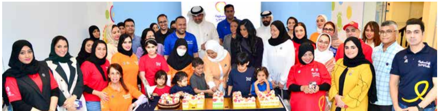
NBB employees, dignitaries and media representatives with children with cancer and their families

To date, around 250 children and their families have been supported by the Future Society for Youth's Smile Initiative from across the Kingdom. The initiative also helps to raise awareness about childhood cancers within society as a whole.