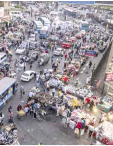
Market in Attaba Square in the centre

candidate to lead Egypt out of the economic crisis".