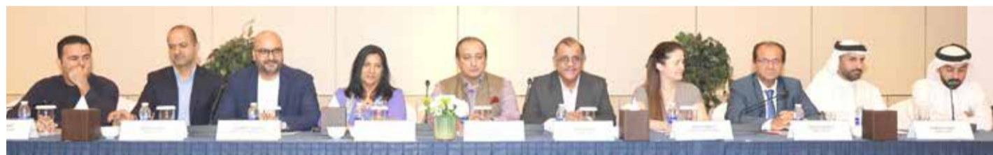
EO board members with entrepreneurs from Bahrain at yesterday's press conference

At a press conference held at the Gulf Hotel yesterday with the participation of board mem-