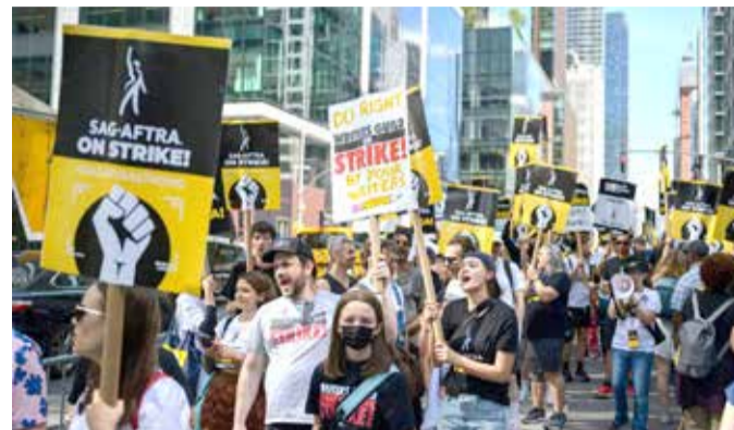
Actors, writers and other union members join SAG-AFTRA and WGA strikers on a picket line in front of the offices of HBO and Amazon