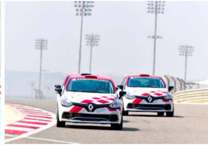
Clio Cup cars in action during Track Experiences

For Orange Media Open Track nights, booking in advance costs BD99 for the full night, BD71,500 for the half night and BD33 for a