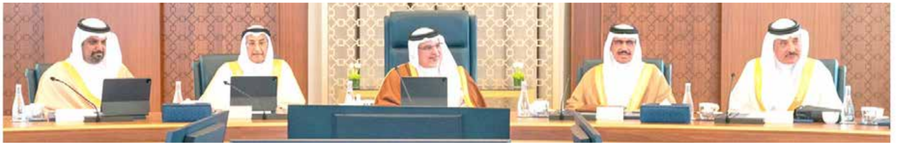
HRH the Crown Prince and Prime Minister chairs the weekly Cabinet meeting TDT | Manama

The Ministry reiterated its call to stop such hateful provocative actions, as they constitute incitement to hostility, religious and racial hatred, and contradict international efforts aimed at promoting the values of tolerance, peaceful coexistence and mutual respect between peoples and cultures.