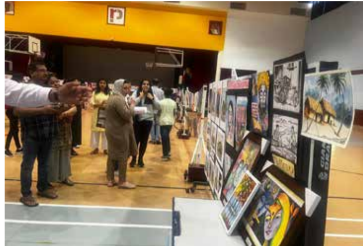
Unique drawings, sketches and paintings are on display at the venue