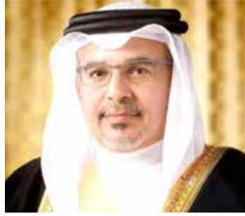
HRH Prince Salman