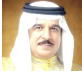
HM the King

In the cable, HM the King and HRH Prince Salman extended