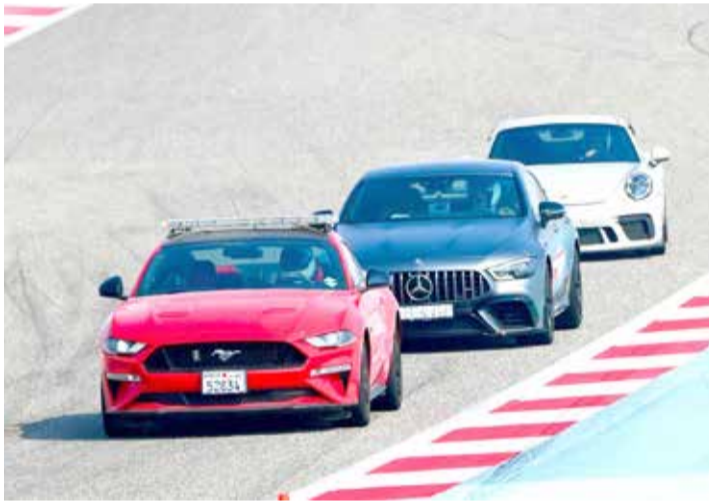
Drivers take part in the Orange Media Open Track

Track Experiences, meanwhile, offers adrenaline-pumping drives and passenger rides in three ultra-quick cars, including the Renault Clio Cup and the