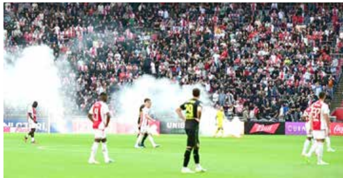
Players react after game is paused after flares land on the pitch

The KNVB association said it had been guided by the principle that in such cases "a match should preferably be decided on the field... the match must then be resumed as soon as possible."