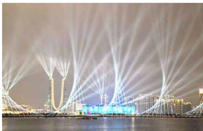
The light show for the opening ceremony of 2022 Asian Games is pictured in the sky over the Hangzhou Olympic Sports Centre Stadium