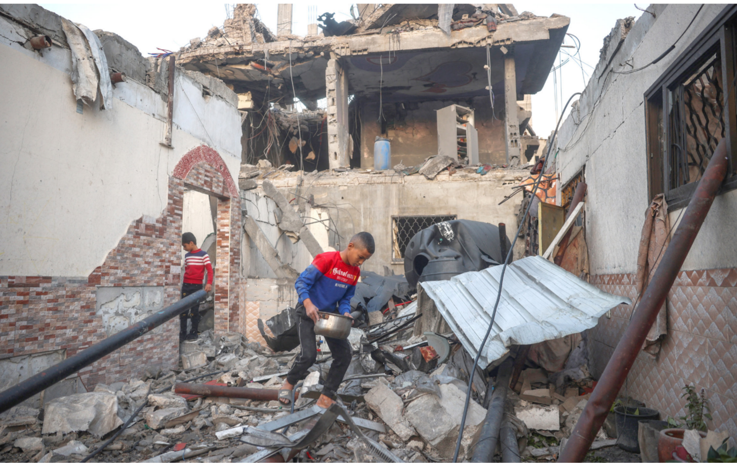
Palestinian boys salvage items from the rubble of a house that was destroyed in an Israeli strike at the Bureij refugee camp in the central Gaza Strip

"They don't have mattresses, they don't have tarps, they don't have tents, they don't have blankets, families are crying, begging because their children don't have clothes, they don't have warm clothes, babies don't have anything to keep them warm."