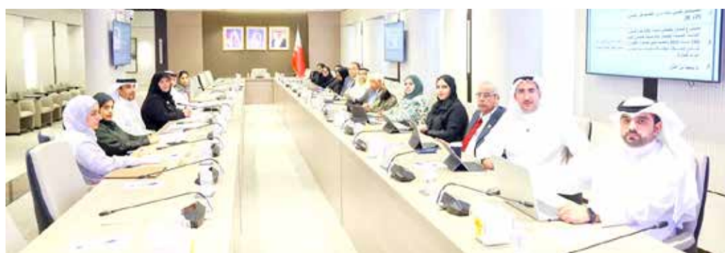
Shura Council's Legislative Committee

committee approval from the Civil Service Bureau and mandate skill transfer to local staff during the foreign worker's tenure.