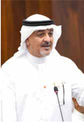
MP Jalal Kazim

The proposal specifically addresses the needs of senior citizens who may struggle with online services and require in-person assistance.