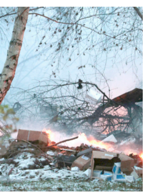
Burning goods following the crash of a cargo plane near the Vilnius International Airport in Vilnius

"So far, there are no signs or evidence suggesting this was sabotage or a terrorist act," Defence Minister Laurynas Kasčiunas told reporters, adding the probe to establish