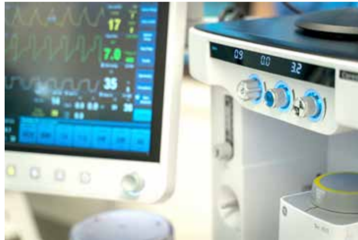
An anesthetic machine located in the operating room

The decision outlines that devices and products registered in