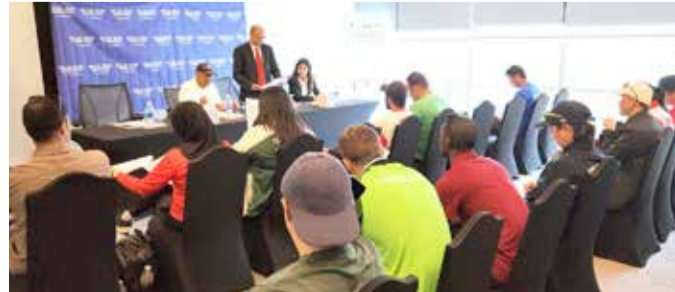
A press conference for the draws

cess in organizing last year's event earned them the honor of hosting again, highlighting Bahrain's growing prominence in the regional tennis scene.