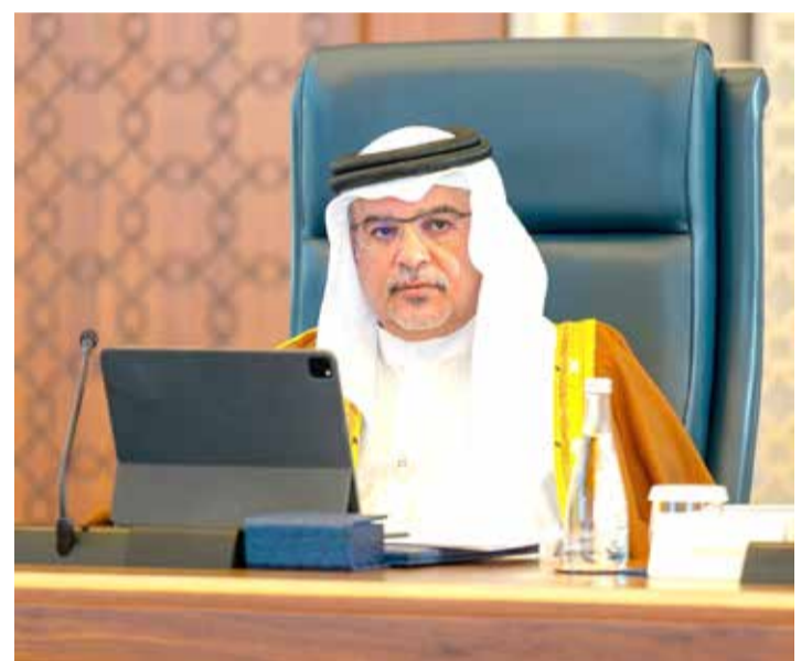
HRH the Crown Prince and Prime Minister chairs the weekly Cabinet meeting

The Cabinet praised the efforts of His Majesty the King's Representative for Humanitarian Work and Youth Affairs and Chairman of the Supreme Council for Youth and Sports, His Highness Shaikh Nasser bin Hamad Al Khalifa, as well