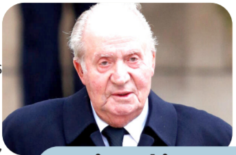
Spain ex-king Juan Carlos sued for alleged tax crimes by retired judges

Spain's disgraced former king Juan Carlos is being sued for alleged tax offenses by a group of retired judges, one of the complainants said yesterday. Spanish prosecutors in March 2022 closed three probes into his finances due to insufficient evidence and the statute of limitations, but said several irregularities had been found. Among them were lucrative gifts from Gulf Arab monarchies and private trips funded by a foundation based in the tiny European state of Liechtenstein. The complainants say a court rather than public prosecutors must decide if Juan Carlos fulfilled his tax obligations. Juan Carlos, 86, has made two payments worth more than five million euros to the Spanish tax authorities to settle money owed on undeclared income, widely viewed as a bid to avoid charges.