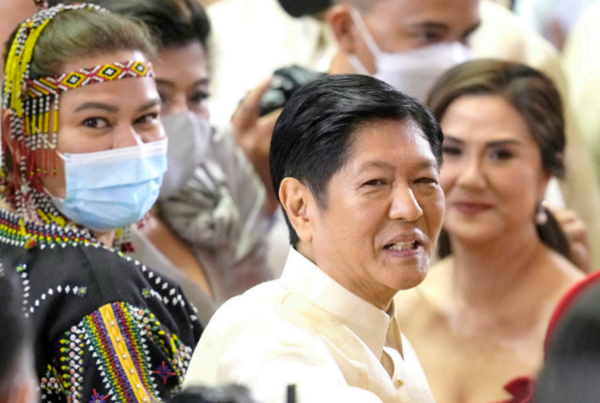
Philippine President Ferdinand Marcos (C) stands beside Vice President Sara Duterte (L) in a traditional dress after he delivered his first State of the Nation address at the House of Representatives in Quezon City, suburban Manila