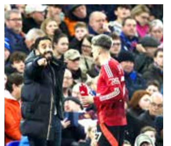
Ruben Amorim (L) gives indications to Alejandro Garnacho

Amorim has arrived from Sporting Lisbon to find a team