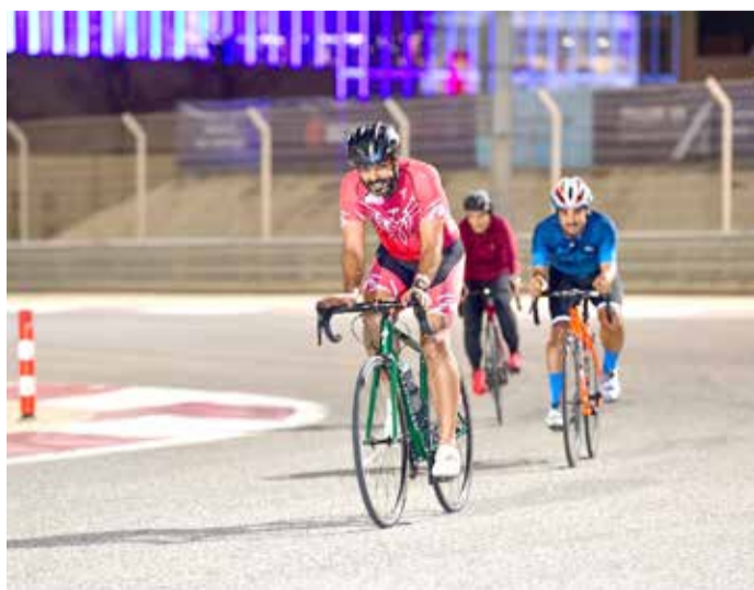
Cyclists ride on track at BIC

Runners and walkers will be utilising BIC's 2.550-kilometre