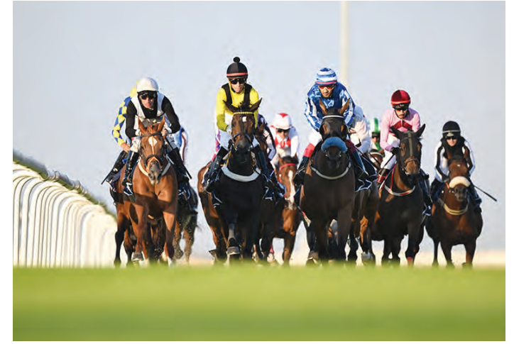
Action during a race at REHC (file photo)

and sixth races, in particular, cally bred horses, will also span ported horses vying for glory. ginner-level locally bred horses, are set to attract significant at- 1400 meters. The third race, The sixth race, the Alba Alumin- covering a 1200-meter distance. tention, featuring some of the open to third- and fourth-class ium for the World Cup, will be most formidable horses known imported horses, promises in- a high-speed 1000-meter sprint nowned horses and experienced for their strength and success on tense competition over the same distance.