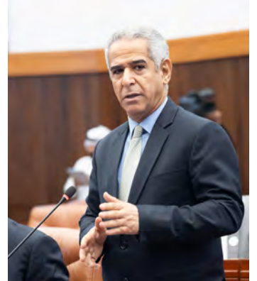
First Deputy Speaker Abdulnabi Salmab

MPs are urging the governthe soaring construction costs for securing alternative sources