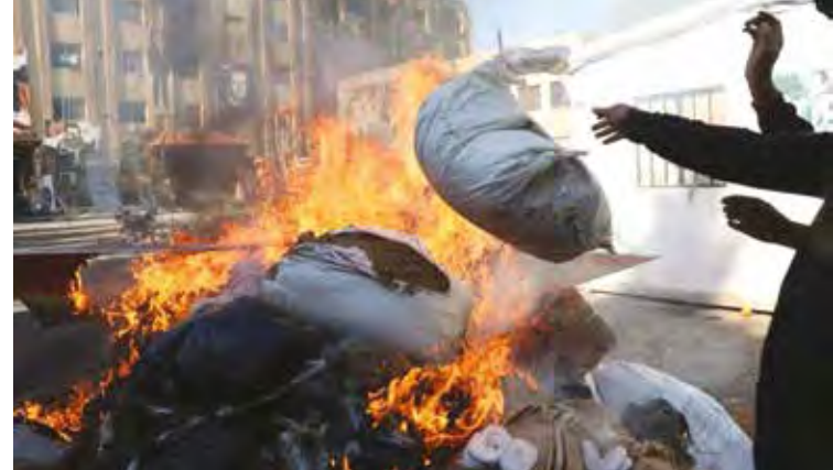
Syria's new authorities burn a cache of drugs at a facility formerly belonging to the security forces of the former government AFP | Damascus

war, effectively turning it into a forces in the capital's Kafr Sousa narco state under Assad.