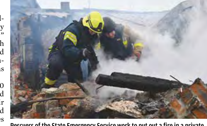
Rescuers of the State Emergency Service work to put out a fire in a private house after a drone strike in Kharkiv

Christmas to attack. What strike on Ukraine's energy sys- and in North Ossetia in the than 70 missiles, including bal-sia's campaign targeting the Ukraine said its air force