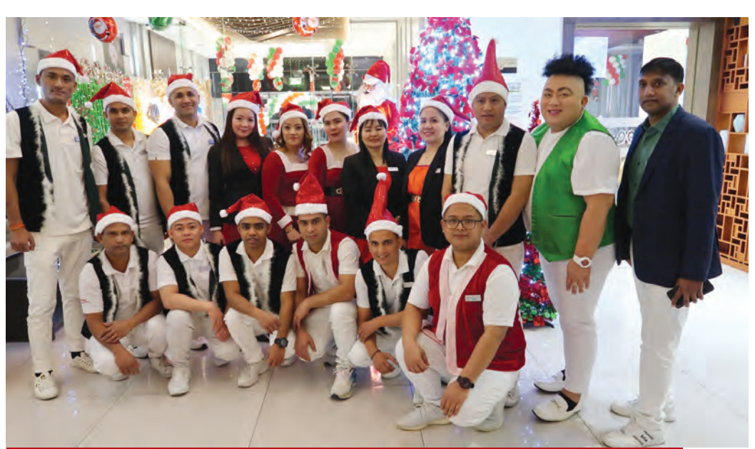
Christmas celebration at Pars International Hotel

Ambassador Ahmed Al Turaifi, Chief of Arab and African Affairs at Bahrain's Ministry of Foreign Affairs, emphasized Bahrain's leadership in regional initiatives: "The 44th Council here in Bahrain demonstrates our commitment to strengthening Arab efforts across all sectors. The opening remarks reflected our shared determination to unite and address challenges-whether social, economic, or otherwise—across the ue, affecting children, women, medical supplies using more Arab world," he told The Daily