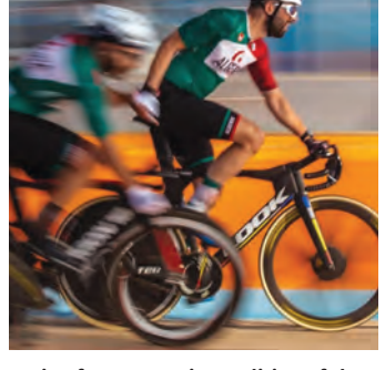
and technical standards, has Action from a previous edition of the

The championship, anticipated to be of high administrative attracted strong participation event