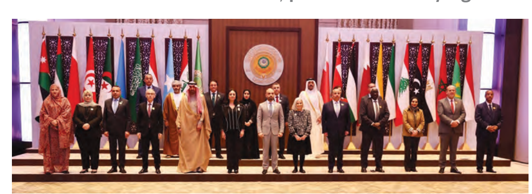
Minister during a group photo opportunity

Arab ministers meet in Bahrain, push for disability rights