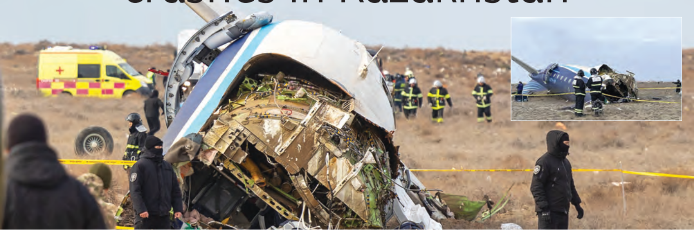
An Azerbaijan Airlines passenger jet crashed yesterday in western Kazakhstan, killing 38 of the 67 people on board, officials said. The Embraer 190 aircraft that was supposed to fly northwest from the Azerbaijani capital Baku to the city of Grozny in Chechnya in southern Russia but instead flew across the Caspian Sea and went down near the city of Aktau in Kazakhstan. ((Full story on pages 6-7)