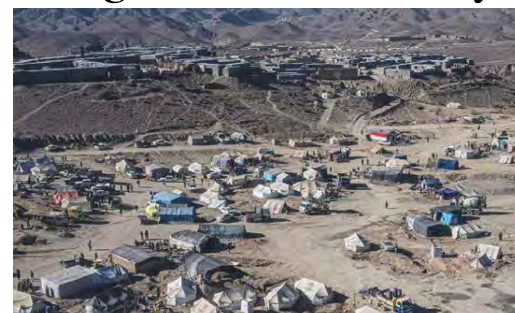
Tents and houses constructed by the United Nations refugee agency (UNHCR) in Barmal district, Paktika province (file

Pakistan conducted air strikes in Paktika province