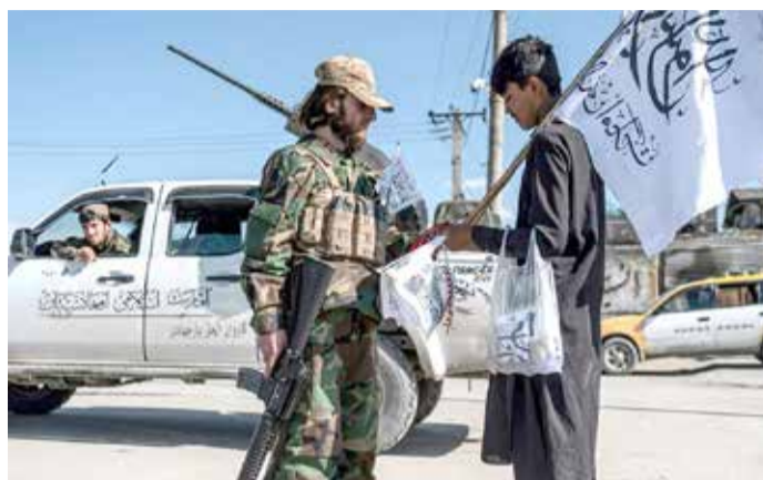
A Taliban security personnel talks with a flag vendor (file photo)

Taliban government officials have so far not responded to AFP requests for comment.