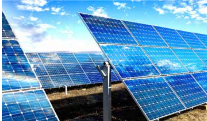
Solar panels offer great potential to save money on monthly utility bill

Furthermore, the more GCC countries invest in renewable energy, the more benefits they will receive such as major reduction in the solar electricity prices in the region, attracting more investors in the renewable energy business, the rise of innovative design of houses to utilise its structure in installation, and the rise of service and maintenance of solar technolo-