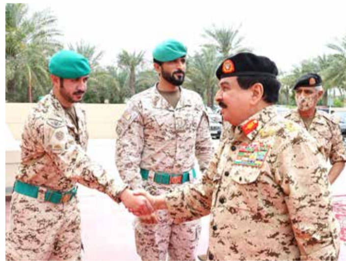
HM the King meets senior BDF officers

HM the King congratulated them on the blessed occasion, and requested them to convey his greetings and congratula-