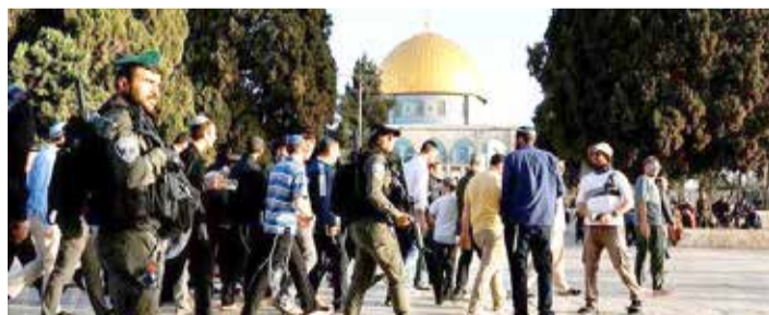
Israeli security forces walk next to settlers in Al Aqsa compound

He described the Israeli actions as an "unprecedented aggression against the sanctity of Al Aqsa, a desecration of its re-