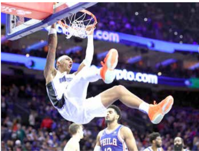
Paolo Banchero #5 of the Orlando Magic dunks during a game (file photo)