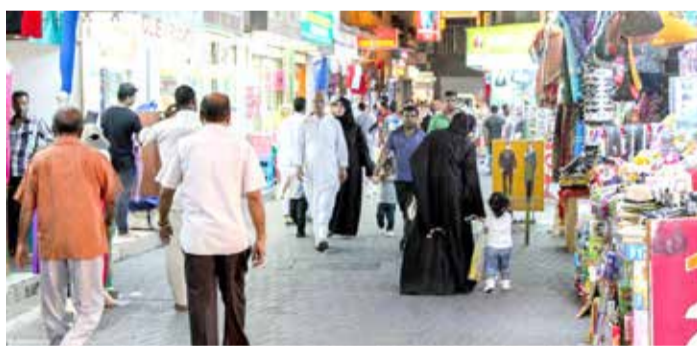
The Manama Souq is a shopper's paradise offering a wide variety of goods and a unique bazaar experience

Even if you are not looking for anything to buy, it is worth walking around the souq. From the colourful and most artistic way in which spices are kept, endless rows of brightly coloured clothes, and dimly lit cafes, the souq keeps surprising you