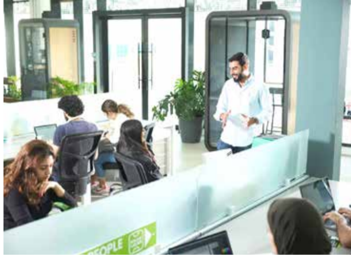
Bahrainis benefit from Tamkeen program through wage support and training. (Image used for illustrative purposes only)

Speaking to The Daily Tribune, a citizen said: "Me and my colleague were recruited by a construction company and we