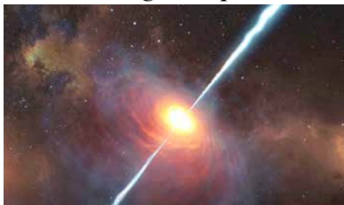
An artist's impression of how the distant quasar P172+18 and its radio jets may have looked