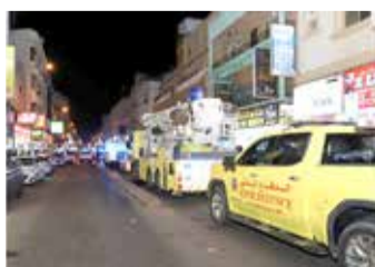
Firefighters arrive at the site

As soon as the situation was reported to the Control and Control Room of the General Directorate of Civil Defense from the main operations room, eight vehicles and 26 officers