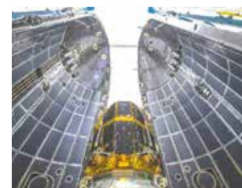
Hakuto-R Mission 1 lander stored in the fairing of SpaceX's Falcon 9 rocket

"It has been determined that there is a high probability that the lander eventually made a hard landing on the Moon's surface," ispace said in a statement.