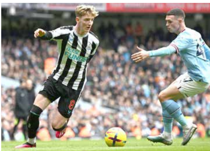
Newcastle United's Anthony Gordon (L) vies with Manchester City's Phil Foden (R) (file photo)

Howe, asked at a pre-match news conference yesterday if he was concerned about a hostile reception Gordon could receive at Goodison, replied: “You don't want to have or do anything that impacts the team, which is the most important thing.