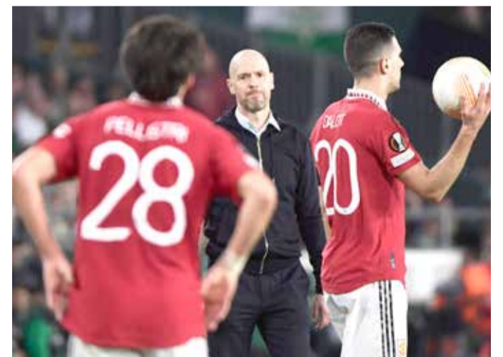
Manchester United's manager Erik ten Hag (C) looks at Facundo Pellistri (L) as Diogo Dalot prepares for a throw-in (file photo)