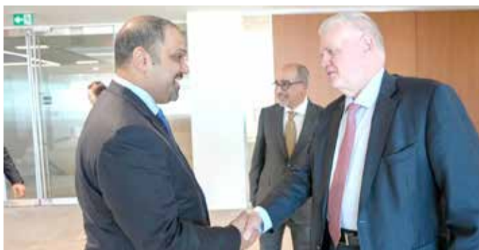
Shaikh Salman with the Standard Chartered Group CEO

He shed light on the business-friendly environment in Bahrain, which is conducive to the growth of financial sectors.