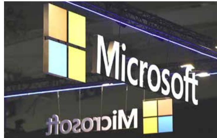
The logo of Microsoft is seen at an exhibition (file photo)

Microsoft already enjoys a powerful position and head start over other competitors in cloud gaming and this deal would strengthen that advantage, giving it the ability to undermine new and innovative competitors