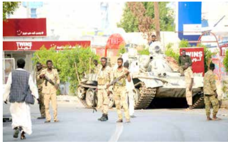
Sudanese army soldiers, loyal to army chief Abdel Fattah al-Burhan, man a position in the Red Sea city of Port Sudan

Amid the chaos -- which has killed hundreds, sparked a mass flight of terrified foreigners and