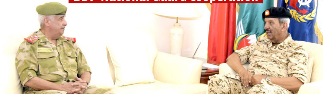
Commander-in-Chief of the Bahrain Defence Force (BDF), Field Marshall Shaikh Khalifa bin Ahmed Al Khalifa, received yesterday the Commander of the National Guard, General His Highness Shaikh Mohammed bin Isa Al Khalifa. They reviewed the aspects of the ongoing cooperation and coordination between the BDF and the National Guard.