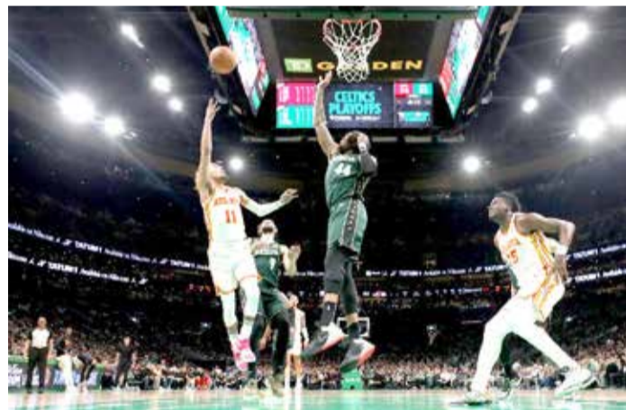
Trae Young #11 of the Atlanta Hawks shoots the ball against Robert Williams III #44 of the Boston Celtics

Hawks coach Quin Snyder praised his team's refusal to buckle in a game that the Celtics had controlled for long periods.