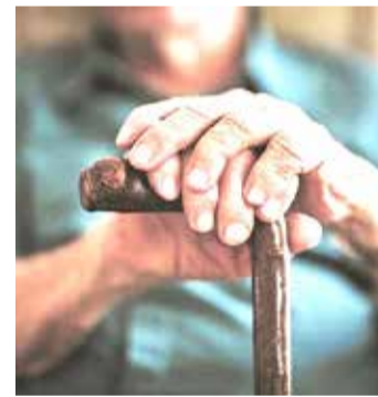
The government protects the rights of the elderly population

According to the study, the Kingdom is one of the first Arab countries which formed a National Committee for Elderly