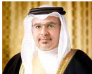
HRH Prince Salman TDT | Manama

His Royal Highness Prince Salman bin Hamad Al Khalifa, the Crown Prince and Prime Minister, yesterday issued a circular on the upcoming Labour Day.