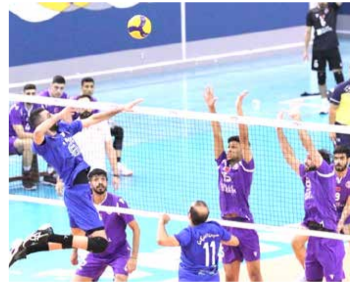
Al Nasser's Ebrahim Mohammed looks to attack the net against Dar Kulaib last night

● Recently crowned league champions to go for title double after advancing to gold medal contest with two-game sweep of Al Nasser