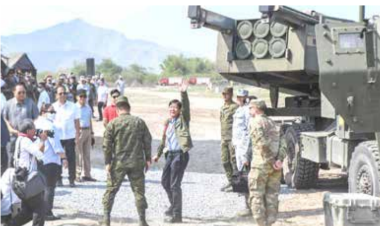
Philippine President Ferdinand Marcos (C) waves to photographers after inspecting a high mobility artillery rocket system (HIMARS)