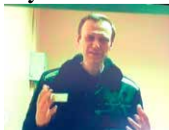
Alexei Navalny is seen on a screen via a video link

Navalny, 46, said that within the framework of the new extremism case he was told he would be separately judged by