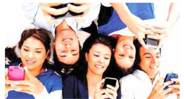
Social media can be a source of misinformation and addiction