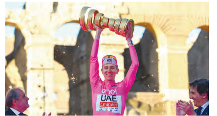
Team UAE's Slovenian rider Tadej Pogacar celebrates with the "Trofeo Senza Fine" (Endless or Infinity Trophy) on the podium