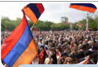
Thousands rally in Armenia against Azerbaijan land transfer

Thousands of Armenians staged an anti-government protest yesterday, demanding Prime Minister Nikol Pashinyan's resignation over territorial concessions to arch foe neighbour Azerbaijan. Protests erupted in the Caucasus nation last month after the government agreed to hand over to Baku territory it had controlled since the 1990s.