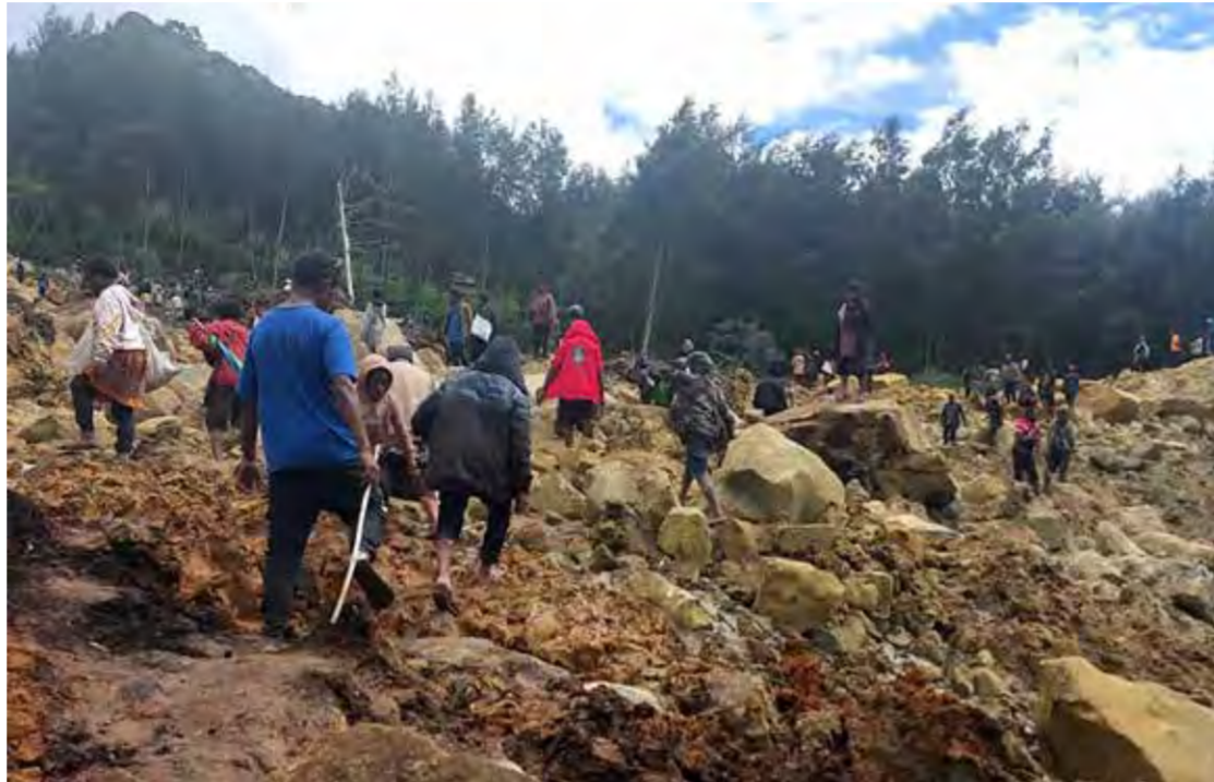
Locals walking on top of a landslide at Yambali Village in the region of Maip Muliitaka, in Papua New Guinea's Enga Province

More than 670 people are believed to have died after a massive landslide in Papua New Guinea, a UN official said yesterday as aid workers and villagers braved perilous conditions in their search for survivors.