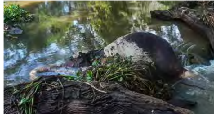
A carcass of a wild elephant, believed to have drowned following the onset of the South-West monsoon in Dimbulagala, 250 kilometres (155 miles) north-east of Colombo

He said autopsies will be carried out on the seven carcasses on Monday, but a preliminary investigation suggested that the animals had gotten