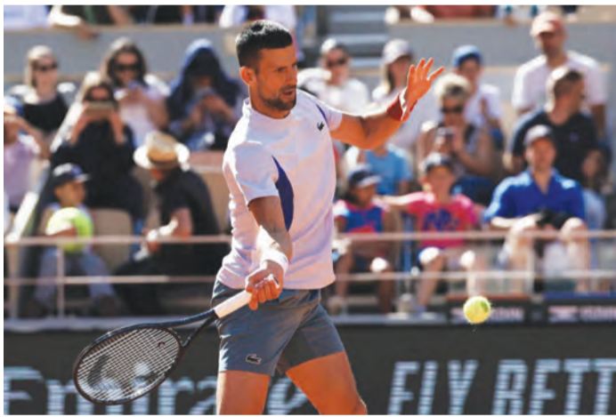
Serbia's Novak Djokovic takes part in a practice session

"Low expectations and high hopes," Djokovic told reporters when asked how he felt heading into the tournament.