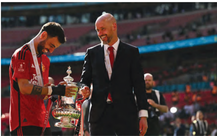
Manchester United's manager Erik ten Hag (R) and Bruno Fernandes hold the trophy as they celebrate their FA Cup victory

But Ten Hag gave Ratcliffe food for thought as his tactical masterclass inspired a 2-1 victory that foiled City's bid to win