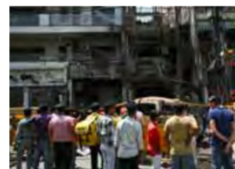
Men gather near the remains of an accident site a day after fire blazed through a children's hospital in New Delhi

Six newborn babies have died after a fire tore through a children's hospital in the Indian capital, with people charging into the flames to rescue the infants, police said yesterday.