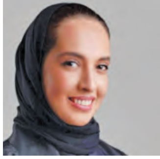
H.E. Amna bint Ahmed Al Romaihi

Housing Ministry launches urban sustainability initiative in East Sitra