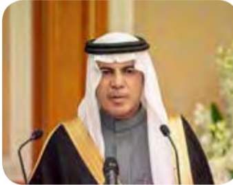
Saudi appoints Syria ambassador after more than a decade