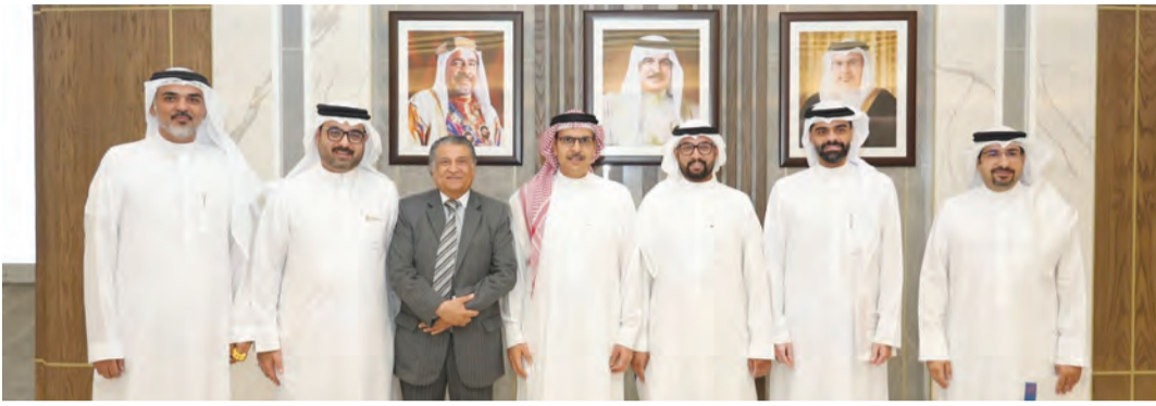
In pictures, participants during the seminar organised by Bahrian Chamber

Only companies with at least 51% Bahraini ownership will be granted Authorized Distributor status in the Kingdom, top Industry Ministry officials announced. They also clarified that the company must have its headquarters in Bahrain.