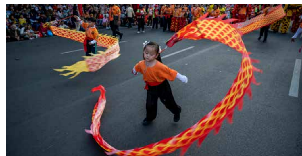
Young performers take part in the Surabaya Vaganza cultural parade in Surabaya, Indonesia's second largest city. The vibrant cultural parade is held annually in Surabaya, Indonesia, to celebrate the city's anniversary and showcase its rich cultural heritage.

Sri Lanka's wild elephant population has dwindled to just over 7,000, according to the latest official data, down from an estimated 12,000 at the beginning of the last century.