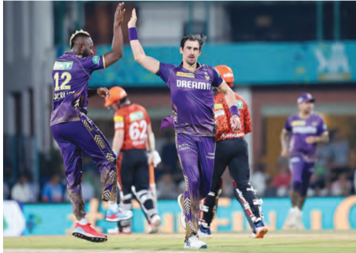
Kolkata Knight Riders' Mitchell Starc celebrates after taking a wicket

Starc went to Kolkata for a record $2.98 million in the December auction and ended the IPL with two stellar performances, including a match-winning 3-34 in the first play-off to hammer