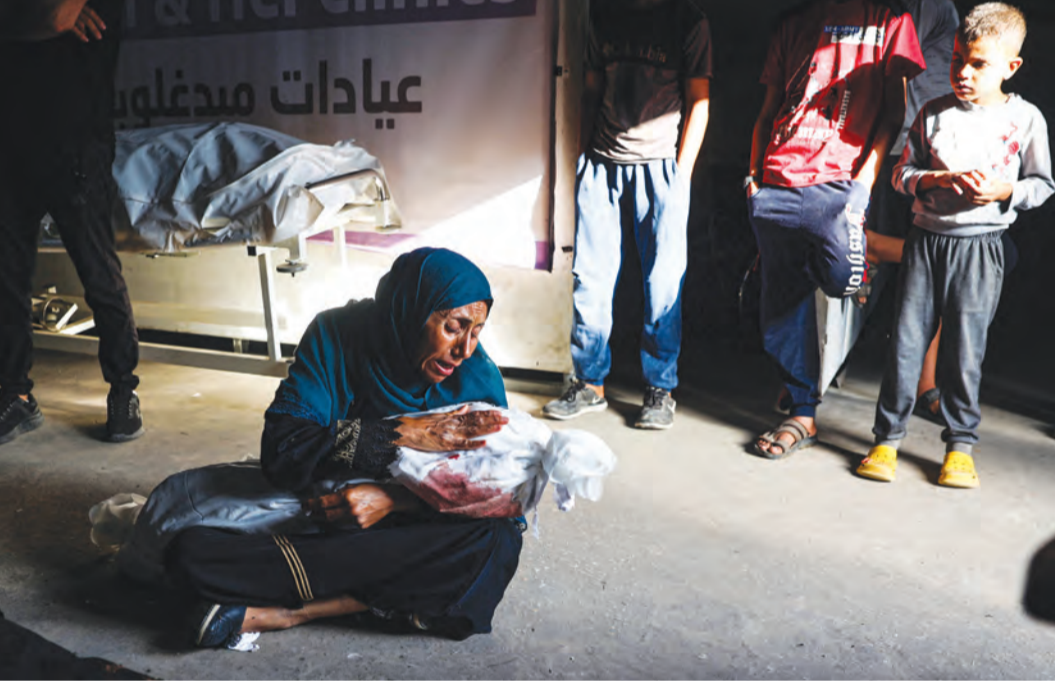
A child looks on as Palestinian woman holds the shrouded body of child killed in Israeli bombardment.

Israeli Prime Minister Benjamin Netanyahu said yesterday he "strongly opposes" ending the war in Gaza, ahead of his war cabinet convening amid intense diplomacy to forge a truce and hostage release deal. Meanwhile, deadly fighting rocked the Gaza Strip and Hamas fighters fired a salvo of rockets at Israel's commercial hub Tel Aviv for the first time in months, sending people scrambling for shelter. Netanyahu has long rejected Hamas's demand in negotiations for a permanent end to the fighting, which was triggered by the Palestinian group's October 7