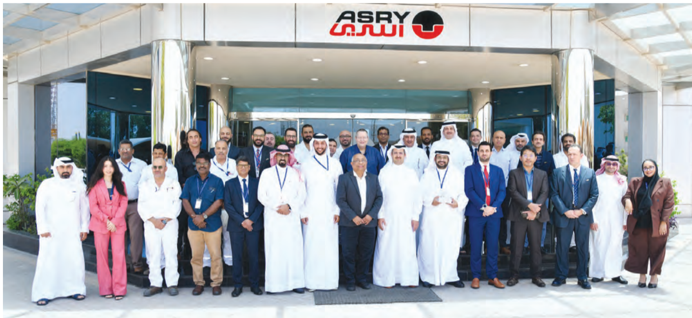
Participants during a group photo opportunity