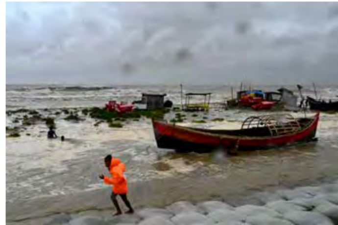
A man pulls a fishing boat to a sea shore as a preventive measure during rainfall in Kuakata

"We are terrified," said 35-year-old fisherman Yusuf Fakir at Kuakata, a town on the