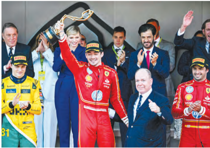
Ferrari's Monegasque driver Charles Leclerc (C-L) celebrates with the winner's trophy next to Prince Albert II of Monaco (C-R), second placed McLaren's Australian driver Oscar Piastrri (L) and third placed Ferrari's Spanish driver Carlos Sainz (R) on the podium

After climbing from his car, he jumped into the arms of his team