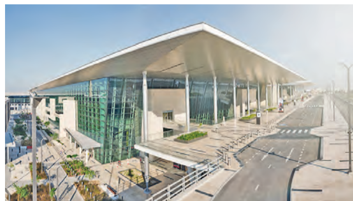
Bahrain International Airport

Muscat followed with a 36% increase at over 16,000 passengers. Riyadh and Kuwait City also showed growth, with over 50,000 and 31,000 passengers,