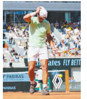
Spain's Rafael Nadal takes part in a practice session

week's time, has shown flashes of his best form in the clay-court swing, but was thrashed 6-1, 6-3 by Poland's Hubert Hurkacz in the second round of his last outing in Rome.