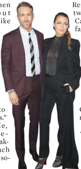
Ryan Reynolds and Blake Lively

"(They were) like, 'Oh, he's always just, as soon as he's done (at) work, there's no socialising."