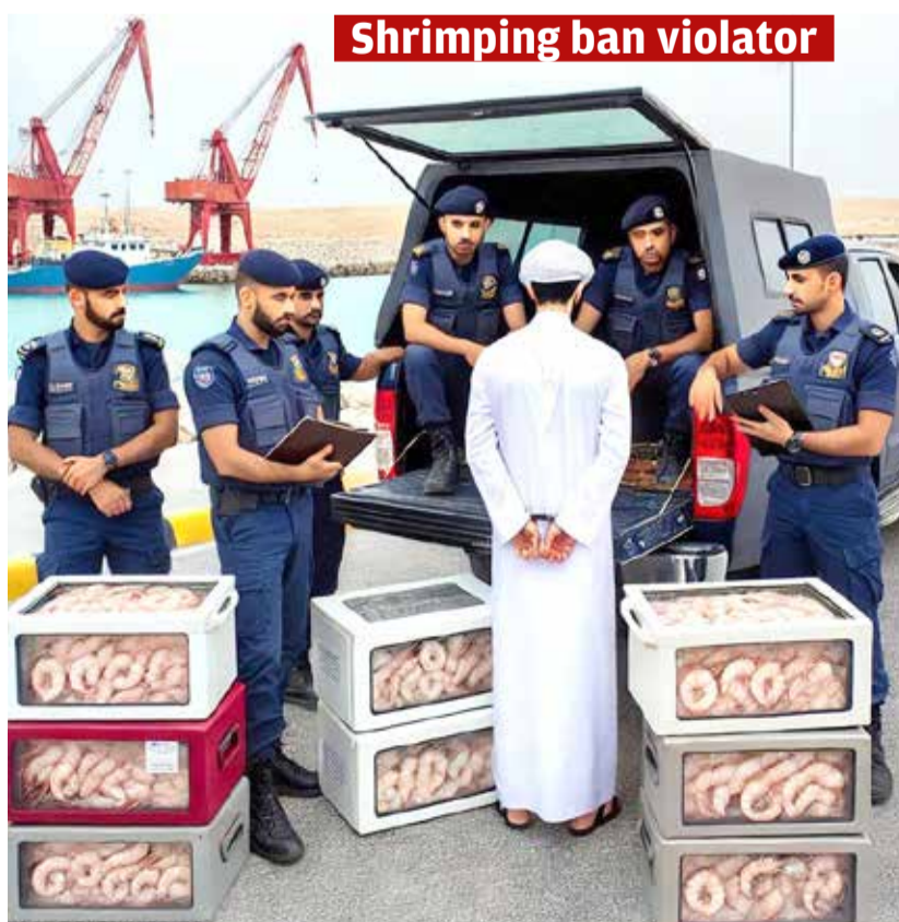
Shrimping ban violator

The programme provides students with the freedom to choose their desired specialisations.