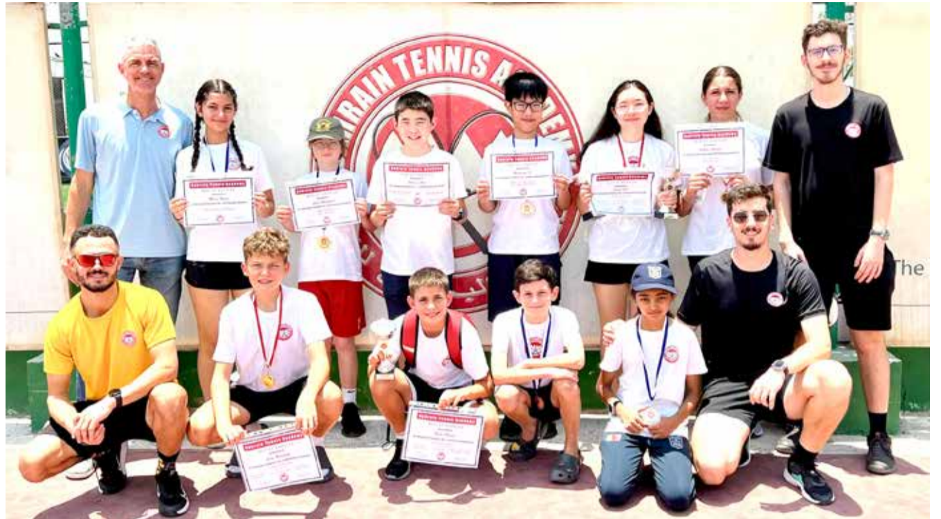
11-and-over award nominees and winners with BTA coaches.