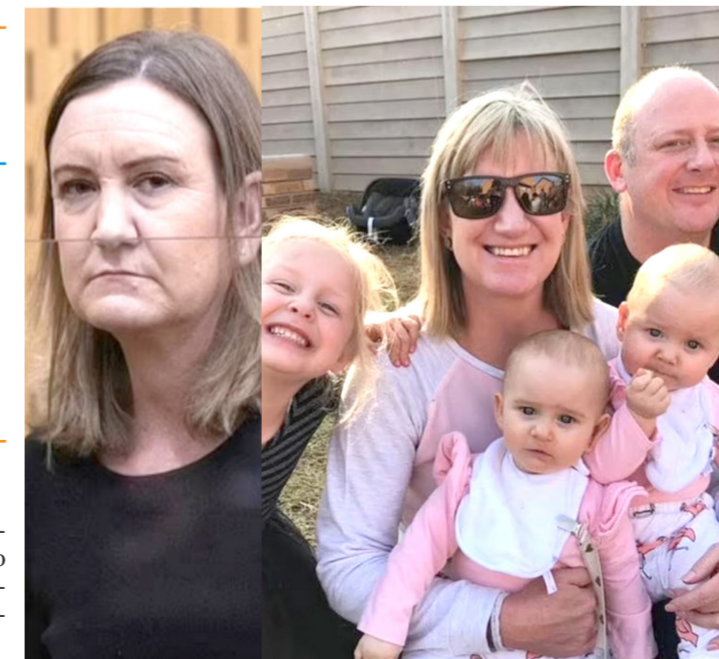
The judge ruled Dickason will spend 18 years - six for each daughter

New Zealand judge yesterday sentenced a woman to 18 years imprisonment for murdering her three young daughters in 2021.