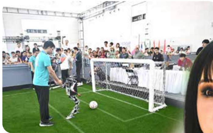
A prototype robot developed for the Robocup Asia-Pacific robotics football competition