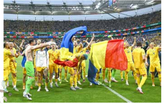
Romania's players and staff celebrate their group win Frankfurt, Germany

Romania and Slovakia both qualified for the last 16 at Euro 2024 after a tense 1-1 draw in their last Group E game on Wednesday.