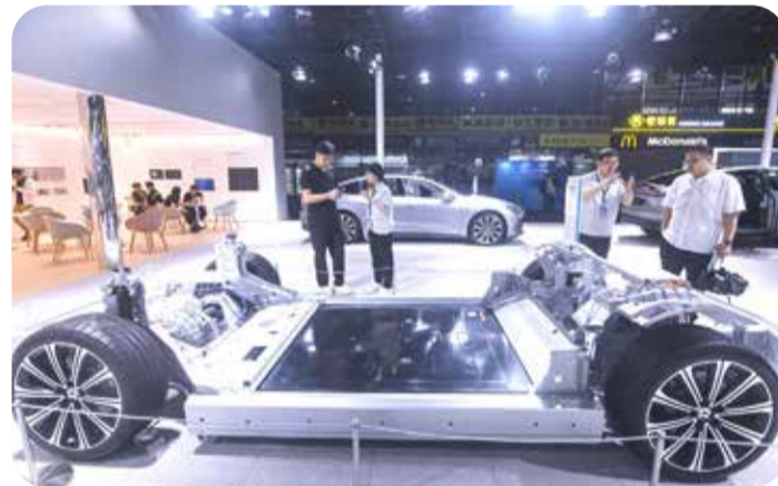
A chassis of a Nio car