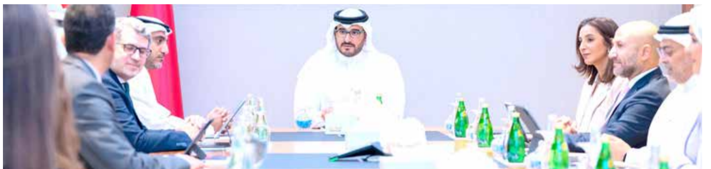
His Highness Shaikh Isa bin Salman bin Hamad Al Khalifa chairs Tamkeen's second quarter board meeting

The bundle, which aims to support over 700 Bahraini doctors and nurses, includes five main