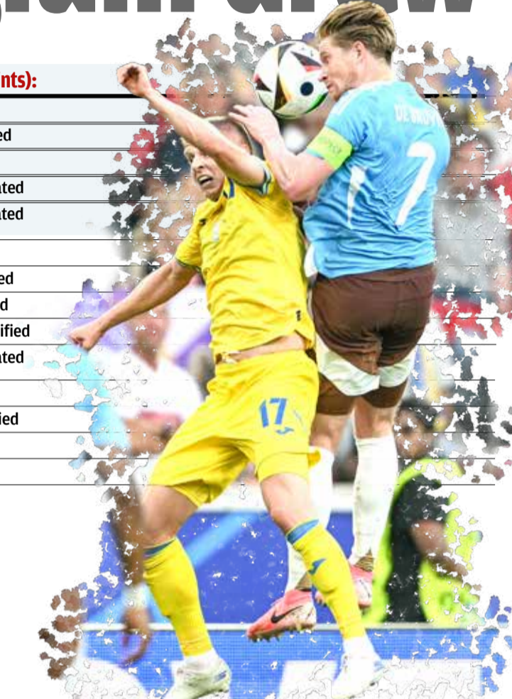
Belgium's midfielder #07 Kevin De Bruyne heads the ball past Ukraine's defender #17 Oleksandr Zinchenko

England will also be keeping a close eye as anything other than a Georgia or Czech win will see them meet the Netherlands in the last 16.