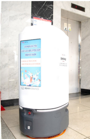
The administrative officer robot at the Gumi City Council building in Gumi.

A city council in South Korea said yesterday their first administrative officer robot was defunct after throwing itself down some stairs, with local media mourning the country's first robot suicide.