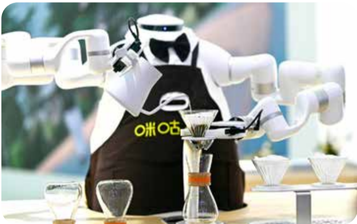
A robot makes coffee during the World Intelligence Expo in Tianjin

Deepfake scam calls -- where fraudsters manipulate images, sound or video of a real person as part of their con -- have been flagged as a growing risk as gen-