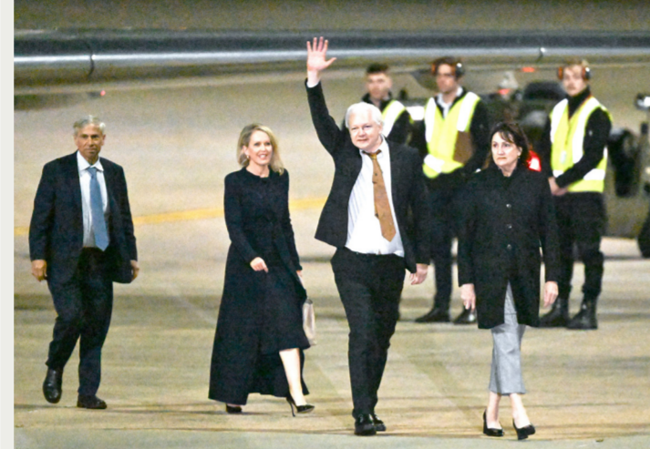
WikiLeaks founder Julian Assange waves after arriving at Canberra Airport in Canberra