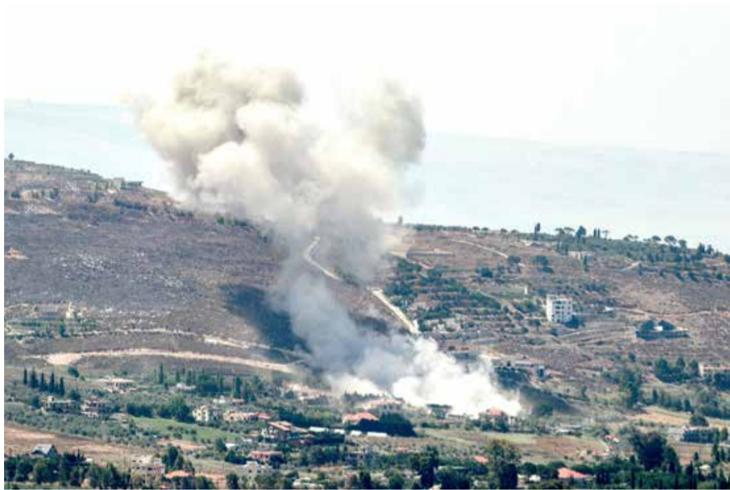
A smoke plume billows during Israeli bombardment on the village of Khiam in south Lebanon near the border with Israel.

Martin Griffiths, the UN humanitarian coordinator, told reporters in Geneva that he saw Lebanon as "the flashpoint beyond all flashpoints", pointing to southern Lebanon in particular.