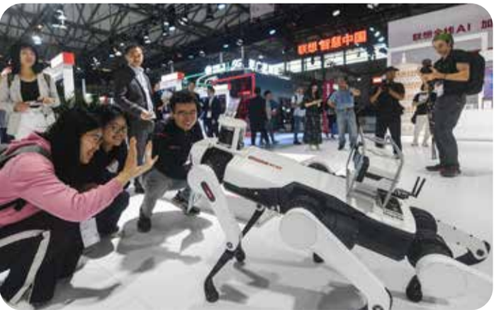
Visitors interact with a Lenovo robo