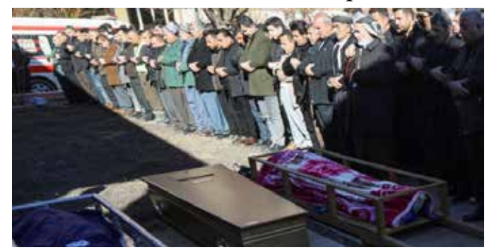
People pray next to bodies of Iraqi Kurdish migrants