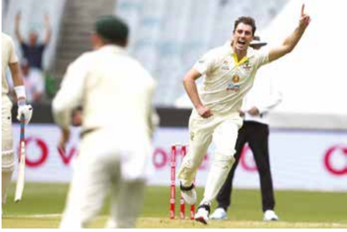
Australia's Pat Cummins celebrates taking the wicket of England's Haseeb Hameed