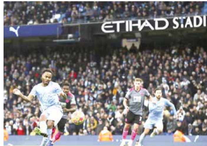
Manchester City's Raheem Sterling scores his side's fourth goal

Manchester City's Laporte and Sterling end Leicester comeback in 6-3 thriller