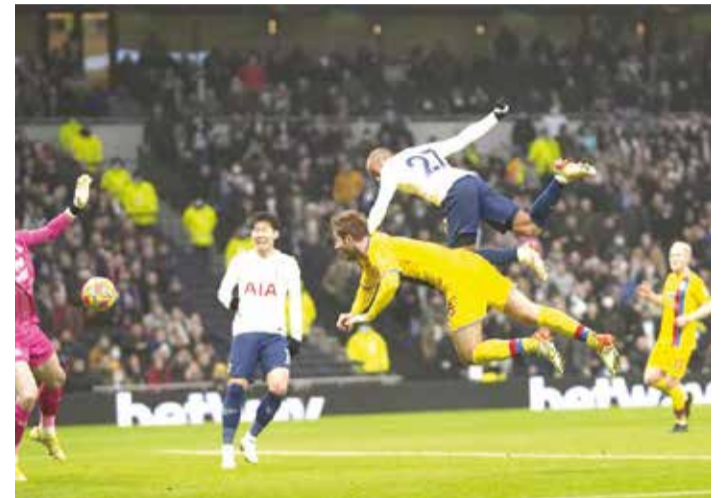
Tottenham's Lucas Moura scores his side's second goal against Crystal Palace

Saka added a second before Alexandre Lacazette's penalty and substitute Emile Smith Rowe rounded off a fifth con-