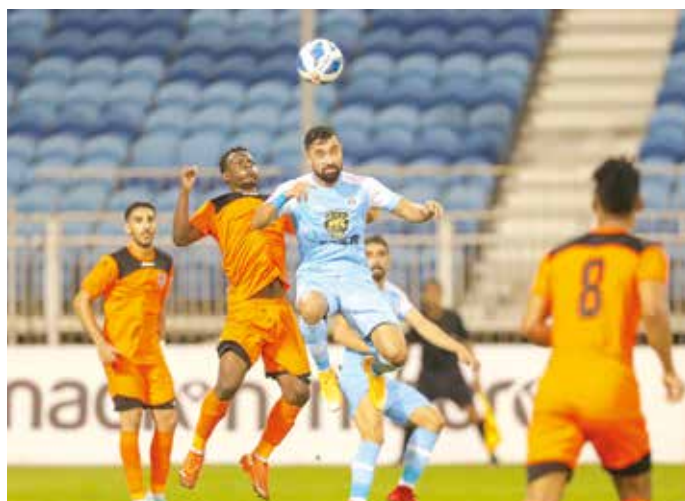
Action from Riffa's Round of 16 victory over Al Hala (File photo)

semi-finals, while the victors of a 2-0 win over Galali, where- after it was 1-1 at the end of regclash in the other final four Club 4-2 in penalty kicks after to march through.