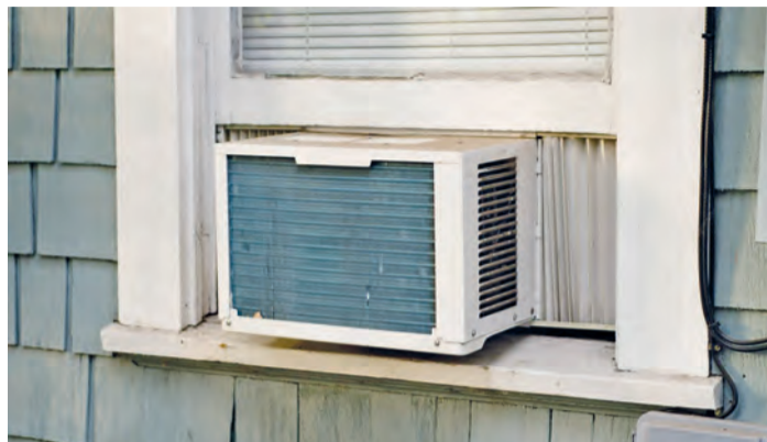
AC failures are main problem at the peak of summer

After careful evaluation, he recommends investing in AC units equipped with piston compressors, as they have