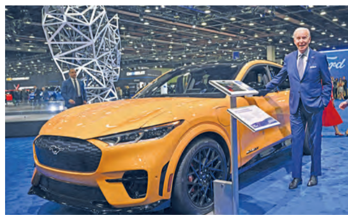
US President Joe Biden looks at an electric Ford Mustang as he tours the 2022 North American International Auto Show in Detroit, Michigan

The Ford spokesperson insisted the decision about the $3.5 billion battery plant had not been related to the ongoing strike, but rather the site's future economic viability.