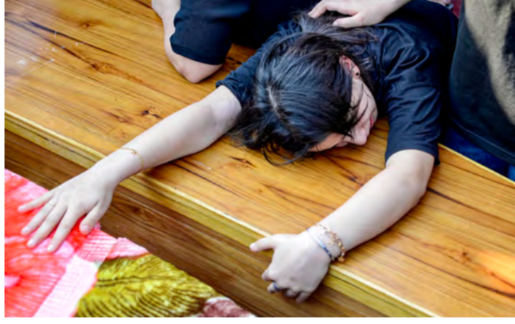
A woman mourns over a coffin