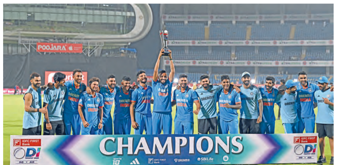
India's players pose with the series trophy

Maxwell got the first three wickets including skipper Rohit Sharma, for 81, and star batsman