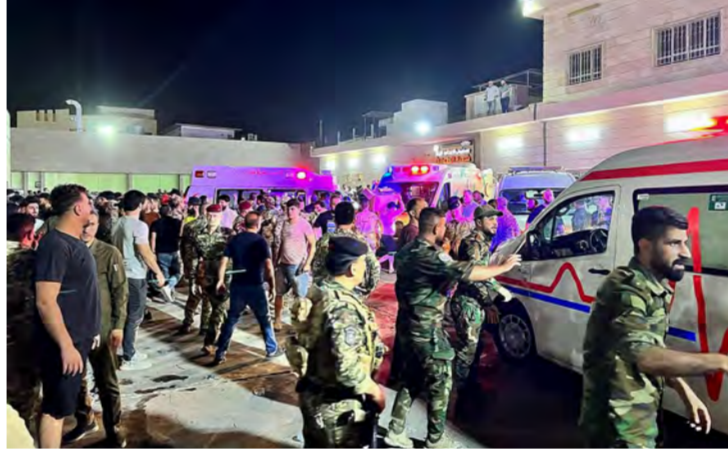
Soldiers and emergency responders gather around ambulances