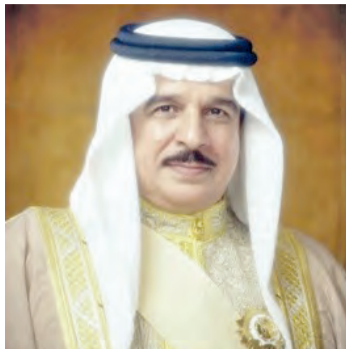
HM the King

HRH the Crown Prince and Prime Minister affirmed that the kingdom will carry on spreading the noble Islamic values and principles called for by Prophet Mohammed (PBUH), by promot-