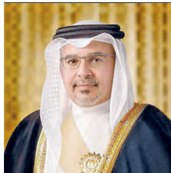
HRH Prince Salman

ing coexistence, tolerance, mutual respect and human fraternity, which has made Bahrain a beacon of peace and coexistence.