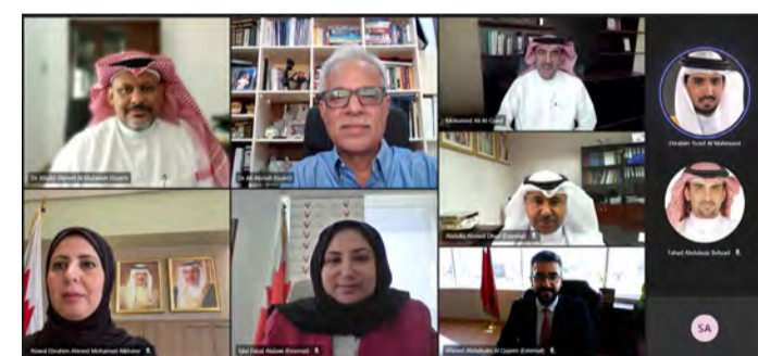
Al Qaed chairs the virtual discussion

Al Qaed welcomed the attendees, thanking them for their contributions. Items on the agenda included the latest developments and technical preparations concerning the 10th Bahrain International eGovernment Forum, set to take