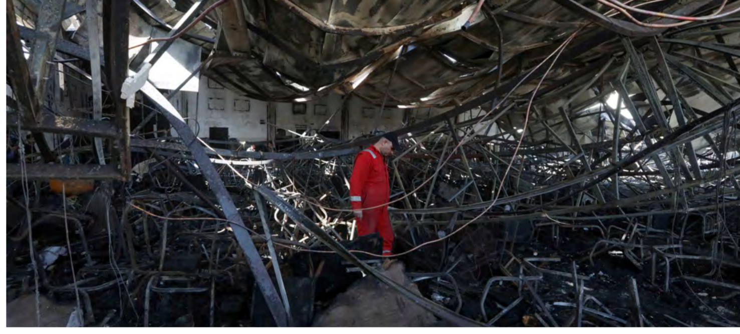
A firefighter checks the damage in an event hall in Qaraqosh, also known as Hamdaniyah, after a fire broke out during a wedding, killing at least 100 people and injuring more than 150