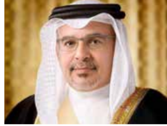
HRH Prince Salman