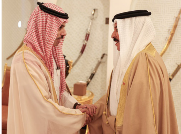
HM the King and HRH Prince Salman receive the Saudi Foreign Minister

HM King Hamad also praised the pioneering role of Saudi Arabia under its leadership in serving GCC, Arab and Islamic issues.