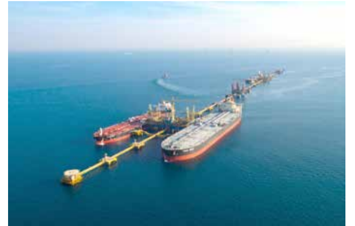
Dhahran oil plants, in eastern Saudi Arabia

● Aramco reported record profits totalling $161.1 billion last year