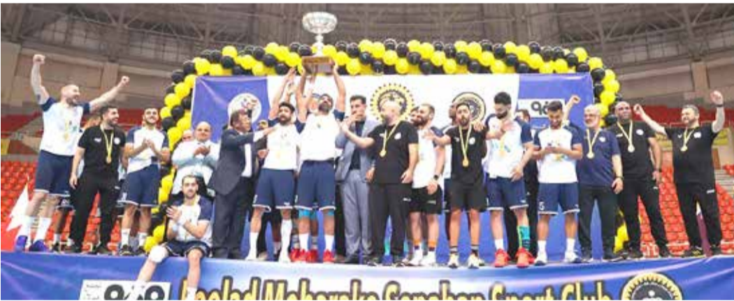
Najma players and officials celebrate winning the Asian clubs title last June in Isfahan (File photo)

The prestigious global competition, organised by the International Handball Federation