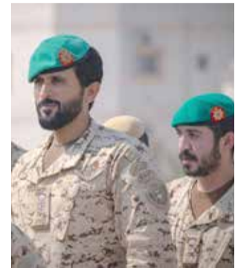
HH Shaikh Nasser and HH Shaikh Khalid at the funeral prayer

They extended the condolences of His Majesty King