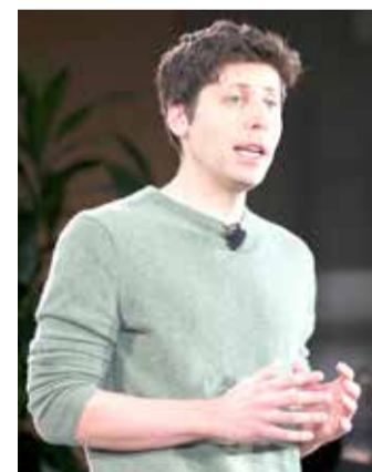
OpenAI CEO Sam Altman New York, United States

The generative AI platform ChatGPT can now fetch data directly from the internet and gather up-to-date information in real-time, its creator OpenAI said Wednesday, in a major milestone for the software.