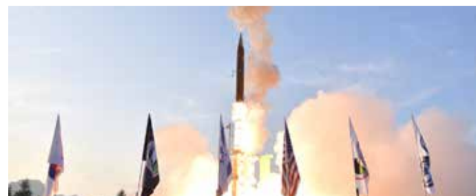
The launch of the Arrow-3 hypersonic anti-ballistic missile at an undisclosed location in Alaska.

Israel's fears of attacks from Iran and other foes have led it, together with its top ally the United States, to develop hi-tech systems designed to knock incoming rockets and missiles