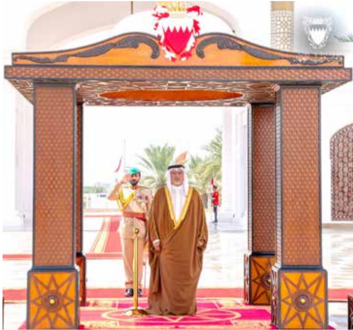
HRH Prince Salman receives a salute from Lieutenant-General His Highness Shaikh Nasser bin Hamad Al Khalifa, National Security Advisor and Royal Guard Commander

The ambassadors extended to His Majesty King Hamad their heads of states' greetings, wishing the Kingdom and its people further progress and prosperity while commending longstanding bilateral relations at all