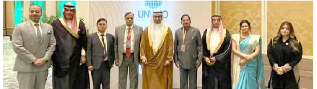
Mr. Abdullah bin Adel Fakhro, Minister of Industry and Commerce and Acting Minister of Tourism, met with Shripad Yesu Naik, Indian Minister of Culture and Tourism, on the sidelines of his participation in the World Tourism Day ceremonies and events in Riyadh, which was held under the slogan "Green Tourism and Investment" and organised by the Ministry of Tourism in the Kingdom. Fakhro stressed the Kingdom of Bahrain's keenness to continue complementary efforts in the tourism sector between the Kingdom and India. The two sides praised the growth and development witnessed by the tourism sector in the two countries.