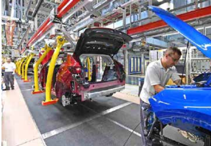
The economy fell into recession around the turn of the year, and has struggled to recover since