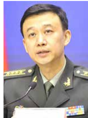
China's defence ministry spokesperson Wu Qian