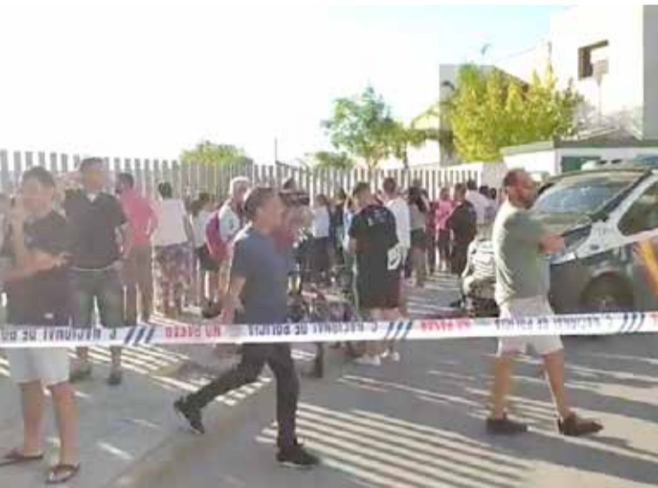
Several students told Spanish media the pupil first stabbed members of his class and the teacher