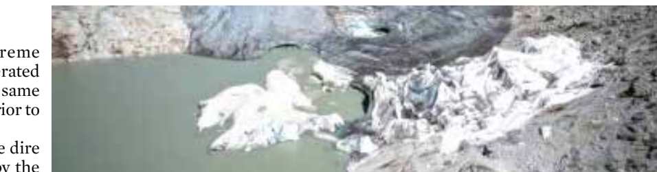
Insulating foam covering a part of the Rhone Glacier to prevent it from melting, and exposing small glacial lakes on its surface due to the ice melting.

dramatic glacial retreat, and warned the situation would only get worse.