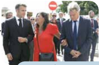
France's Macron proposes 'autonomy' for island of Corsica