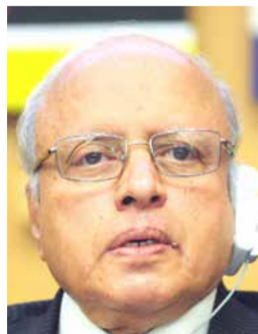
The UNESCO ecotechnology director, known as the father of the "Indian Green Revolution", Monkbombu Sambasivan Swaminathan