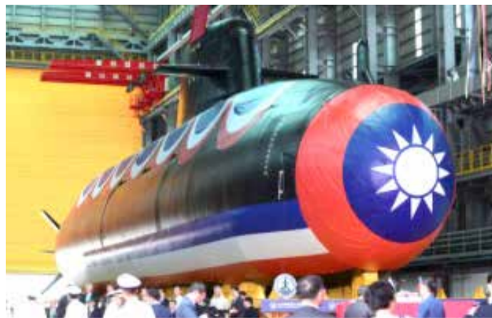
Taiwan's first locally built submarine "Narwhal" is seen before Taiwan's President Tsai Ing-wen unveils it at the CSBC Corporation shipbuilding company in Kaohsiung

President Tsai Ing-wen -- strongly opposed by Beijing