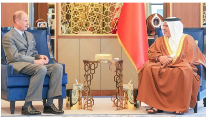
HRH the Crown Prince and Prime Minister meets with the Duke of Edinburgh

He welcomed The Duke of Edinburgh and the accompanying delegation to the Kingdom of Bahrain.