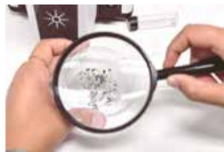
The team identified nine types of polymers and one type of rubber

"If the issue of 'plastic air pollution' is not addressed proactively, climate change and ecological risks may be-