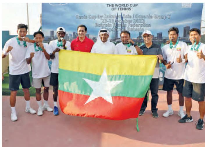
Myanmar players with officials celebrate their promotion