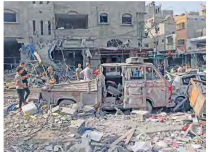
People gather amid the destruction following Israeli strikes on Al-Shateh camp in Gaza City

Hamas said all internet connections and communications across Gaza had been cut, and accused Israel of taking the measure "to perpetrate massacres with bloody retaliatory strikes from the air, land and