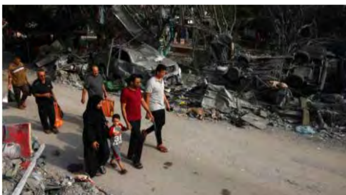
People walk past wrecked cars in the aftermath of Israeli bombing in Rafah in the southern Gaza Strip

Bombs, one after another, rained down for hours overnight, much of the Gaza Strip has become an indistinguishable wasteland of rubble, with residents likening the devastation to that of a natural disaster.