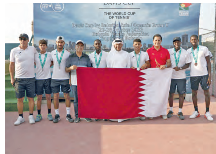
Qatar's delegation after securing their place in Asia/Oceania Group IV

Also yesterday, Bahrain defeated Brunei 2-1 to claim fifth overall on the competition's final ranking, while Nepal outplayed the Maldives 3-0 to take seventh. Macau were classified ninth af-