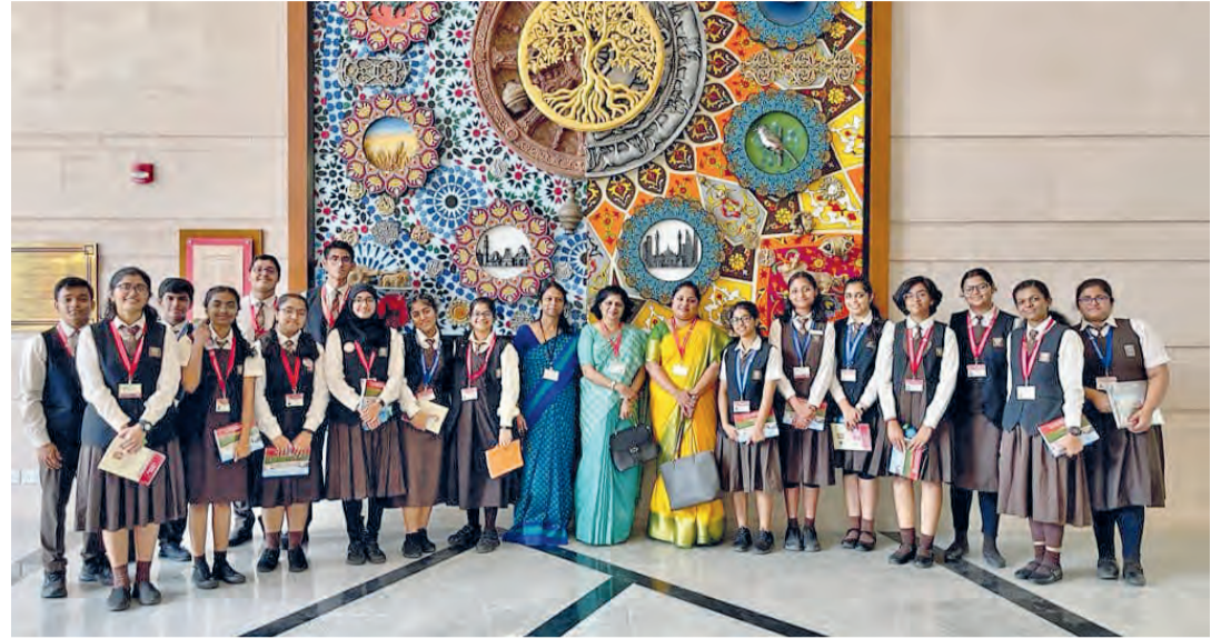
Students of the New Indian School visited the Embassy of India, Kingdom of Bahrain. The 'Visit Embassy' programme was launched by the school with the objective of familiarizing the students with the functioning of an embassy. Officials welcomed the first batch of the students under the 'Visit Embassy' programme and briefed them about the various roles and different sections within the Embassy. His Excellency Vinod K Jacob, Ambassador of India to the Kingdom of Bahrain, interacted with the students and held a Q&A session with the children.