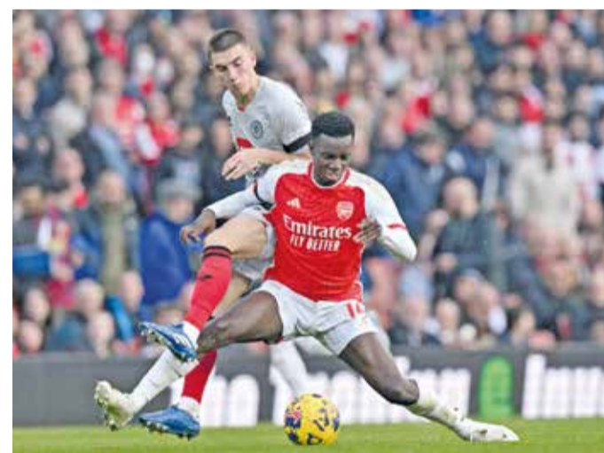
Sheffield United's Luke Thomas (L) vies with Arsenal's Eddie Nketiah