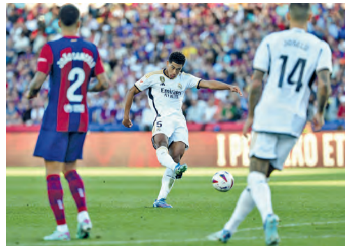
Real Madrid's Jude Bellingham scores the equalizing goal