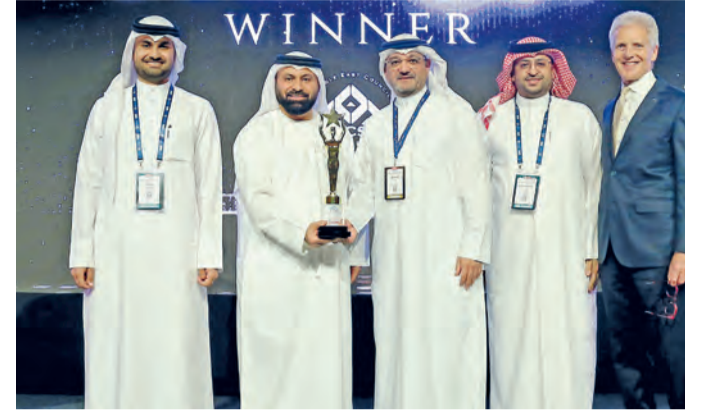
The award ceremony