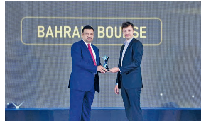
The award presentation