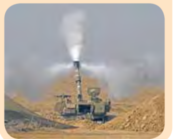
members," Turk said. (Continued on page 2)

Israel's bombardment has displaced more than 1.4 million people inside Gaza, according to the UN, while supplies of food, water and power to the crowded territory have been almost completely cut off.