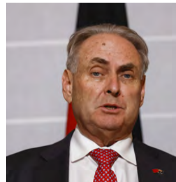
Australia's trade minister, Don Farrell

Farrell said the issue of European geographical indications had yet not been settled, in a podcast interview with The Conversation released mid-week.