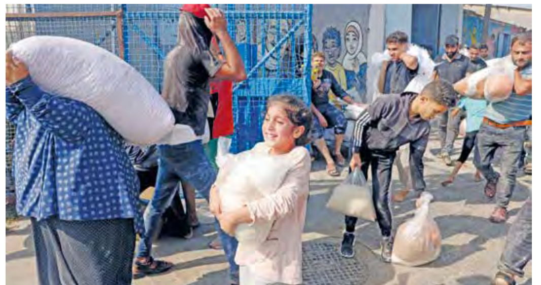
Palestinians collect boxes and bags from a UN-run aid supply center, distributing food to local Palestinians and people displaced following Israel's call for more than 1 million residents in northern Gaza to move south for their safety, in Deir al-Balah

Israeli air strikes destroyed hundreds of buildings in the Gaza Strip overnight, the civil defence service in the Hamas-controlled Palestinian territory said