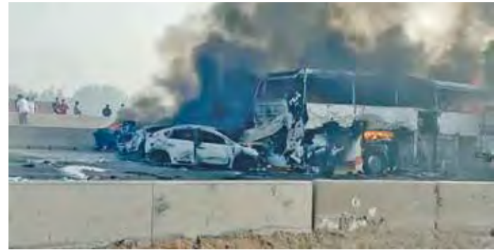
Heavy black smoke billows from charred vehicles following a collision on the Cairo-Alexandria desert road near Wadi al-Natrun

dia depicted a scene of devastation, with an overturned lorry blocking the fast lane on charred asphalt. Further along, there were at least one bus and a minibus, both extensively damaged by fire, as well as numerous cars, some of which were still engulfed in flames. Onlookers stood by the roadside, observing the crash site, while queues of cars lined up nearby, with thick black smoke billowing into the air.