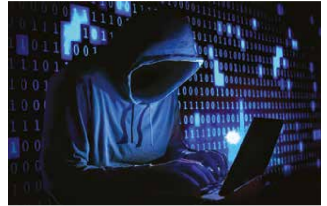
Cyberattacks in various sectors are for real!

CBS reported that this initiative has helped in reducing the amount of food excess that is sent to the municipality's landfill in Askar, the only existing landfill in Bahrain which will reach its capacity soon, raising an environmental concern to the surrounding areas.