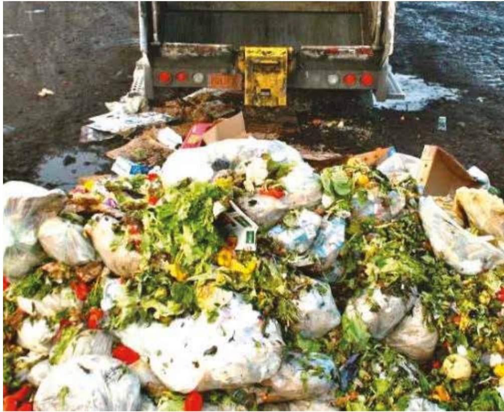
Excessive food waste during the holy month (Image used for illustrative purposes only).

The Ministry of Municipalities Affairs and Agriculture has called for rationalisation of food consumption during the month