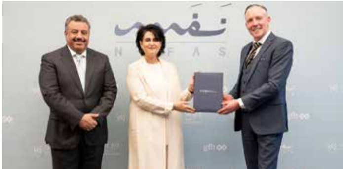
Officials following the deal signing

Nuwah Foundation (Nuwah), part of Bahrain's GFH Financial Group, has signed a Memorandum of Understanding (MoU) with the United Kingdom's acclaimed The Revoke Programme to operate the newly launched Nafas Well-being and Rehabilitation Centre in Al Areen, Bahrain.