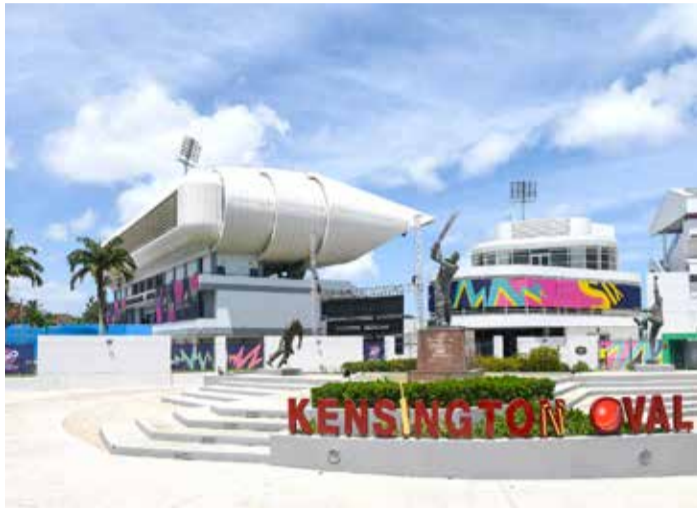
The statues of Sir Garfield Sobers (C), Sir Charles Griffith (L) and Sir Wesley Hall (R) ahead of ICC men's Twenty20 World Cup 2024 at Kensington Oval, Bridgetown, Barbados, on May 24, 2024. The ICC men's Twenty20 World Cup 2024 will be played in the United States and the Caribbean from June 1 to June 29.

The USA has been an associate member of the International Cricket Council since 1965 and frequently competed in the tournaments for non-Test nations. But the Americans have never featured in either the T20 World Cup or the ODI version, with their only appearance in a