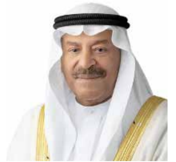
Ali Bin Saleh Al Saleh, Chairman, Shura Council