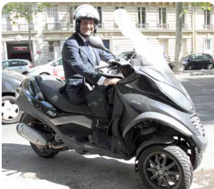
President of the Correze General Council and candidate for the French Socialist Party 2012 primary elections, Francois Hollande

Hollande went on to marry Gayet in 2022, and on Sunday, France's most famous scooter was auctioned off at a chateau in the town of Montbazon in western France, according to an AFP correspondent.