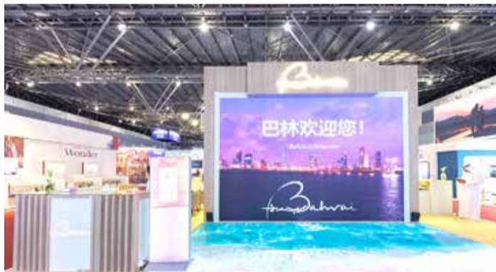
The Bahrain pavilion offers tourism packages