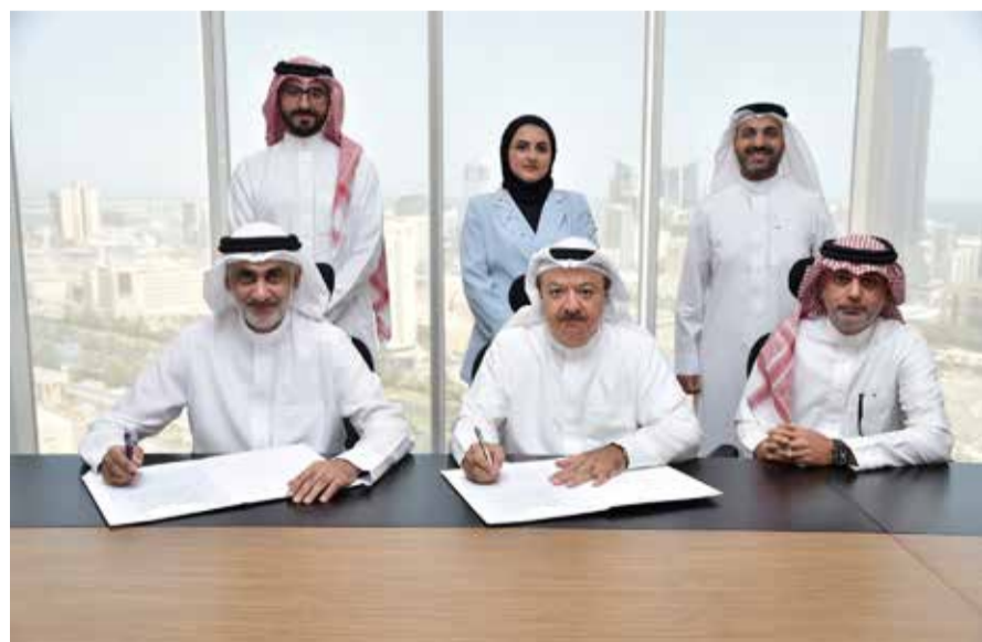
Al Salam Bank launches new Watercraft Finance offering Sea World