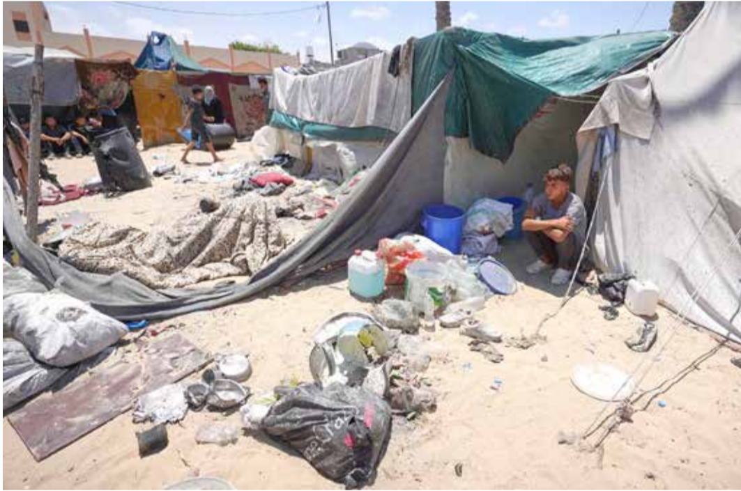
Displaced Palestinians at a makeshift displacement camp in Rafah's Mawasi area, which was hit by Israeli bombardment.

Such a plan would ensure that Israel is not in control of