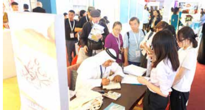
Tourists from various countries flock to the Bahrain pavilion

Festival, the Bahrain Holiday Season, and the Spring of Culture, as well as prestigious international events such as the Formula 1 Gulf Air Bahrain Grand Prix.