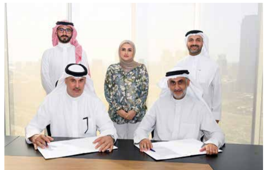
Launches new Watercraft finance offering Yamaha