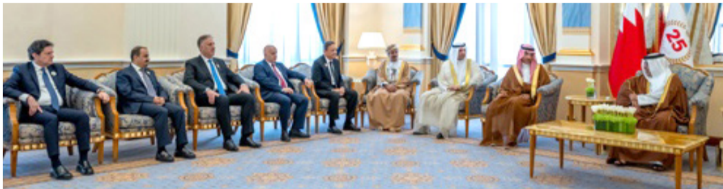
HRH Prince Salman with the Arab Ministers of Information Affairs

In turn HRH Prince Salman conveyed the greetings of His