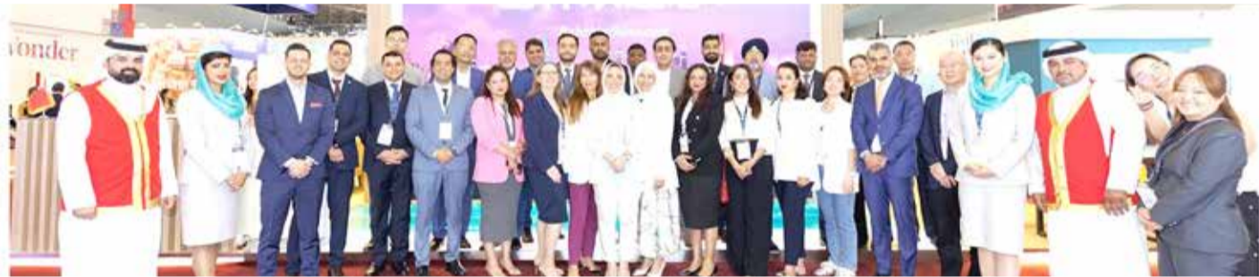
The Bahrain delegation at the event

They also presented Bahrain's vibrant agenda, featuring cultural festivals like the Bahrain Food