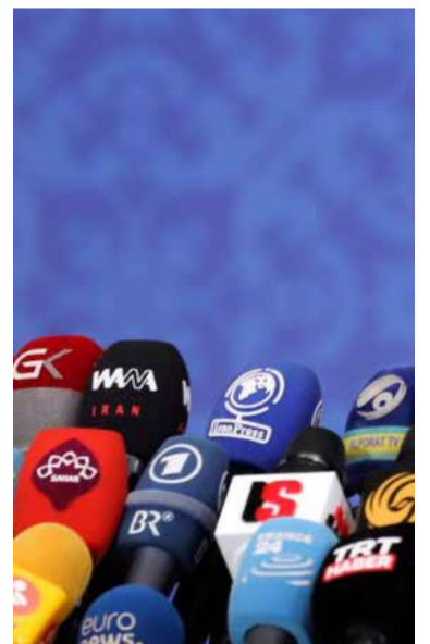
Iran's President-elect Ebrahim Raisi speaks

Raisi succeeds Hassan Rouhani on Aug. 3, having secured victory this month in an election marked by voter apathy over economic hardships and political restrictions.