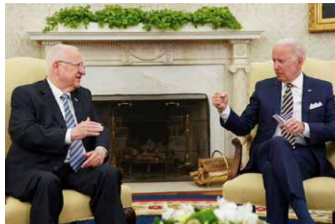
Biden meets with Israel's President Reuven Rivlin at the White House in Washington