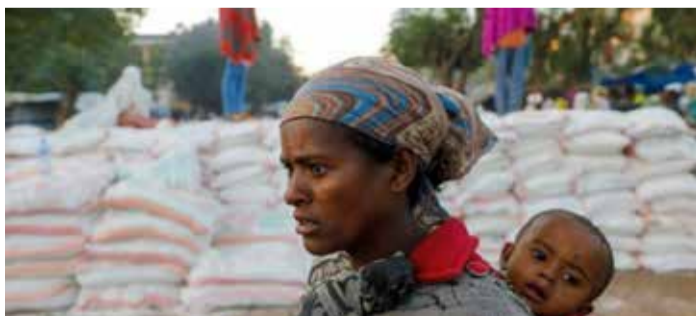
A woman carries an infant as she queues in line for food, at the Tsehaye primary school, which was turned into a temporary shelter for people displaced by conflict, in the town of Shire, Tigray region, Ethiopia

People in Mekelle, where communications were cut on Monday, said the incoming Tigrayan fighters were greet-