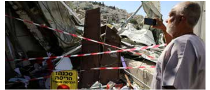
A Palestinian man uses his mobile phone as he stands near the debris of a shop that Israel demolished in the Palestinian neighbourhood of Silwan in East Jerusalem