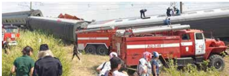
The train was carrying around 800 passengers

train derailment. Nine carriages derailed. Seven of them overturned. Provisionally, more than 100 people have been injured," the emergency situations ministry said. About 30 people were hospitalised, including 15 children, and 22 ambulance crews were despatched to the scene to treat the injured, the TASS news agency reported. The country's Investigative Committee said it had launched a criminal probe into the incident.