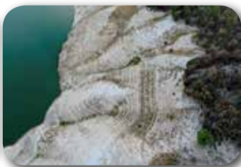
An aerial view shows low water levels at Lake Oroville, California