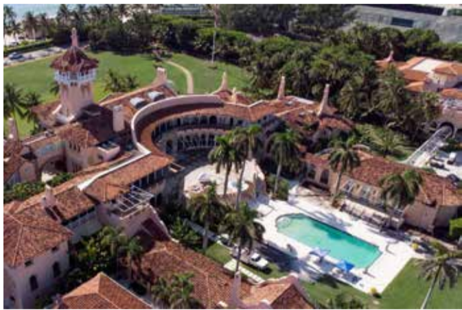
An aerial view of former US President Donald Trump's Mar-a-Lago home

A special master is an independent third-party sometimes appointed by a court in sensitive cases to review materials potentially covered by attorney-client privilege to ensure investigators do not improperly view them.