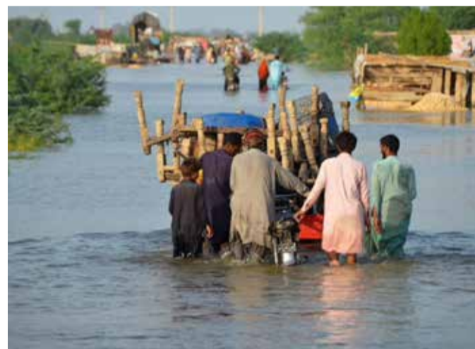
Men walk along a flooded road with their belongings, following rains and floods during the monsoon season in Sohbatpur, Pakistan