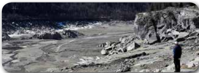
A man stands near the Ceresole Reale Lake, which provides water to the Piedmont region through a dam, dried following weeks of drought at the Gran Paradiso National Park, in Ceresole Reale, Italy,