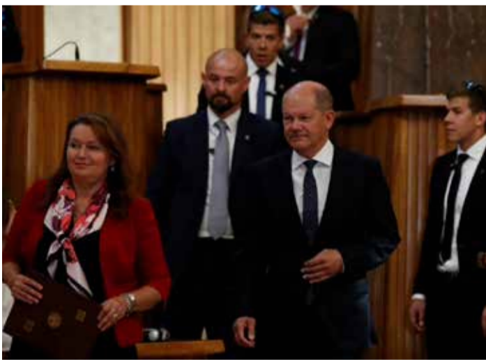
German Chancellor Olaf Scholz arrives to give a lecture at Charles University in Prague, Czech Republic